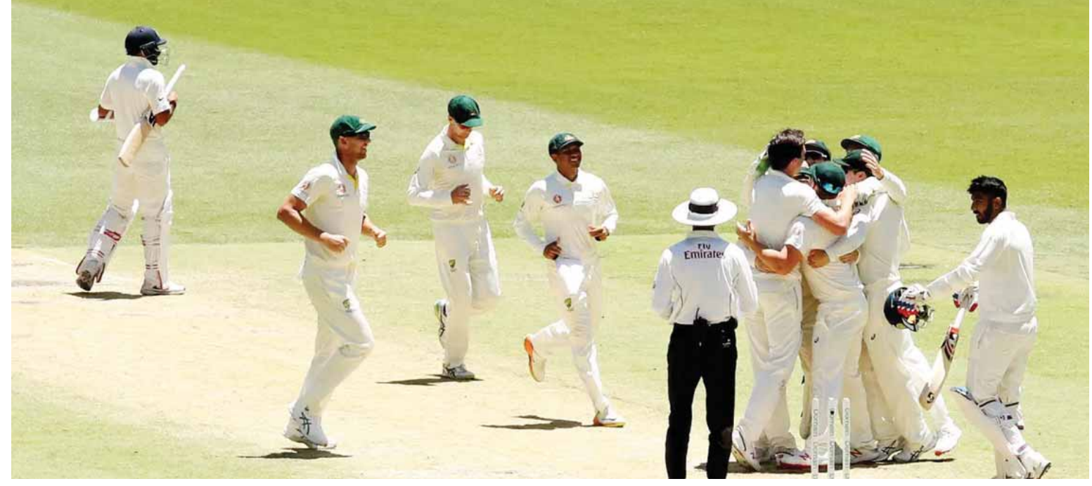
Both Pant, who played a key role in India's series victory last time, and Carey are known for their aggressive brand of cricket. "Carey is aggressive, Rishabh is aggressive. The game is going to go one or two ways really quick. And I think that will be so important. "Maybe when you are five down and the second new ball comes just before stumps and they take it for 50 that 10 overs before stumps, that

PTI ■ SYDNEY Former captain Aaron Finch believes Rishabh Pant and Alex Carey will be crucial in determining the outcome of the Border-Gavaskar Trophy, while retired wicketkeeper Brad Haddin predicts that Indian batters will struggle against the Australian pacers. Finch feels the two wicketkeepers have the ability to shift the momentum in their team's favour in the event of a top-order collapse. "I think the key could be Alex Carey and Rishabh Pant. The two wicketkeepers are going to be so important," Finch said on 'Willow Talk Podcast' when asked where this series is going to be won or lost. "A time or other in series the top order will get knocked over as both fast bowling attacks are so good and they will get on a roll. For me, it is that really crucial role of Alex at number seven and Rishabh at number six likely."