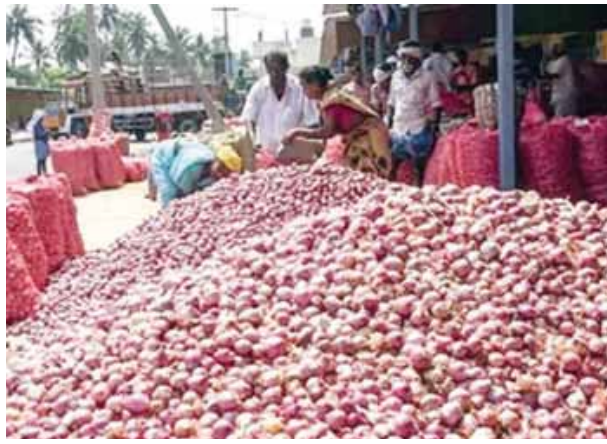
per kg in Nashik. Onions are not produced in Odisha and hence, the state is dependent on other states. Prices of onion and garlic are high outside the state