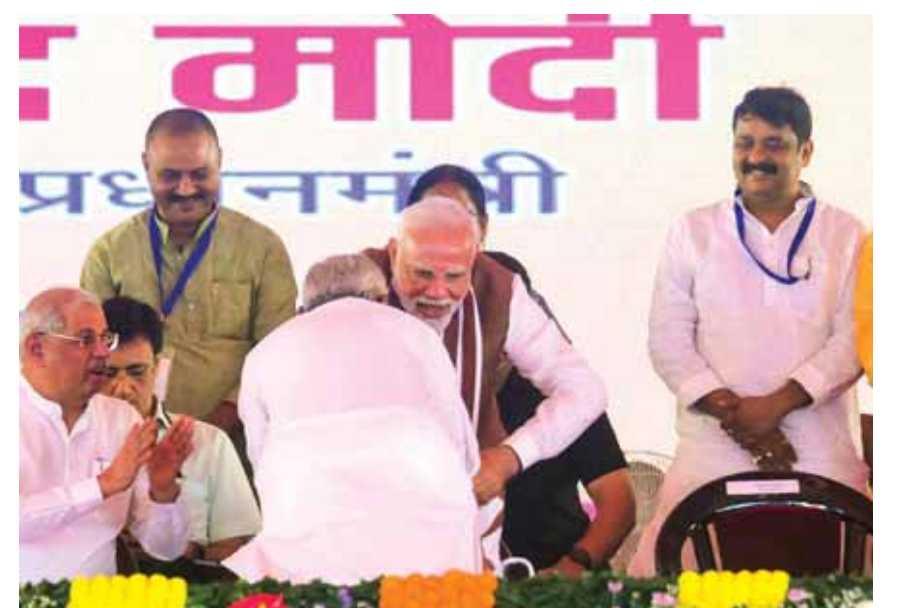
Bihar Chief Minister Nitish Kumar took everyone by surprise at an event in Darbhanga when he tried to touch Prime Minister Narendra Modi's feet. In a video that has gone viral on social media, Nitish Kumar, 73, walked towards PM Modi, 74, with folded hands and bowed to touch his feet in a third such instance this year. However, PM Modi quickly stops the JD(U) leader from touching his feet and is seen shaking his hands. Another video that has gone viral from the same event shows Modi pulling Nitish Kumar to his side as party workers garland the Prime Minister