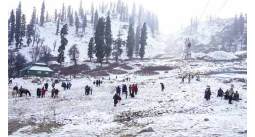
Tourists play in the snow at a ski resort after season's first snowfall at Kongdoori area of Gulmarg, in Baramulla district, Jammu and Kashmir, Tuesday