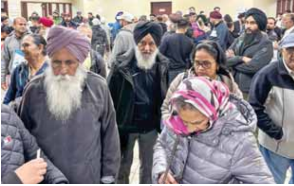
Indians at a consular camp in Brampton, Ontario, Sunday, November 3, 2024. The consular camp witnessed "violent disruptions" on Sunday as per Indian High Commission in Canada PTI

Brampton's Hindu Sabha Temple on Sunday, prompting the High Commission of India in Ottawa to issue a strong statement, condemning the attack by "anti-India" elements. Jaiswal also pointed out that it remains "deeply concerned" about the safety and security of its citizens in that country, asserting that the diplomatic officers providing consular services to Indians "will not be deterred by intimidation, harassment and violence". "We remain deeply concerned about the safety and security of Indian nationals in Canada. The outreach of our Consular officers to provide services to Indians and Canadian citizens alike will not be deterred by intimidation, harassment and violence," he said. According to a PTI report from Ottawa, protestors