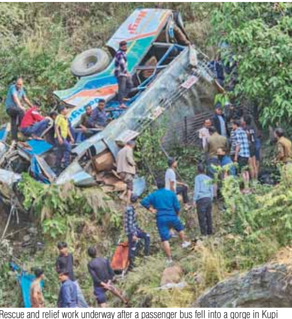
Rescue and relief work underway after a passenger bus fell into a gorge in Kupri area, in Almora, Uttarakhand

Sources in the poll panel said political parties had requested for a change in the polling date, citing festivals such as Kalpathi Rastholsavam (November 13-15), Kartik Purnima (November 15) and Prakash Parv of Sri Guru Nanak Dev (November 15). The parties said the festivals may impact voter turnout in these states. "Representations have been received in the Commission from various recognised national and state political parties (including BJP, INC, BSP, RLD) and some social organisations for change of date for poll in some Assembly constituencies having by-elections on 13th November, 2024, considering large scale social, cultural and religious engagements on that day which may cause inconvenience to large number of people, give rise to various logistic issues and may lead to reduced voters participating during the poll," the EC said.