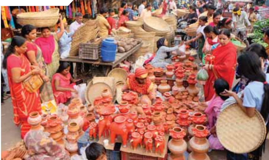
People purchase bamboo baskets and other items ahead of the 'Chhath Puja,' in Gurugram