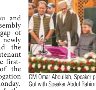
CM Omar Abdullah, Speaker pro-tem Mubarak Gul with Speaker Abdul Rahim Rather

The portals of the Jammu and Kashmir Legislative Assembly were thrown open after a gap of more than six years allowing newly elected members to attend the maiden address of Lieutenant Governor Manoj Sinha to the first-ever legislative Assembly of the Union Territory after the abrogation of articles 370 and 35-A on Monday. The last Budget session of the Mehbooba Mufti-led Peoples Democratic Party-Bharatiya Janata Party (PDP-BJP) alliance government was adjourned sine die by the speaker on February 13, 2018. The alliance government later collapsed in June 2018 leading to the Governor's rule. On August 5, 2019, the erstwhile state of Jammu and Kashmir was reorganised into two Union territories. Meanwhile, a ruckus broke out on the floor of the Assembly soon after the unanimous election of veteran National Conference leader Abdul Rahim Rather as speaker of the house. Waheed ur Rehman Para, a PDP MLA, tried to grab the limelight by bringing in a resolution against the abrogation of Article 370 without giving any advance notice to the chair. Chief Minister Omar Abdullah reacted on the spur of the moment calling out the act as a mere photo exercise. It was also 'vociferously'