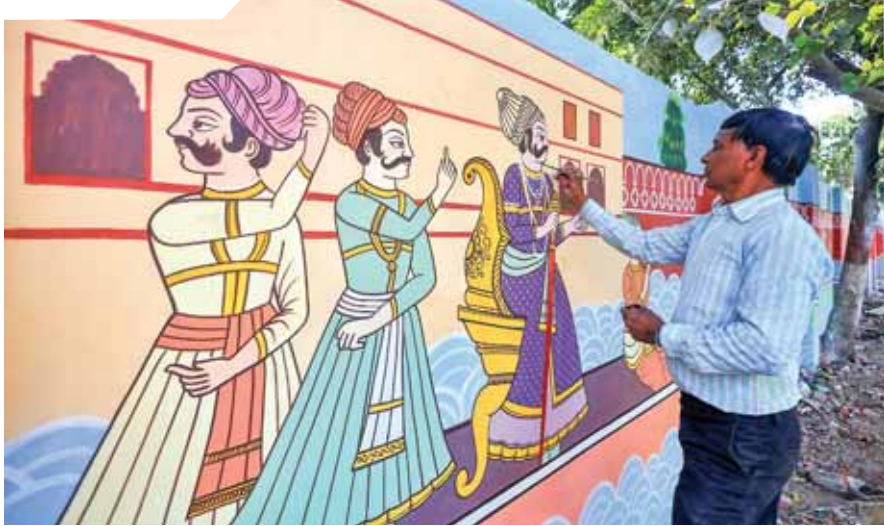
Artist paints a wall as beautification drive ahead of the Rising Rajasthan event, in Jaipur