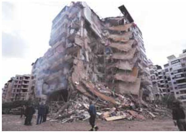
Residents gather in front of a destroyed building that was hit Sunday night in an Israeli airstrike in Dahiyeh, in the southern suburb of Beirut, Lebanon

The Israeli ambassador to Washington says that a cease-fire deal to end fighting between Israel and the Lebanon-based Hezbollah could be reached "within days."