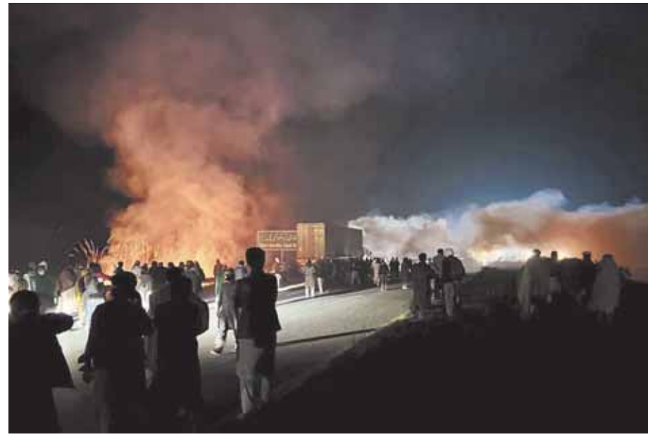
Supporters of Pakistan Tehreek-e-Insaf party, burn bushes to reduce the impact of tear gas shells fired by police officers to disperse them during a rally demanding Khan's release, at a motorway in Ghazi in Attock district, Pakistan

ing with Imran Khan on Monday in Rawalpindi's high-security Adiala Jail, where the former premier is lodged since last year.