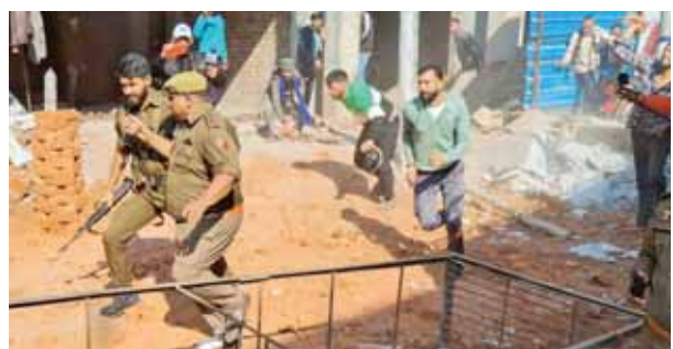
People protesting against a proposed ropeway project along the trek route to the Vaishno Devi shrine clash with police personnel, at Katra in Reasi district

"physical" and also "online" modes, wherever feasible, in Delhi, Gurugram, Faridabad, Ghaziabad and Gautam Buddha Naga. "The option to exercise online mode of education, wherever available, shall vest with the students and their guardians," it said.