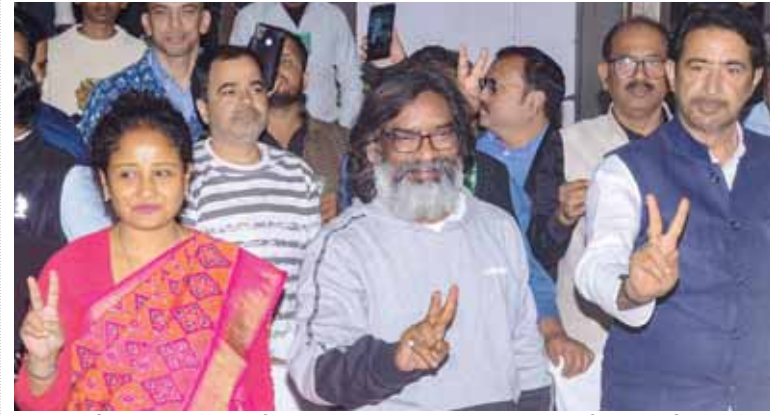
Jharkhand Chief Minister Hemant Soren with his wife and JMM leader Kalpana Soren, and Congress Jharkhand in-charge Ghulam Ahmad Mir during a press conference after JMM-led INDIA Bloc won

Shinde, his deputies Devendra Fadnavis and Ajit Pawar attributed a large share of the MahaYuti victory to its 'Mukhya Mantri Ladki Bahin Yojana' (Chief Minister's Beloved Sister Scheme) which was announced in the State Budget 2024-25. Under the scheme, the MahaYuti government had doled out an assistance of Rs 1,500 per month to all women (age 21-65 years) across state. Launched in August this year, a total assistance of Rs 7,500 reached 2.34 crore women across the state during the last five months at the rate of Rs 1,500 per woman per month. "I salute women across the state. The Mukhya Mantri Ladki Bahin Yojana proved to be a game-changer for us... Remember everyone wrote us off after the Lok Sabha polls. If the people, especially women across the state, have given us resounding victory, it is because of the development work and welfare schemes like the Ladki Bahin scheme, which helped us script an unprecedented win in the polls," Shinde said. One of the biggest takeaways from the polls that the Eknath Shinde-led Shiv Sena and Ajit Pawar-headed NCP, which are off-shoots of the vertical splits that took place in the united parties in June 2022 and July 2023 respectively — have proved electorally that they are better parties than the Uddhav Thackeray-led Shiv Sena and Sharad Pawar-led NCP in terms of strength in the State Assembly.