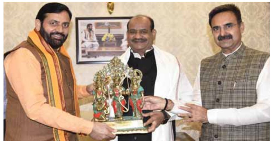
Haryana Chief Minister Nayab Singh Saini greeting Lok Sabha Speaker Om Birla at his residence in Chandigarh on Saturday.

The Deputy Commissioners and Vice Chancellors informed the meeting that various events like quiz competitions, debates, poster-making contests, guest lectures, film screenings, wall paintings on Preamble etc. have been planned to celebrate the Constitution Day. Gram panchayats will also be involved in the initiative and mass reading of the Preamble in panchayats and Amrit Sarovar sites in rural areas will be organised. 'Samvidhan Swabhimaan Yatras' will be carried out in the state from April 14, 2025 to April 28, 2025 to propagate the contribution of Baba Saheb Dr. BR Ambedkar. The Chief Secretary emphasised that the events must involve NGOs, students, faculty members, Constitutional experts and prominent people of society for greater public participation and outreach on the anniversary of 75 years of adoption of the Constitution. He said the celebration would also raise awareness about the efforts behind the drafting of the