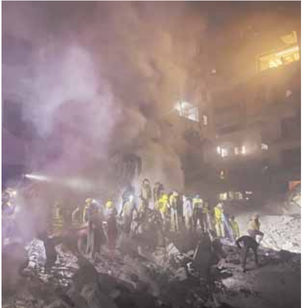
Rescue workers and people search for victims at the site of an Israeli airstrike in Beirut, Lebanon, early Saturday morning

AT LEAST 6, INCLUDING CHILDREN, DEAD IN GAZA Strikes also continued in Gaza on Saturday. At least six people, half of them children and including two women, were killed in the southern city of Khan Younis, according to AP reporters and staff at Nasser Hospital. The death toll from the 13-month-long war in the Gaza Strip between Israel and Hamas has surpassed 44,000 this week, according to local health officials. The Gaza Health Ministry does not distinguish between civilians and combatants in its count, but it has said that more than half of the fatalities are women and children. The Israeli military says it has killed over 17,000 militants, without providing evidence. The war began when Hamas-led militants stormed into southern Israel on October 7, 2023, killing some 1,200 people, mostly civilians, and abducting another 250. Around 100 hostages are still inside Gaza, at least a third of whom are believed to be dead. Most of the rest were released during a cease-fire last year. The Israeli offensive in Gaza