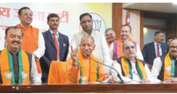
Uttar Pradesh Chief Minister Yogi Adityanath with Deputy Chief Ministers Keshav Prasad Maurya and Brajesh Pathak, and state BJP President Bhuwendra Singh Chaudhary addresses a press conference after the party won at least five of the state bypolls at party headquarters, in Lucknow