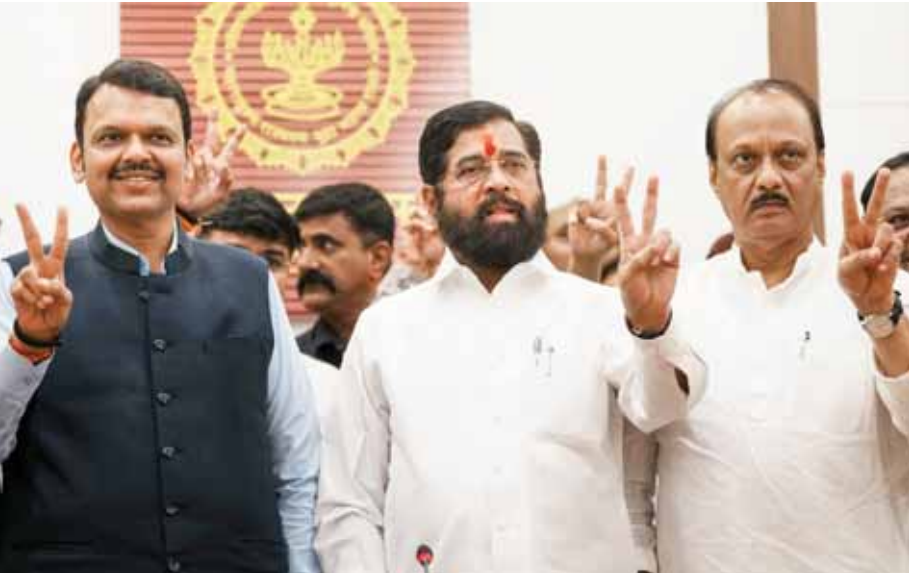
Maharashtra Chief Minister Eknath Shinde with Deputy Chief Ministers Devendra Fadnavis and Ajit Pawar flashes victory sign during a press conference as the BJP-led Mahayuti alliance secures victory.