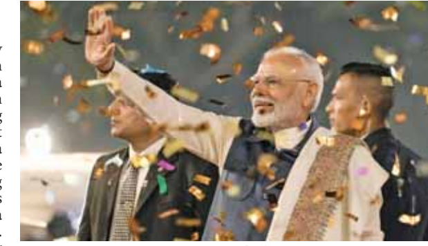
PM Narendra Modi during the celebration of BJP's victory in the Maharashtra Assembly, several bypoll elections, at BJP headquarters in New Delhi

The Bharatiya Janata Party (BJP) is back with vengeance, crushed the Maha Vikas Aghadi (MVA) to retain power, with an outstanding strike rate of over 86 per cent with 133 seats in Maharashtra indicates a tactical shift in the backdrop of the stunning victory in Haryana as its lacklustre show in Lok Sabha elections in the two states. This is the best ever performance of the BJP in the state. With 26.57 percent vote share, the BJP got votes of 16, 642, 993 which is more than the vote's shares of Congress and Shiv Sena (UBT). The stunning victory for the Mahayuti in Maharashtra clearly suggests that the brand of Prime Minister Narendra Modi is still the most powerful ammo that the BJP has in its armoury, which trounced the Opposition alliance that was clearly a frontrunner in the battle at the hustings in India's wealthiest state just about five months back. The victory has again put a seal of approval on Home Minister Amit Shah's tag as a "modern-day Chanakya and master strategist". The extent of BJP's dominance in this election can be gauged by the fact that the saffron party's projected score is more than double the tally of the opposition's MVA, which includes the Congress, Shiv Sena(UBT) and NCP(SP). But the million dollar question that arises in