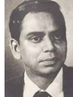
was the reason why he titled the book "Ummidon Ke Geetkar Shailendra". "He is one songwriter who never let