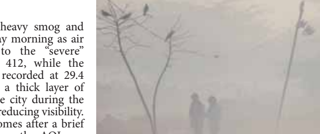
Patparganj, Rohini, Punjabi Bagh, Wazirpur, and Mundka, registered readings above 400, placing them in the 'severe' category. Nine recorded the city's air quality in the 'severe plus' category with AQI exceeding 450. At the same time, IQ Air data showed AQI at 464. PM2.5 concentration recorded 59.9 times the World Health Organization (WHO) annual PM2.5 guideline value.

Residents of Delhi faced heavy smog and poor visibility on Saturday morning as air quality plummeted back to the 'severe' category, with an AQI of 412, while the maximum temperature was recorded at 29.4 degrees Celsius. Meanwhile, a thick layer of mist and smog blanketed the city during the morning and evening hours, reducing visibility. This decline in air quality comes after a brief respite on November 22, when the AQI was recorded at 371, categorised as "very poor." The National Capital has been logging hazardous air quality for over 20 days. According to the Central Pollution Control Board (CPCB), which provides hourly AQI updates, 20 monitoring stations, including Alipur, Anand Vihar, Ashok Vihar, Bawana, Chandni Chowk, DTU, Dwarka, Jahangirpuri, Mandir Marg, Narela, Nehru Nagar,