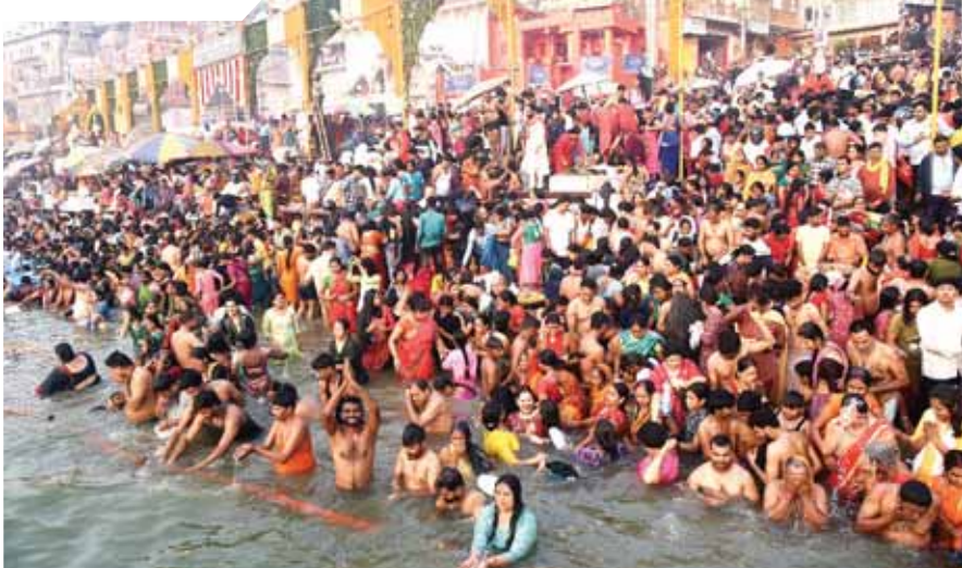
Devotees take a holy dip in the Ganga river at a ghat on the occasion of 'Kartik Purnima' festival, in Varanasi