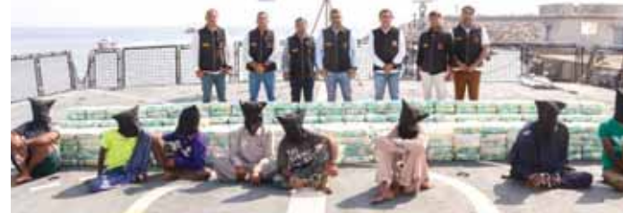
NCB personnel after an operation in which they successfully dismantled an international drug trafficking cartel and seized approximately 700 kg of meth in Gujarat

In a joint operation, agencies on Friday seized about 700 kg of drugs and arrested eight Iranian nationals from Indian territorial waters off the Gujarat coast around Porbandar. The street value of the seized Methamphetamine, a synthetic recreational variety of narcotics, could be anywhere between Rs 2,500-3,500 Crore in the international market, said Narcotics Control Bureau (NCB) officials. An operation codenamed 'Sagar Manthan-4' was launched based on intelligence inputs to intercept an