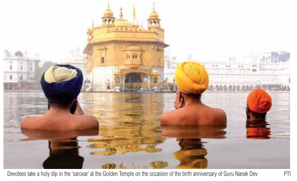
Devotees take a holy dip in the 'sarovar' at the Golden Temple on the occasion of the birth anniversary of Guru Nanak Dev