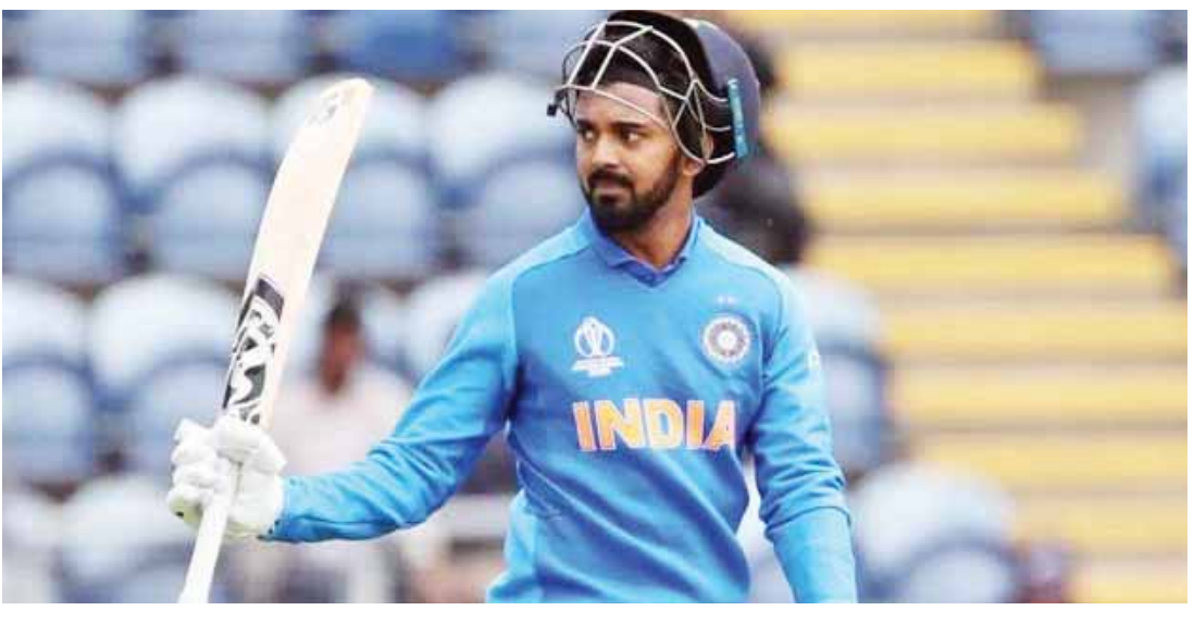
KL Rahul in action during a match.

The beleaguered KL Rahul is seeking to use the next IPL as a vehicle to stage a comeback to the Indian T20 side as he wants to remain involved in all three formats of the game.