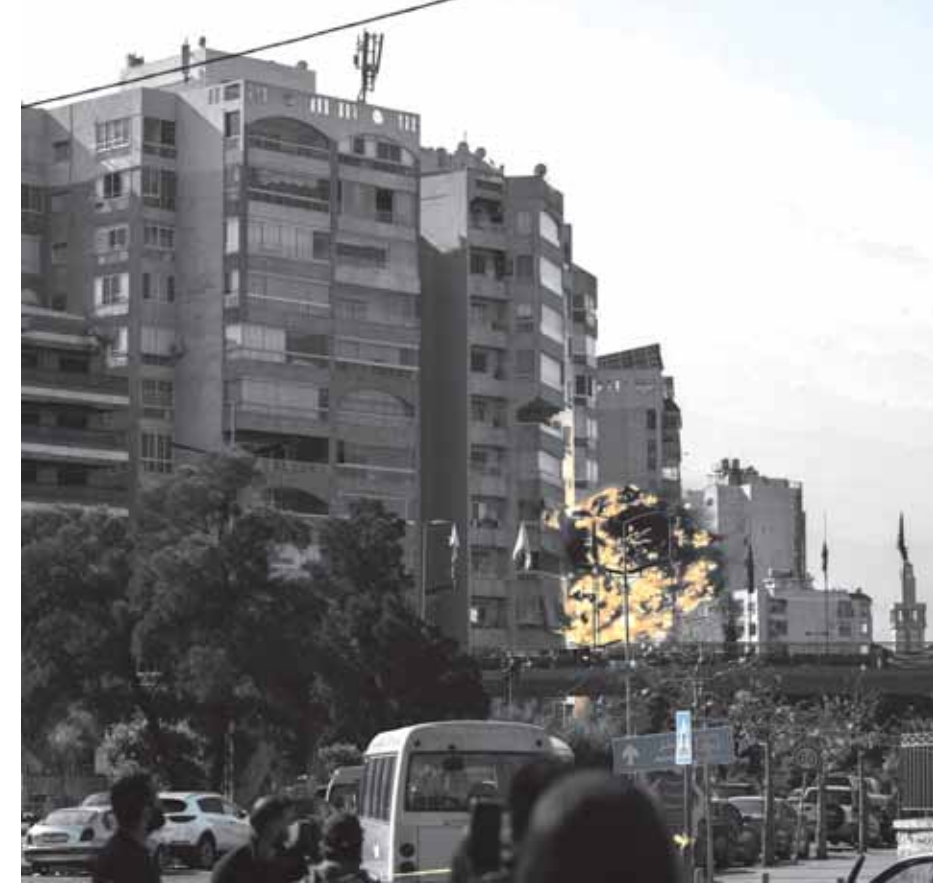
Thick smoke and flames erupt from an Israeli airstrike on Tayouneh, Beirut on Friday.

least nine people and wounding five others. The strike came without warning. The Israeli military did not immediately comment and the target was unclear. A report by the World Bank on Thursday estimated that Lebanon has suffered USD 8.5 billion in physical damages and economic losses from 13 months of war. Hezbollah began firing into Israel on Oct. 8, 2023, in solidarity with Hamas in Gaza. Since then, Israeli strikes and bombardment in Lebanon have killed at least 3,380 people while the number of wounded has surpassed 14,400, the Health Ministry said Thursday. Among the dead were 658 women and 220 children. In Israel, 76 people have been killed, including 31 soldiers. Before the war intensified on Sept. 23, Hezbollah said that it had lost nearly 500 members but the group has stopped releasing statements about their killed fighters since.