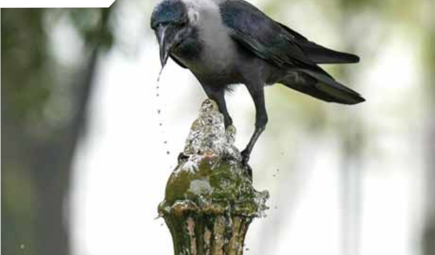
A crow quenches its thirst by drinking water from a fountain, in New Delhi