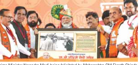
Prime Minister Narendra Modi being felicitated by Maharashtra CM Eknath Shinde and other leaders during a public meeting.

Prime Minister Narendra Modi on Thursday said the Congress and its allies are hatching a scheme to have a separate Constitution for Kashmir, and making all efforts for restoration of Article 370. "Will the people of Maharashtra support the Congress and its allies who speak the language of Pakistan," PM Modi said, addressing a rally in Chhatrapati Sambhajnagar for the November 20 state Assembly elections. "Congress and its colleagues have passed a resolution to restore Article 370," he said. "When we made Kashmir