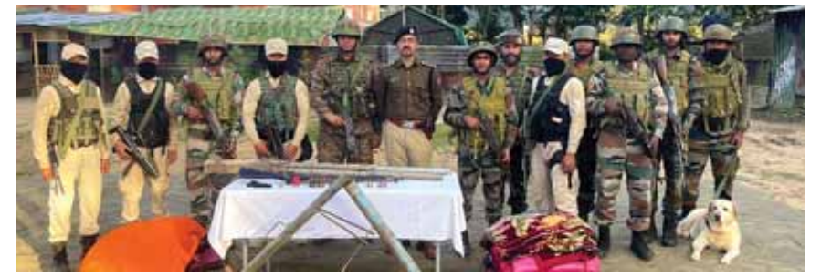
Arms and ammunition recovered during a cordon and search operation conducted by Manipur Police and Security forces in Jiribam district.

actions already in force, from 8 am of 15th November, 2024 in the National Capital Region (NCR)," the statement read. The GRAP III restrictions also include road construction activities and major repairs; Transfer, loading / unloading of dust generating materials like cement, fly-ash, bricks, sand, murrum, pebbles, crushed stone etc. anywhere within / outside the project sites; Movement of vehicles carrying construction materials on unpaved roads; Laying of sewer line, water line, drainage and electric cabling etc. by open trench system, brick / masonry works and painting, polishing and varnishing works. The GRAP comprises specific measures to tackle