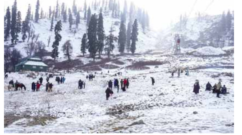
Tourists play in the snow at a ski resort after season's first snowfall at Kongdoori area of Gulmarg, in Baramulla district, Jammu and Kashmir, Tuesday