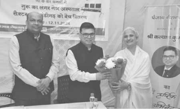
Punjab National Bank- Chandigarh donated items to Guru ka Langar Eye Hospital and Mother Teresa Mission of Charity.