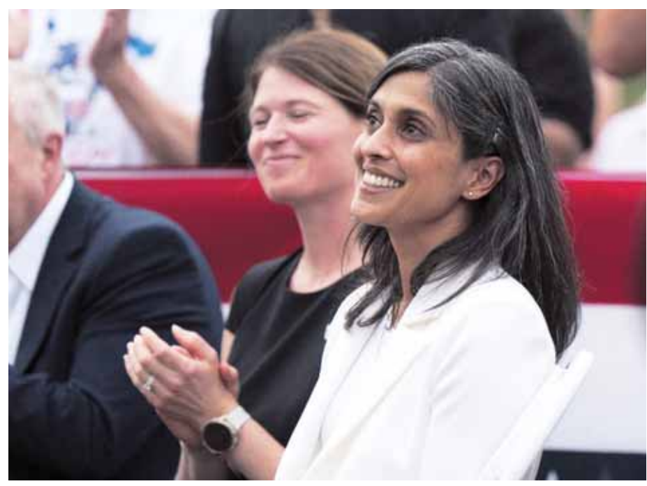
Usha Vance smiles as her husband Republican vice presidential nominee Sen. JD Vance, R-Ohio, speaks at a campaign rally on Friday in Selma, NC.

Israel has also stepped up its offensive against Hamas' remaining fighters in Gaza, raising concerns about humanitarian conditions for civilians still there.