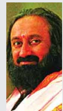
Sri Sri Ravi Shankar Spiritual Guru

H APPINESS is the one thing that everybody is seeking. People do find happiness but it is momentary; for couple of hours or days. True happiness is when you find inner stability and comfort. You know you are connected to something unimaginably bigger and that there is an unshakable power within you. Here are a few pointers to ensure that happiness simply wells up in you. HEALTH: In India, "swastha" refers to one who is established in oneself. A healthy person has a smile on the face, love in the heart and strength and vitality in the body. Seeing life with the eyes of wisdom makes negative emotions go away and you start smiling from the core of your being. ATTACHMENTS: These cause feverishness that take away peace of mind. You are in pieces and fall prey to misery. Your first step is directing your attachment to the Knowledge and the Divine. Your