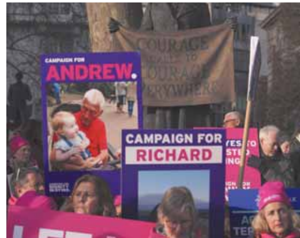
Pro legal assisted dying supporters demonstrate in front of Parliament in London on Friday as British lawmakers started a historic debate on a proposed to help terminally ill adults end their lives in England and Wales.

The debate is set to be impassioned, touching on issues of ethics, grief, the law, religion, crime and money. Many lawmakers plan to recount personal experiences while others