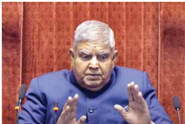
The Chairperson's statement in the House led to protests with slogans being raised against Prime Minister Narendra Modi and Adani.

"...These issues have been raised repeatedly during the week with the result that we have already lost three working days. The days that should have been committed by us for public cause," Dhankhar said. The chairman said the loss of time, opportunity and question hour has given enormous setbacks to the people at large. "Now, I find honourable members and I call upon you for deep reflection. Rule 267 is being weaponised as a mechanism of disruption and disruption from our normal working. There are very senior members," he said. The statement led to further protests, with some opposition members raising slogans against Prime Minister Narendra Modi and the Adani Group. Expressing deep anguish, Dhankhar said, "Our actions are not people-centric. They are to absolute public distaste, we are getting into irrelevance, people are ridiculing us, we