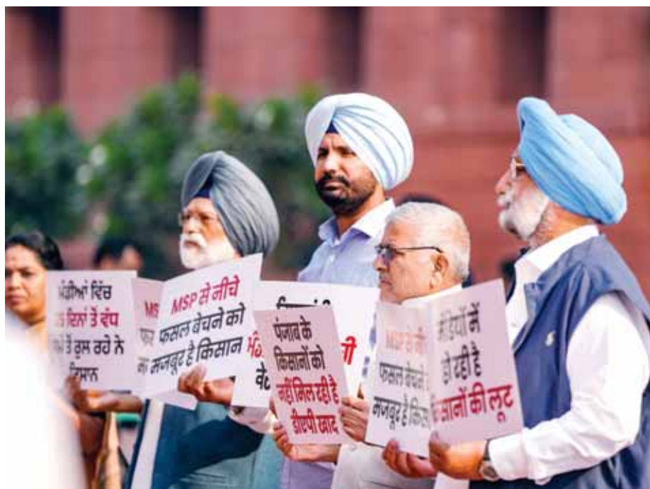
Congress MPs protest during the ongoing Winter session of Parliament.

sought discussion on the recent violence in Sambhal. Sanjay Singh of the AAP had given a notice to take up the issue of "rising" crime in the national capital, while his party colleague Raghav Chadha wanted a discussion on the alleged atrocities against Hindus in Bangladesh and the arrest of Hindu spiritual leader Chinmoy Krishna Das.