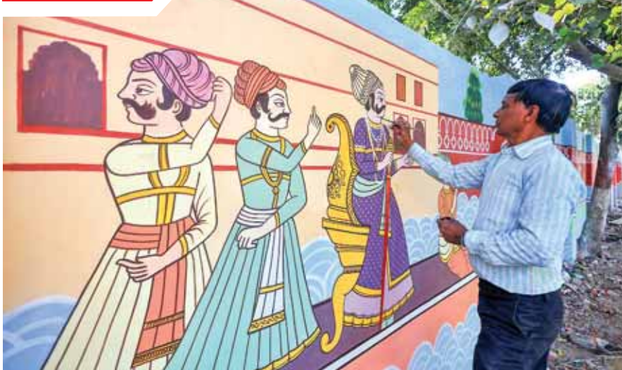
Artist paints a wall as beautification drive ahead of the Rising Rajasthan event, in Jaipur