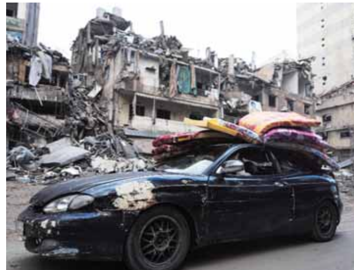
But some videos circulating on social media show displaced Lebanese defying these calls and returning to villages in the south near the coastal city of Tyre. Israeli troops were still present in parts of

Lebanon, while Israeli troops are to return to their side of the border. Thousands of additional Lebanese troops and UN peacekeepers would deploy in the south, and an international panel headed by the United States would monitor compliance. Hours before the ceasefire between Israel and Lebanon took effect, Israel launched broad strikes that shook the Lebanese capital Beirut and a volley of rockets from Hezbollah set off air raid sirens across a large swath of northern Israel. But after the ceasefire took effect early Wednesday, quiet appeared to take hold, prompting waves of Lebanese to head home. Israel's Arabic military spokesperson Avichay Adraee warned displaced Lebanese not to return to their villages in southern Lebanon. The Lebanese military asked displaced returning to southern Lebanon to avoid frontline villages and towns near the border where Israeli troops are still present until they withdraw.