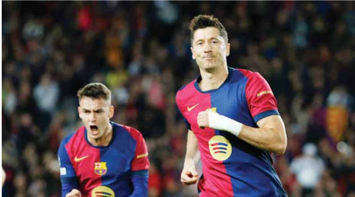
Hadj Moussa, Santiago Gimenez and David Hancko. Inter Milan beat Leipzig 1-0 with an own goal to move atop the standings with 13 points, one more than

Lewandowski said. "In the past I didn't think I could score more than 100 goals in the Champions League. I'm in good company alongside Cristiano and Messi." The 36-year-old Lewandowski required 125 matches to reach the century mark, two more than Messi (123) and 12 fewer than Ronaldo (137). Barcelona also got a second-half score from Dani Olmo. The top eight finishers in the standings advance directly to the round of 16 in March. Teams ranked ninth to 24th go into a knockout playoffs round in February, while the bottom 12 teams are eliminated. Haaland converted a first-half penalty to eclipse Messi as the youngest player to reach 45 goals and then scored City's third after the break to raise his total to 46 goals in 44 games. Ilkay Gundogan had City's second. But then Feyenoord struck back with goals from Anis