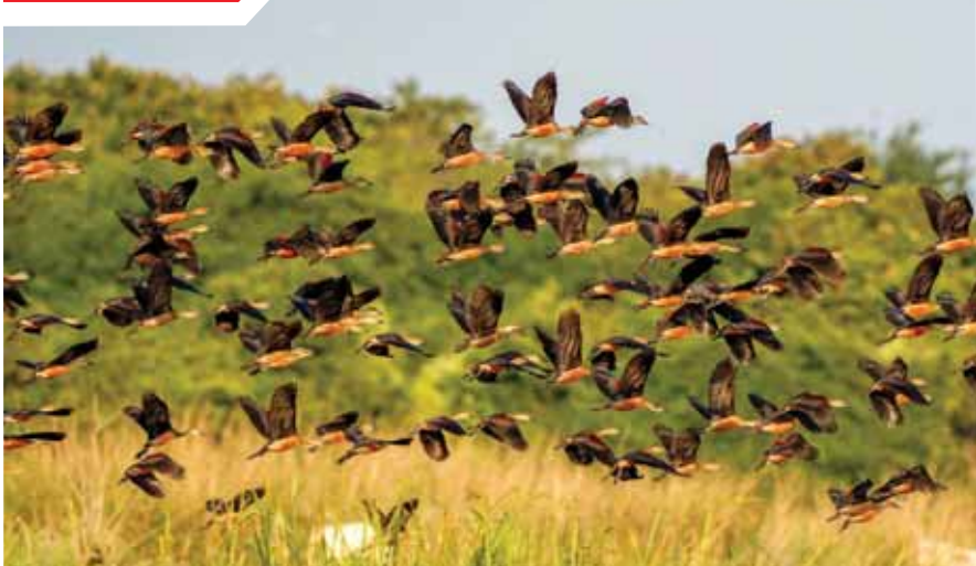
A flock of whistling ducks fly at the Pobitora Wildlife Sanctuary, in Morigaon