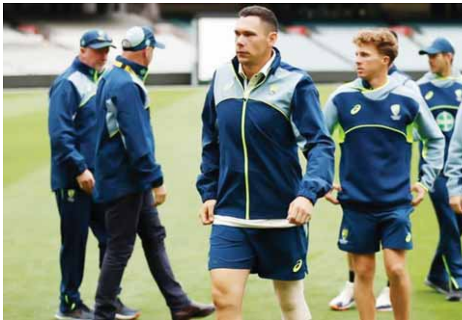
according to a report in the 'Sydney Morning Herald'. Head coach Andrew McDonald has also insisted that sending any player for the match in 'Canberra hasn't crossed their minds'. "No, that hasn't crossed our minds. We feel that with the long summer ahead, the prep we've got in place — albeit we've extended that by a day in Adelaide — we'll be well prepared, as we were leading into the first Test," McDonald said.

Australian selectors have decided against sending any out-of-form national team batters to play for the Prime Minister's XI against India in Canberra, following the hammering in the Perth Test. Hosts Australia were handed a 295-run bashing by India in the series opener of the Border-Gavaskar Trophy earlier this week and following the disappointing performance, the pressure is intensifying on the top order ahead of the second Test against India in Adelaide on December 6. The likes of Marnus Labuschagne (2, 3) and Steve Smith (0, 17) struggled against India and many, including former captain Michael Clarke, feel the duo, along with reserve batter Josh Inglis, could benefit from the two-day pink-ball warm-up game. However, the Australian think tank has denied thinking on those lines. "This was partly because time at home was considered important for the players, and also because the Australian camp do not want to give the Indian brains trust another look at any of their Test batters before the five-match series resumes,"