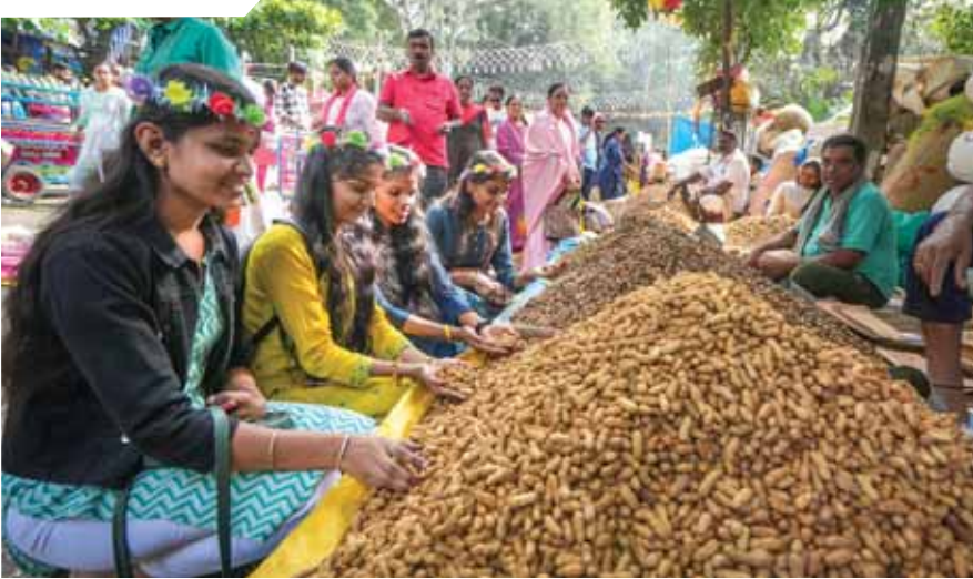
People buy groundnut during the inauguration of the 'Kadalekai Parishes', in Bengaluru