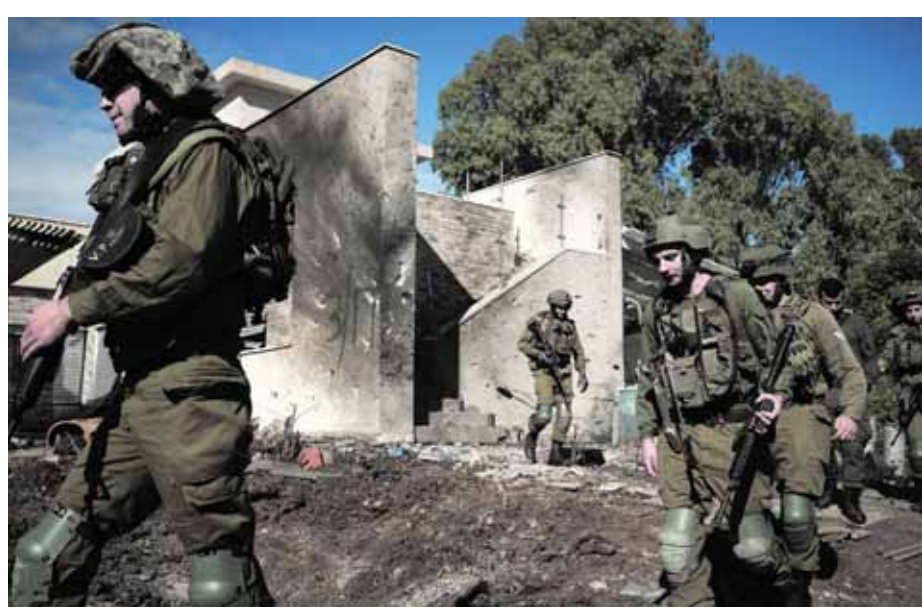
Israeli soldiers inspect the site where a rocket fired from Lebanon landed in a backyard in Kiryat Shmuna, northern Israel on Tuesday.

expressed growing optimism over a ceasefire, Israel has continued its campaign in Lebanon, which it says aims to cripple Hezbollah's military capabilities. Israel jets struck at least six buildings in Beirut's southern suburbs Tuesday. One strike slammed near the country's only airport, sending large plumes of smoke into the sky. There were no immediate reports of casualties. The airport has continued to function despite its location on the Mediterranean coast next to the densely populated suburbs where many of Hezbollah's operations are based. Other strikes hit in the southern city of Tyre, where the Israeli military said it killed a local Hezbollah commander. The Israeli military also said its ground troops reached parts of Lebanon's Litani River — a focal point of the emerging ceasefire. It said troops clashed with Hezbollah forces and destroyed rocket launchers in the Slouji area on the eastern end of the Litani, just a few km from the border. Under the ceasefire deal, Hezbollah would be required to