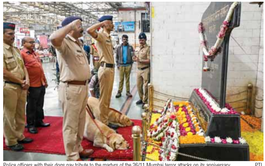
Police officers with their dogs pay tribute to the martyrs of the 26/11 Mumbai terror attacks on its anniversary