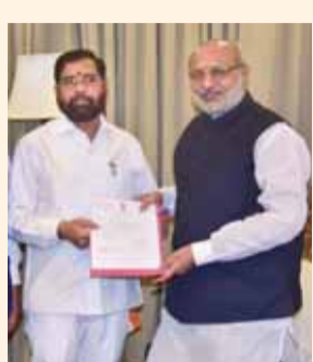
Maharashtra Governor CP Radhakrishnan receives Shiv Sena leader Eknath Shinde's resignation as Chief Minister