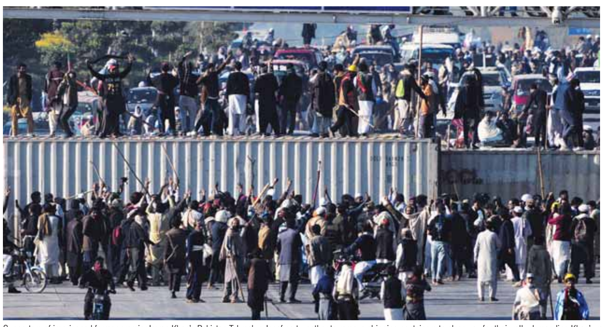
Supporters of imprisoned former premier Imran Khan's Pakistan Tehreek-e-Insaf party, gather to remove shipping containers to clear way for their rally demanding Khan's release, in Islamabad on Tuesday. (Right) A supporter Imran Khan's party aims to throw stones with slingshot following police fire tear gas shell to disperse them during clashes.

of the Pakistan Tehreek-e-Insaf (PTI) had vowed to remain in Islamabad until Khan was released. Khan's wife Bushra Bibi, who stubbornly led the protests, said in one of her addresses to the protestors to go away only if Khan comes in person to tell about the next course of action. They reached their declared destination despite repeated claims by Interior Minister Mohsin Naqvi that nobody would be allowed to make it to D-Chowk. Naqvi also said the government tried to convince PTI leaders in every way, but they only gained time from negotiations and moved towards the federal capital. "We offered the protestors to gather at Sangiani. Their entire leadership does not want a bloodbath, but there's one secret leadership controlling all this, which was the apple of the discord," he said. He also said that all PTI supporters had come from Khyber Pakhtunkhwa. Led by Khyber-Pakhtunkhwa Chief Minister Ali Amin Gandapur and Khan's wife Bushra, the marchers began their journey from the militancy-hit province on Sunday. Pakistan deployed the army amid a tense stand-off with Khan's supporters. The government has vowed to foil their attempt "even if a curfew needs to be imposed." Hours earlier, the state-run Radio Pakistan said a vehicle