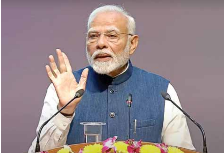
Prime Minister Narendra Modi addresses a gathering during Constitution Day celebrations at the Supreme Court

Hailing the Constitution as a "living stream", Prime Minister Narendra Modi on Tuesday said the sentiment of 'nation first' will keep the Constitution alive for centuries to come. Recalling the words of President Rajendra Prasad in his concluding address to the Constituent Assembly on November 26, 1949, PM Modi said he had stated that India does not need anything more than a group of honest people who will keep the country's interests above their own. Addressing an event marking Constitution Day celebrations at the Supreme Court, Modi said the Constitution has now been fully implemented in Jammu and Kashmir and Constitution Day was celebrated there for the first time. "Our Constitution makers knew that India's aspirations, India's dreams will reach new heights with time. They knew that the needs of Independent India and its citizens will change, challenges will change. That is why they did not leave our Constitution as just a mere book of laws. Rather, they made it a living, continuously flowing stream," Modi said, adding that the Constitution is acting as a "guiding light" at a time when India is going through a period of transformation. "Today every citizen of the country has only one goal, to build a developed India," he said at the event which was attended by Law Minister Arjun Ram Meghwal, Chief