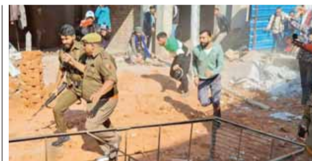
People protesting against a proposed ropeway project along the trek route to the Vaishno Devi shrine clash with police personnel, at Katra in Reasi district

Congress president Mallikarjun Kharge expressed dismay over the Chair in both Houses of Parliament disallowing the opposition to raise under Rule 267 the issue of corruption allegations against the Adani Group and said the government should "let the truth come out" as the matter is affecting the country's image.