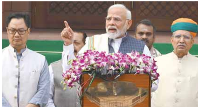
Prime Minister Narendra Modi addresses the media on the first day of the Winter session of Parliament, in New Delhi on Monday. Union Minister for Parliamentary Affairs Kiren Rijju and Ministers of State Jitendra Singh, Arjun Ram Meghwal and L. Murugan are also seen.