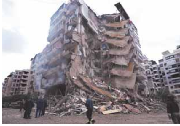
Residents gather in front of a destroyed building that was hit Sunday night in an Israeli airstrike in Dahiyeh, in the southern suburb of Beirut, Lebanon

The Israeli ambassador to Washington says that a cease-fire deal to end fighting between Israel and the Lebanon-based Hezbollah could be reached "within days."