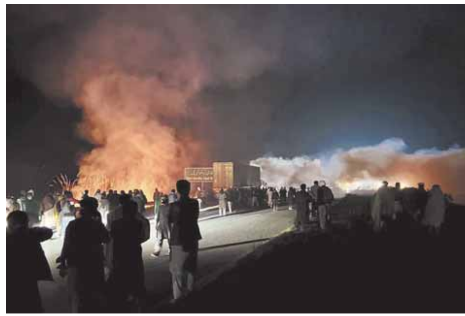
Supporters of Pakistan Tehreek-e-Insaf party, burn bushes to reduce the impact of tear gas shells fired by police officers to disperse them during a rally demanding Khan's release, at a motorway in Ghazi in Attock district, Pakistan

ing with Imran Khan on Monday in Rawalpindi's high-security Adiala Jail, where the former premier is lodged since last year.