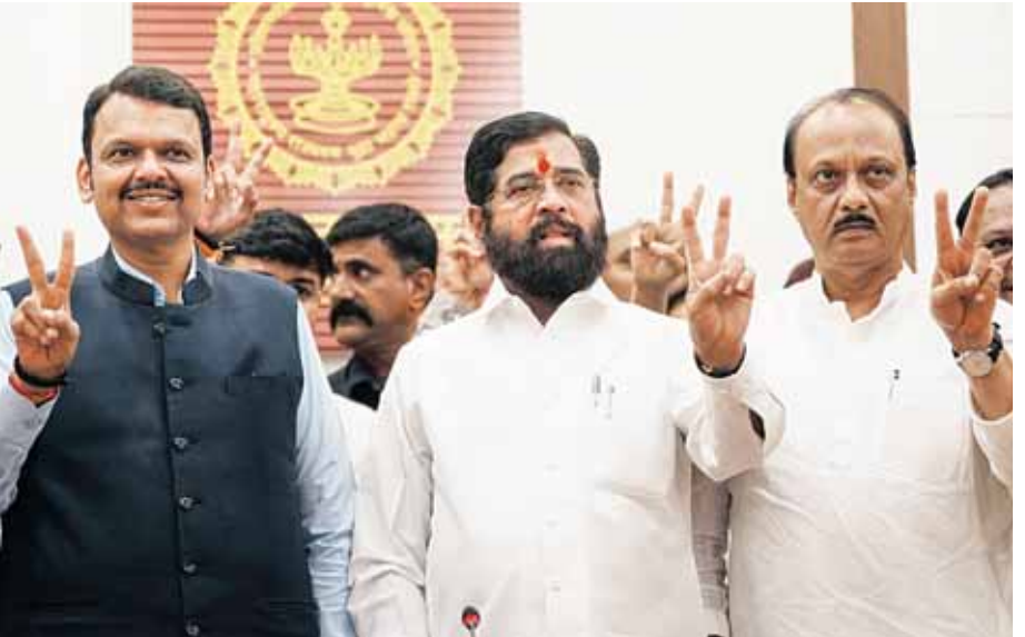
Maharashtra Chief Minister Eknath Shinde with Deputy Chief Ministers Devendra Fadnavis and Ajit Pawar flashes victory sign during a press conference as the BJP-led Mahayuti alliance secures victory.