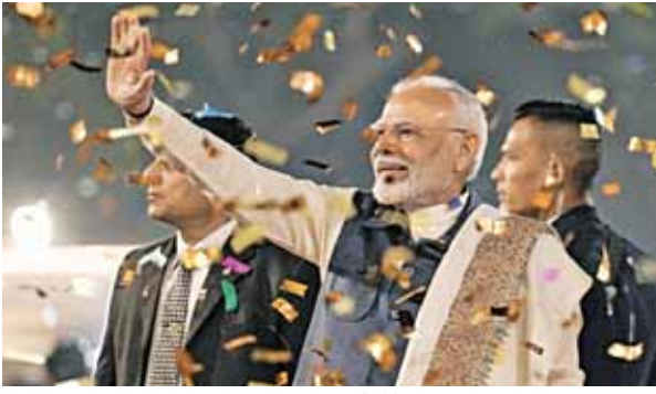
PM Narendra Modi during the celebration of BJP's victory in the Maharashtra Assembly, several bypoll elections, at BJP headquarters in New Delhi

The Bharatiya Janata Party (BJP) is back with vengeance, crushed the Maha Vikas Aghadi (MVA) to retain power, with an outstanding strike rate of over 86 per cent with 133 seats in Maharashtra indicates a tactical shift in the backdrop of the stunning victory in Haryana as its lacklustre show in Lok Sabha elections in the two states. This is the best ever performance of the BJP in the state. With 26.57 per cent vote share, the BJP got votes of 16, 642, 993 which is more than the vote's shares of Congress and Shiv Sena (UBT). The stunning victory for the Mahayuti in Maharashtra clearly suggests that the brand of Prime Minister Narendra Modi is still the most powerful ammo that the BJP has in its armoury, which trounced the Opposition alliance that was clearly a frontrunner in the battle at the hustings in India's wealthiest state just about five months back. The victory has again put a seal of approval on Home Minister Amit Shah's tag as a "modern-day Chanakya and master strategist". The extent of BJP's dominance in this election can be gauged by the fact that the saffron party's projected score is more than double the tally of the opposition's MVA, which includes the Congress, Shiv Sena(UBT) and NCP(SP). But the million dollar question that arises in