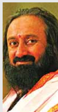
Sri Sri Ravi Shankar Spiritual Guru

A combination of different measures is needed to relieve work-related tension so that it does not affect life at home