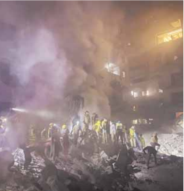
Rescue workers and people search for victims at the site of an Israeli airstrike in Beirut, Lebanon, early Saturday morning

The Israeli military says it has killed over 17,000 militants, without providing evidence. The war began when Hamas-led militants stormed into southern Israel on October 7, 2023, killing some 1,200 people, mostly civilians, and abducting another 250. Around 100 hostages are still inside Gaza, at least a third of whom are believed to be dead. Most of the rest were released during a cease-fire last year. The Israeli offensive in Gaza