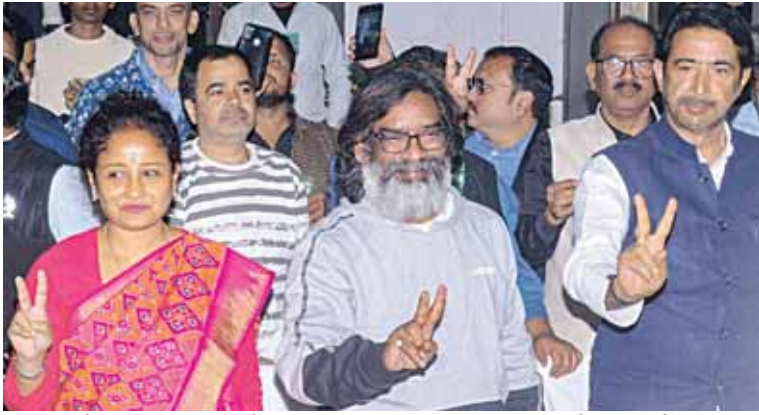
Jharkhand Chief Minister Hemant Soren with his wife and JMM leader Kalpana Soren, and Congress Jharkhand in-charge Ghulam Ahmad Mir during a press conference after JMM-led INDIA Bloc won