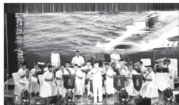
The Naval Officer-in-Charge (Odisha) organises a Naval Band Concert at the Town Hall in Puri on Saturday.

On October 6, a man allegedly raped her minor niece at a place under Raghunathpali police limits in Rourkela. The matter came to the fore after the family members of the victim lodged a complaint against the accused, who is a distant relative of the victim, at the police station. On October 1, two unidentified miscreants allegedly robbed a flat and raped a woman finding her alone inside the flat in an apartment in Maitri Vihar police limits in Bhubaneswar. The list of such crimes is unending. To combat the rising tide of crime against women and rape, collective efforts from governments, civil society, and individuals are imperative. We must prioritize women's safety, well-being, and empowerment.