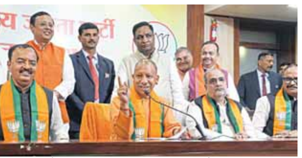
Uttar Pradesh Chief Minister Yogi Adityanath with Deputy Chief Ministers Keshav Prasad Maurya and Brajesh Pathak, and state BJP President Bhanupendra Singh Chaudhary addresses a press conference after the party won at least five of the state bypolls at party headquarters, in Lucknow