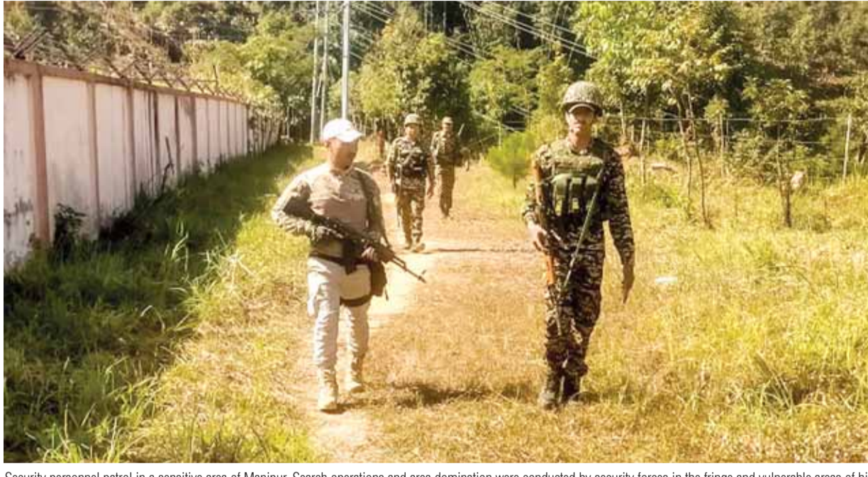
Security personnel patrol in a sensitive area of Manipur. Search operations and area domination were conducted by security forces in the fringe and vulnerable areas of hill and valley districts of the state

Amid escalating unrest in Manipur, Union Home Minister Amit Shah on Sunday cancelled all his rallies in poll-bound Maharashtra and returned to Delhi to hold a meeting to review the volatile situation. Irate mobs set fire to the residences of three more Bharatiya Janata Party (BJP) legislators, one of whom is a senior Minister, and also the home of a Congress MLA in various districts of Imphal Valley, even as security forces foiled the attempt of agitators to storm the ancestral residence of Manipur Chief Minister N Biren Singh, officials said. Later in the evening, the Home Minister held a meeting with senior security and intelligence officials, and reviewed the Manipur situation. Meanwhile, Central Reserve Police Force (CRPF) chief Anish Dayal Singh reached Imphal on Sunday, to monitor and coordinate the security operations in the region. The fresh incidents of violent protests took place on Saturday night even as an indefinite curfew was clamped after people, agitated by the killing of three women and children each by militants in Jiribam district, attacked the residences of three state Ministers and six MLAs earlier on Saturday. Meanwhile, the Manipur Government has requested the Centre to review and withdraw AFSPA from areas falling under the jurisdiction of six police stations in the State. The Centre has reimposed the Armed Forces (Special Powers) Act, 1958 in Manipur's six police station areas, including violence-hit Jiribam. Union Ministry of Home