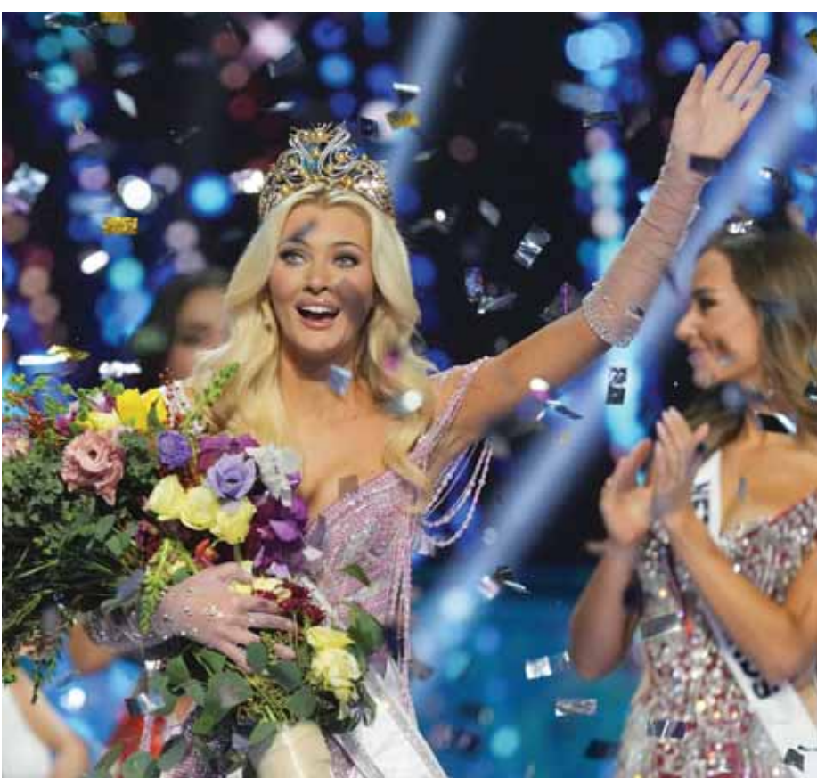
Miss Denmark Victoria Kjær Theilvig waves after winning the 73rd Miss Universe Beauty Pageant in Mexico City, on Saturday.

inflation in recent years, making it difficult for them to get by. The country is also a major source of irregular migration to Europe, with thousands leaving every year on rickety, artisanal fishing boats in search of economic opportunities. The campaign for the legislative election was marked by sporadic clashes between supporters of different parties. The headquarters of an opposition party were set on fire in the capital, Dakar, and clashes have erupted between supporters in central Senegal in recent weeks, the interior ministry said Monday. On Tuesday, Ousmane Sonko, the country's prime minister who helped catapult Faye to victory, denounced attacks against supporters of PASTEF in Dakar and other cities. "May each patriot they have attacked and injured be proportionally avenged. We will exercise our legitimate right to respond," he wrote on X, before back-peddalling and asking his supporters to remain peaceful in a speech later that day.