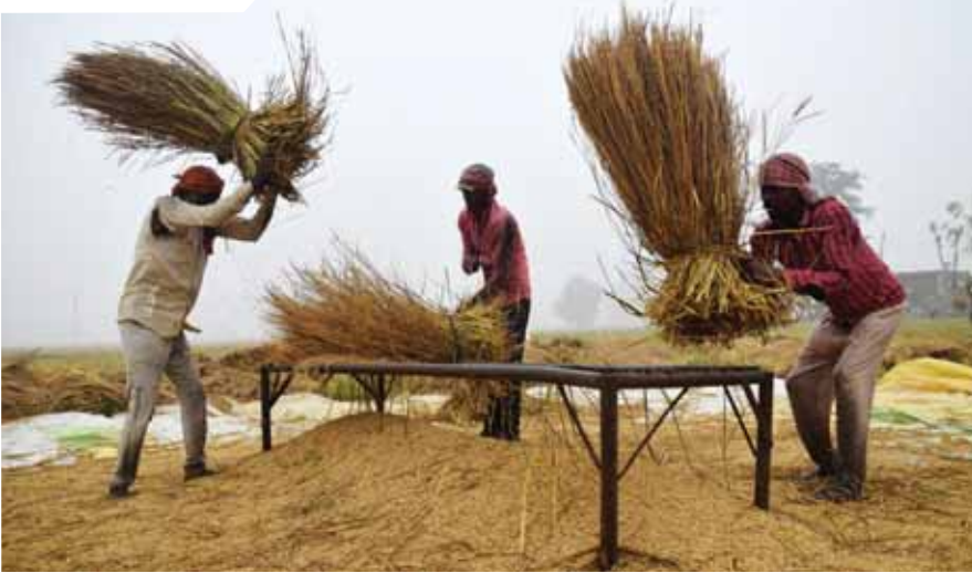
Labourers thresh paddy at a field on the outskirts of Amritsar