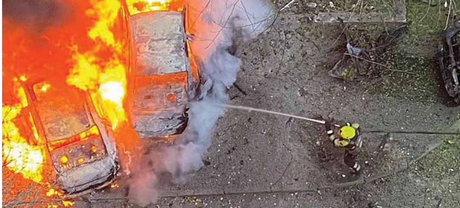
In this photo provided by the Ukrainian Emergency Service, emergency services personnel remove part of a Russian missile that hit an apartment house during massive missile attack in Kyiv, Ukraine, Sunday. AP/PTI

Western allies to bolster the country's air defences to counter assaults and allow for repairs. Explosions were heard across Ukraine on Sunday, including in capital Kyiv, the key southern port of Odesa, as well as the country's west and central regions, according to local reports. The operational command of Poland's armed forces wrote on X that Polish and allied aircraft, including fighter jets, have been mobilised in Polish airspace because of the "massive" Russian attack on neighbouring Ukraine. The steps were aimed to provide safety in Poland's border areas, it said. One person was injured after the roof of a five-story residential building caught fire in Kyiv's historic centre, according to Popko. A thermal power plant operated by private energy company DTEK was "seriously damaged", the company said.