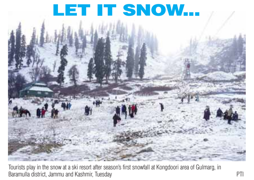
Tourists play in the snow at a ski resort after season's first snowfall at Kongdoori area of Gulmarg, in Baramulla district, Jammu and Kashmir, Tuesday

Retail inflation rose to 6.21 per cent in October from 5.49 per cent in the preceding month mainly due to higher food prices, breaching the Reserve Bank of India's (RBI's) upper tolerance level, according to official data released on Tuesday. The consumer price index-based inflation was 4.87 per cent in October 2023. The National Statistics Office data showed that inflation in the food basket rose to 10.87 per cent in October from 9.24 per cent in September and 6.61 per cent in the year-ago month. The RBI, which kept the key short-term lending rate unchanged earlier this month, has been tasked by the government to ensure inflation remains at 4 per cent with a margin of 2 per cent on either side.