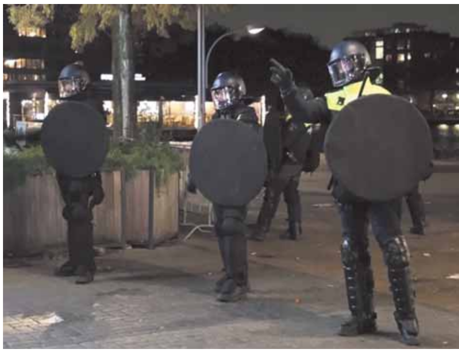
In this image taken from video, police officers patrol in riot gear on the streets of Amsterdam as the city is facing tensions following violence last week.

AP THE HAGUE A senior police officer warned Tuesday of calls for more rioting in Amsterdam, after dozens of people armed with sticks and firecrackers set a tram on fire Monday night as the city faces tensions following violence last week targeting fans of an Israeli soccer club.