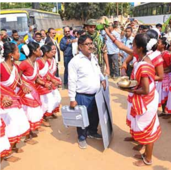
Women from the tribal community give a traditional welcome to a polling official before he leaves for his allotted polling station on the eve of the 1st phase of Jharkhand Assembly elections, in Ranchi, Tuesday

PIONEER NEWS SERVICE ■ NEW DELHI/RANCHI/WAYANAD