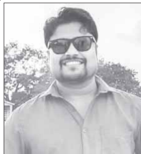
texted his mother about a personal loan of approximately Rs 25 lakh that he had taken. It was believed that he took the

drastic step due to the mounting pressure for repaying this debt.