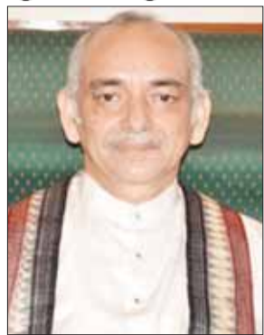
Gaur Samkirtan Yatra" in Houston on November 9.

Instead, the ISKCON has decided to organise a "Nitai