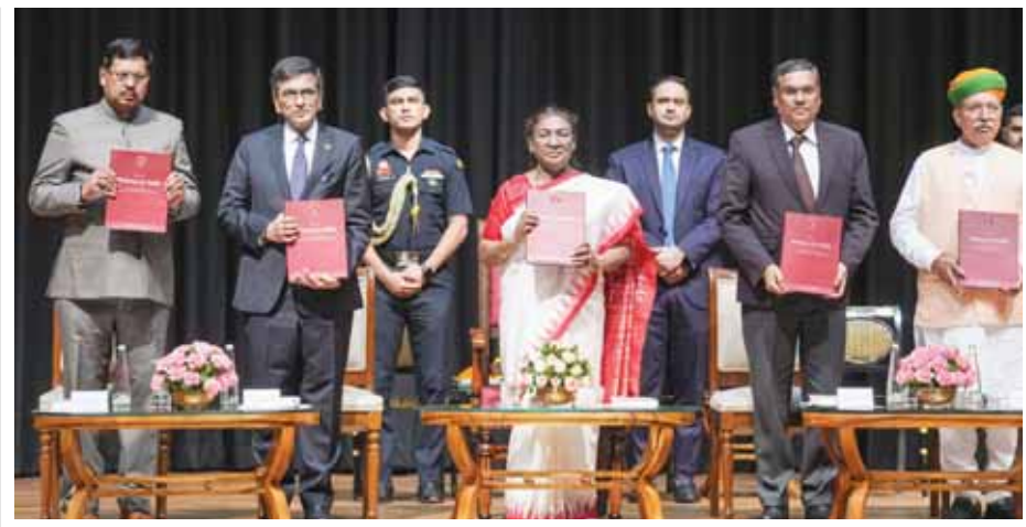
President Droupadi Murmu, Chief Justice of India DY Chandrachud, Justice Sanjiv Khanna, Union Minister of Law & Justice Arjun Ram Meghwal and Justice BR Gavai release of three publications of the Supreme Court, at Rashtrapati Bhavan Cultural Centre (RBCC)