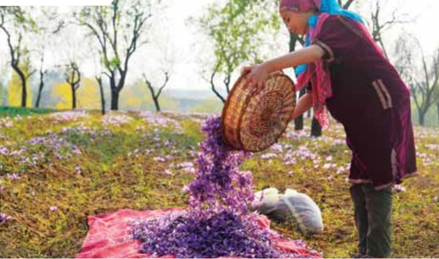
A girl collects newly plucked saffron flowers during the harvesting season, in Pulwama