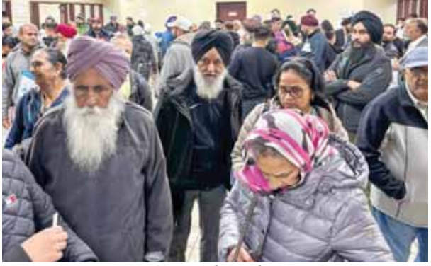
Indians at a consular camp in Brampton, Ontario, Sunday, November 3, 2024. The consular camp witnessed "violent disruptions" on Sunday as per Indian High Commission in Canada PTI

Brampton's Hindu Sabha Temple on Sunday, prompting the High Commission of India in Ottawa to issue a strong statement, condemning the attack by "anti-India" elements. Jaiswal also pointed out that it remains "deeply concerned" about the safety and security of its citizens in that country, asserting that the diplomatic officers providing consular services to Indians "will not be deterred by intimidation, harassment and violence". "We remain deeply concerned about the safety and security of Indian nationals in Canada. The outreach of our Consular officers to provide services to Indians and Canadian citizens alike will not be deterred by intimidation, harassment and violence," he said. According to a PTI report