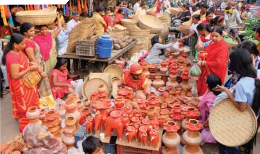
People purchase bamboo baskets and other items ahead of the 'Chhath Puja,' in Gurugram