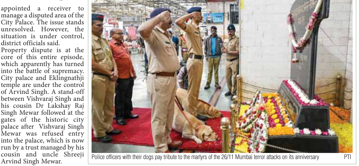
Police officers with their dogs pay tribute to the martyrs of the 26/11 Mumbai terror attacks on its anniversary