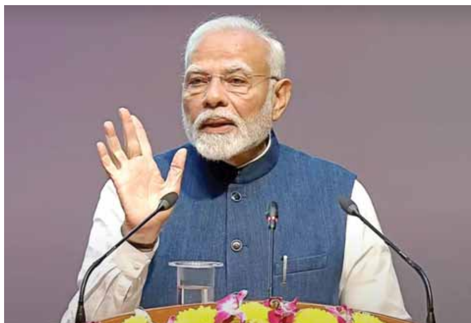
Prime Minister Narendra Modi addresses a gathering during Constitution Day celebrations at the Supreme Court

Hailing the Constitution as a "living stream", Prime Minister Narendra Modi on Tuesday said the sentiment of 'nation first' will keep the Constitution alive for centuries to come. Recalling the words of President Rajendra Prasad in his concluding address to the Constituent Assembly on November 26, 1949, PM Modi said he had stated that India does not need anything more than a group of honest people who will keep the country's interests above their own. Addressing an event marking Constitution Day celebrations at the Supreme Court, Modi said the Constitution has now been fully implemented in Jammu and Kashmir and Constitution Day was celebrated there for the first time. "Our Constitution makers knew that India's aspirations, India's dreams will reach new heights with time. They knew that the needs of Independent India and its citizens will change, challenges will change. That is why they did not leave our Constitution as just a mere book of laws. Rather, they made it a living, continuously flowing stream," Modi said, adding that the Constitution is acting as a "guiding light" at a time when India is going through a period of transformation. "Today every citizen of the country has only one goal, to build a developed India," he said at the event which was attended by Law Minister Arjun Ram Meghwal, Chief