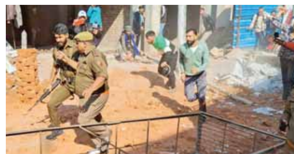
People protesting against a proposed ropeway project along the trek route to the Vaishno Devi shrine clash with police personnel, at Katra in Reasi district