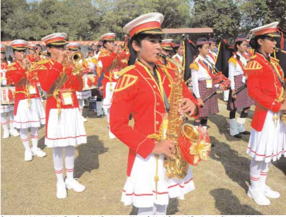
Students participate in West Zone State-level Band competition at Subhash School of Excellence in Bhopal on Monday.