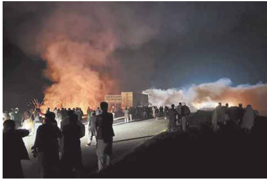
Supporters of Pakistan Tehreek-e-Insaf party, burn bushes to reduce the impact of tear gas shells fired by police officers to disperse them during a rally demanding Khan's release, at a motorway in Ghazi in Attock district, Pakistan

ing with Imran Khan on Monday in Rawalpindi's high-security Adiala Jail, where the former premier is lodged since last year.