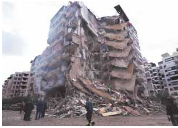
Residents gather in front of a destroyed building that was hit Sunday night in an Israeli airstrike in Dahiyeh, in the southern suburb of Beirut, Lebanon

The Israeli ambassador to Washington says that a cease-fire deal to end fighting between Israel and the Lebanon-based Hezbollah could be reached "within days."