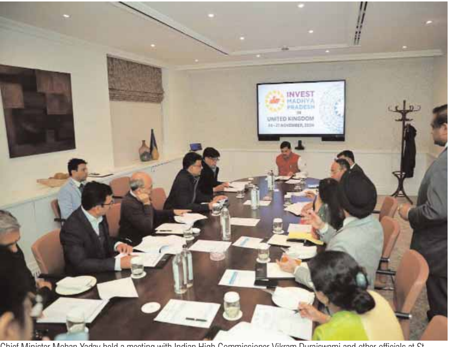
Chief Minister Mohan Yadav held a meeting with Indian High Commissioner Vikram Duraiswami and other officials at St. James Court (Taj) London and discussed investments in the State.

India in Munich on the morning of November 28. After that, he will visit SFC Energy and participate in an interactive session on investment opportunities in Madhya Pradesh. Representatives from the Consulate General of India, CII, Invest India, and the Indo-German Chamber of Commerce will also be present.