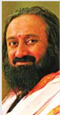
Sri Sri Ravi Shankar Spiritual Guru

A combination of different measures is needed to relieve work-related tension so that it does not affect life at home