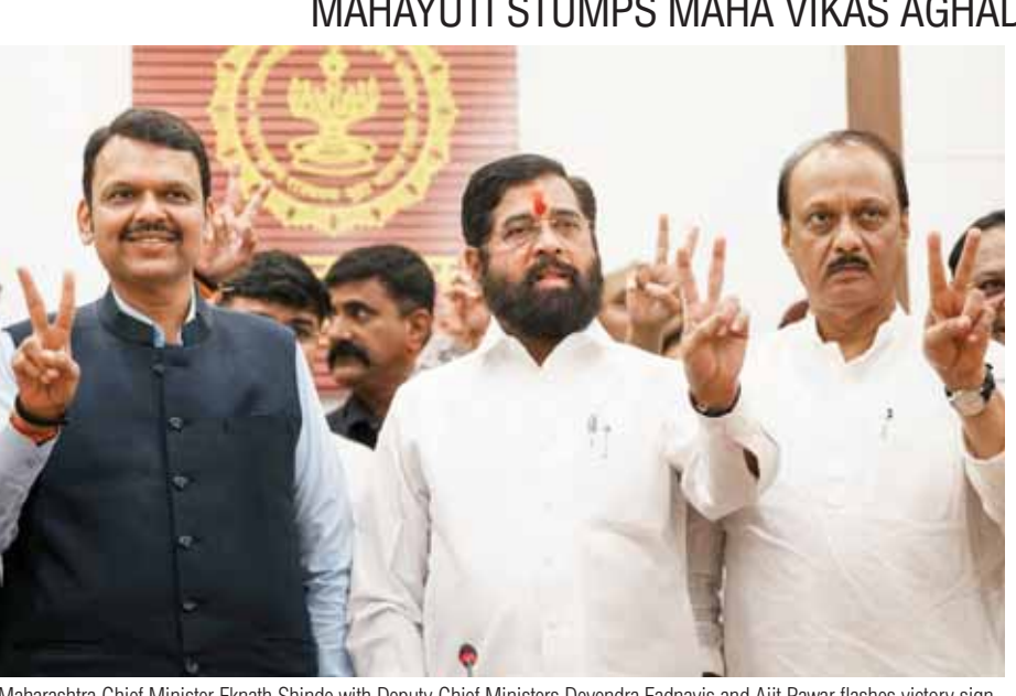
Maharashtra Chief Minister Eknath Shinde with Deputy Chief Ministers Devendra Fadnavis and Ajit Pawar flashes victory sign during a press conference as the BJP-led Mahayuti alliance secures victory.