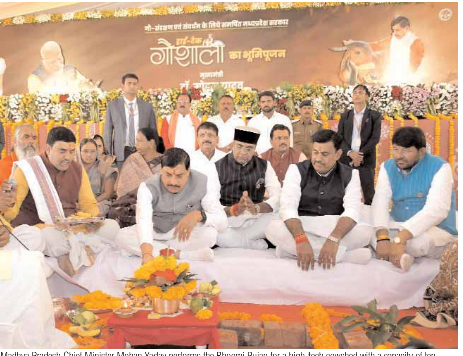
Madhya Pradesh Chief Minister Mohan Yadav performs the Bhoomi Pujan for a high-tech cowshed with a capacity of ten thousand cows in village Barkhedi Doab in Bhopal on Saturday.