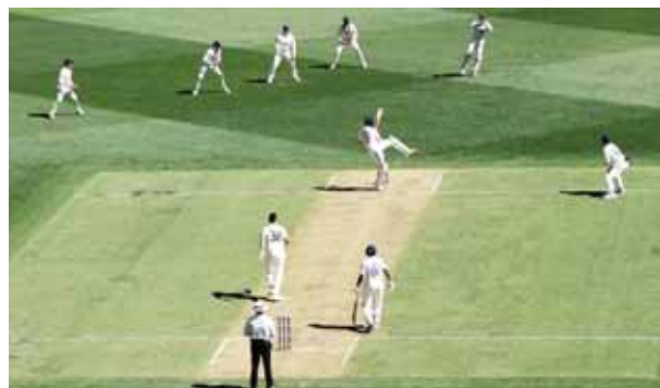
"The surface looked considerably dry today. It dried out fairly quickly," said McDonald during the post-day press conference. "We thought there may have been a little bit more there. So, I suppose if you want to say that we were a little bit

PTI ■ PERTH The home team bowlers did not put a foot wrong but the pitch dried up quite quickly at the Optus stadium on the second day, eventually helping the Indian batters, reckons Australia head coach Andrew McDonald. India openers Yashasvi Jaiswal (90) and KL Rahul (62) frustrated the hosts with their dogged unbeaten 172-run stand that has put the game in firm control of the visitors, who now lead by 218 runs. While the wickets fell in heap on the opening day with as many as 17 batters getting out, only three Australian tail-enders were dismissed on the second day.