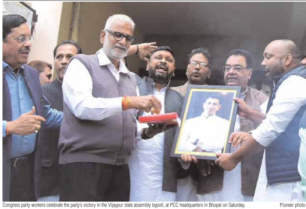
Congress party workers celebrate the party's victory in the Vijaypur state assembly bypoll, at PCC headquarters in Bhopal on Saturday.

Bhopal: Sagarites of Sagar Public School Dwarka Dham took the stage with awe-inspiring performances during their annual day celebration, themed 'Nav Bharat Ki Aur.' Sagarites, with an array of captivating acts, celebrated India's transformation journey from 1947 to its vision for 2047. The celebration was a testament to the creativity, talent, and dedication of over 1000 Sagarites, showcasing the school's commitment to nurturing academic and cultural excellence.