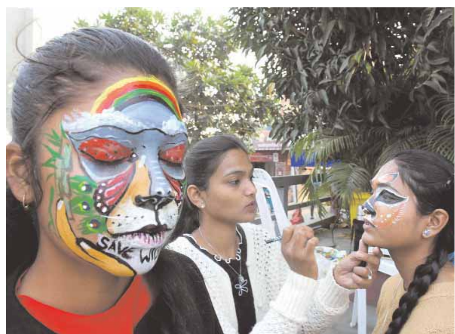
Women take part in a face painting event during 'Gramin Vikas Utsav' an exhibition cum sale of the products and artifacts of the women of self-help group from various states, organised by National Bank for Agriculture and Rural Development (NABARD) at Bhopal Haat, in Bhopal on Friday.

confidence in the current state leadership, as all this happened in the presence of AICC general secretary and in-charge of Madhya Pradesh Bhanwar Jitendra Singh. Recently, during the Congress protest with the demands of farmers, with the efforts of PCC Chief Jitu Patwari, all senior leaders had participated in the agitation in their respective divisions. Then, it was believed that the whole State unit of Madhya Pradesh Congress was united in the leadership of Patwari. However, the situation changes fast in the State unit of the Congress, after the State executive body if the PCC and Political Affairs Committee were declared.