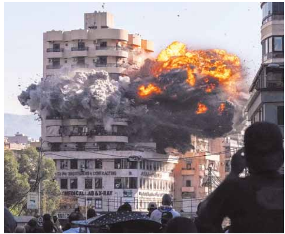
Smoke and flames erupt from a building hit in an Israeli airstrike in Chiyah, in the southern suburb of Beirut, Lebanon, on Friday.

the International Criminal Court’s arrest warrants for Israeli Prime Minister Benjamin Netanyahu and others, saying that the court’s rulings are “insignificant” for Russia, which doesn’t recognise the court’s jurisdiction. The ICC last year issued an arrest warrant for Russian President Vladimir Putin and a number of other top Russian officials, accusing them of war crimes in Ukraine. The Kremlin has brushed off the warrants, saying that in Moscow’s eyes they’re “null and void”. Asked if the ICC warrants for Netanyahu and others can help resolve the tensions in the Middle East, Peskov said: “Well, in general, the actions of the ICC are unlikely to help anything. That’s the first thing. And secondly, we don’t see any point in commenting on this in any way, because for us these rulings are insignificant.”