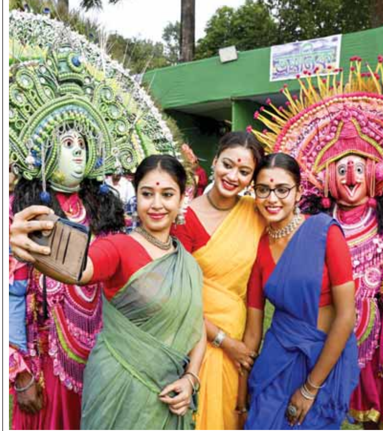
Artists take selfies during 'Jangal Mahal Utsav', a festival to promote tribal arts and culture, in Kolkata.