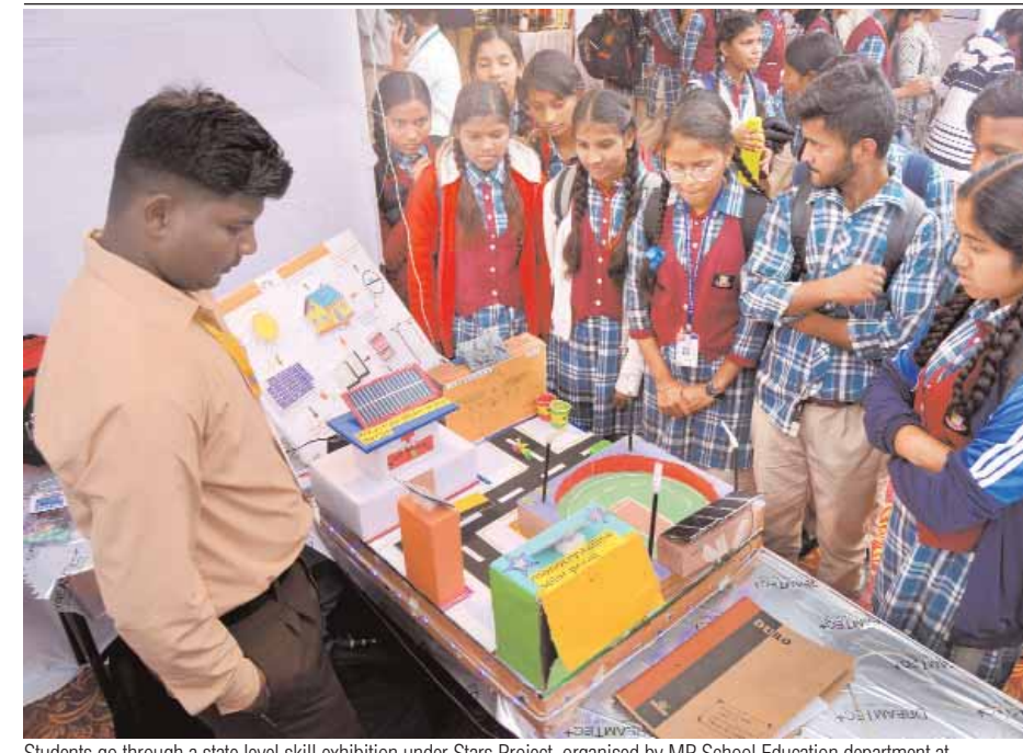
Students go through a state level skill exhibition under Stars Project, organised by MP School Education department at Government Subhash excellence school in Bhopal on Friday.