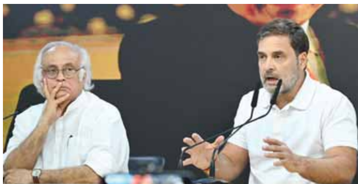
Leader of Opposition in Lok Sabha Rahul Gandhi and Congress leader Jairam Ramesh address a press conference in New Delhi