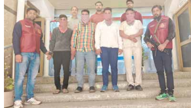
of Kadiya and Gulkhedi villages often enter into agreements known as 'Anubandh', where families receive financial compensation for sending their families to participate in theft operations," a senior police official said. The gang gives a 'crash course' to the young people so they can lift bags and steal valuables from the big fat weddings. "They use young recruits, trained to blend in at wedding functions, and are used to carry out