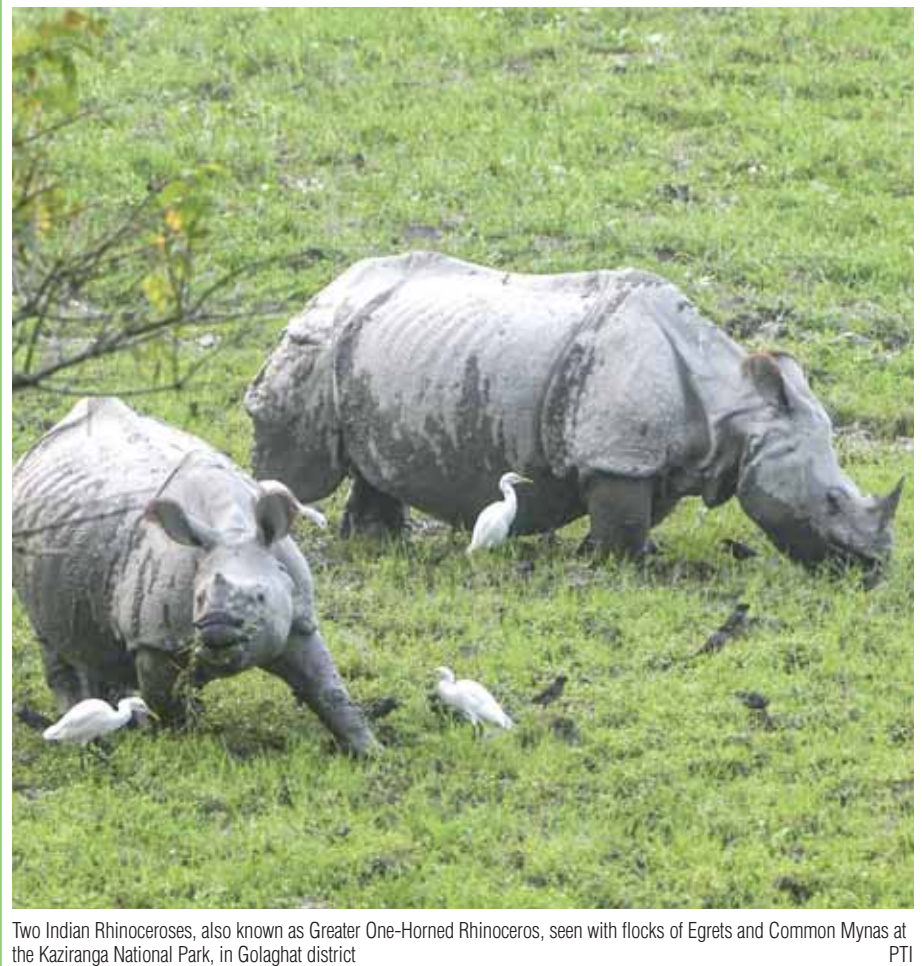
Two Indian Rhinoceroses, also known as Greater One-Horned Rhinoceros, seen with flocks of Egrets and Common Mynas at the Kaziranga National Park, in Golaghat district