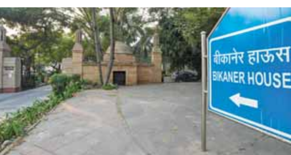
Bikaner House, in New Delhi, Thursday, Nov. 21, 2024. A Delhi court has directed the attachment of Bikaner House, which is owned by Nokha municipal council in Rajasthan, after it failed to pay arbitral award of ₹50.31 lakh to a company

Patiala House Court in Delhi has directed the attachment of the Iconic Bikaner House after the Nokha municipal council in Rajasthan which owns the historic building failed to pay an arbitral award of Rs 50.31 lakh to Enviro Infra Engineers Private Limited. The court passed the order on an application seeking enforcement of the arbitral award passed by the arbitral tribunal in January 2020. Bikaner House was designed as the residence of the Rajput rulers of the princely state of Bikaner. Bikaner House was built during the rule of Maharaja Ganga Singh, Maharaja of princely state of Bikaner (1887 to 1943 AD). Categorized as a Grade II