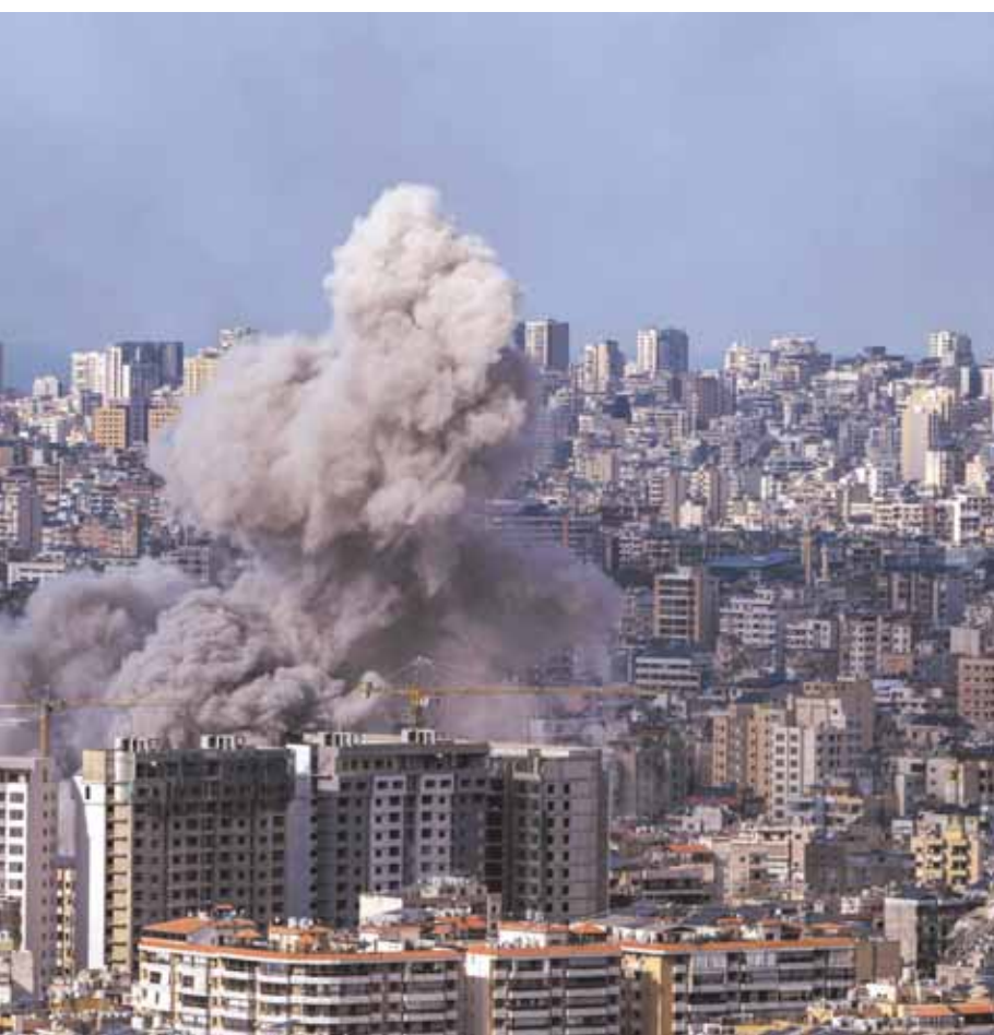
Smoke rises after an Israeli airstrike on Dahiyeh, in the southern suburb of Beirut, Lebanon, Thursday.

The court itself has no police to enforce warrants, instead relying on cooperation from its member states.