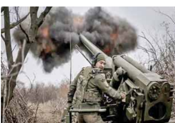
Two people were wounded as a result of the attack, and an industrial facility and a rehabilitation centre for people with disabilities were damaged, according to local officials. While the range of an ICBM would seem excessive for use against Ukraine, such missiles are designed to carry nuclear warheads, and the use of one would serve as a chilling reminder of Russia's nuclear capability and a powerful message of potential escalation.

Ukraine says Russia launched an intercontinental ballistic missile overnight targeting Dnipro city in the central-east of the country, which, if confirmed, would be the first time Moscow has used such a missile in the war. In a statement Thursday on the Telegram messaging app, Ukraine's air force did not specify the exact type of missile, but said it was launched from Russia's Astrakhan region, which borders the Caspian Sea. It said an intercontinental ballistic missile was fired at Dnipro city along with eight other missiles, and that the Ukrainian military shot down six of them.