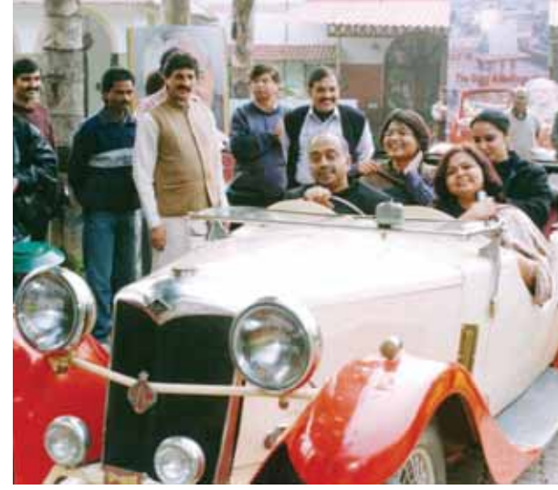
Former Union Minister Vijay Goel with one his coveted vintage cars which he used to take out as part of the exhibition he started to mark the birthday of former Prime Minister Atal Bihari Vajpayee

Amidst the crackdown on vehicles falling under scrap years, vintage car aficionados heaved a sigh of relief as Delhi Lieutenant Governor Vinai Kumar Saxena came to their rescue, directing the Delhi Transport Department that there should be no coercive action on the registered vintage vehicles. However, this has come with a rider that they are not to be driven on roads or used for commercial purposes. There are around 10,000 registered vintage cars in India. LG Saxena has directed that bona fide vintage vehicles will no longer face coercive action by the Transport Department and the Municipal Corporation of Delhi (MCD). According to Raj Niwas, the LG has asked the Commissioner Transport and Commissioner (MCD) to ensure that their enforcement wings desist from coercive action in case of such bona fide vehicles. Acting on a representation made by the Heritage Motoring Club of India, highlighting that their vehicles are being impounded by the authorities and requesting for clarificatory orders in this regard, the LG had asked his Secretariat to issue appropriate directions. The transport department's data shows there are