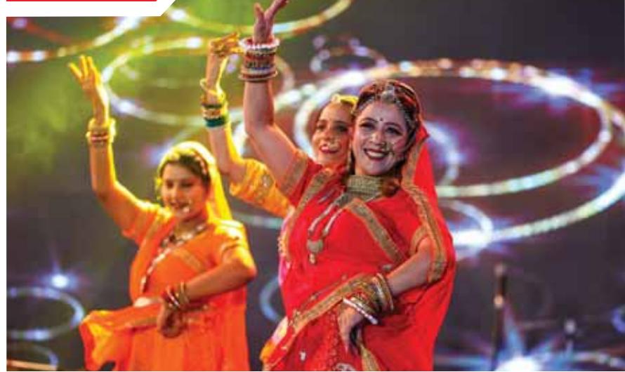
Folk dancers perform during the celebration of the 297th foundation day of 'Pink City', Jaipur