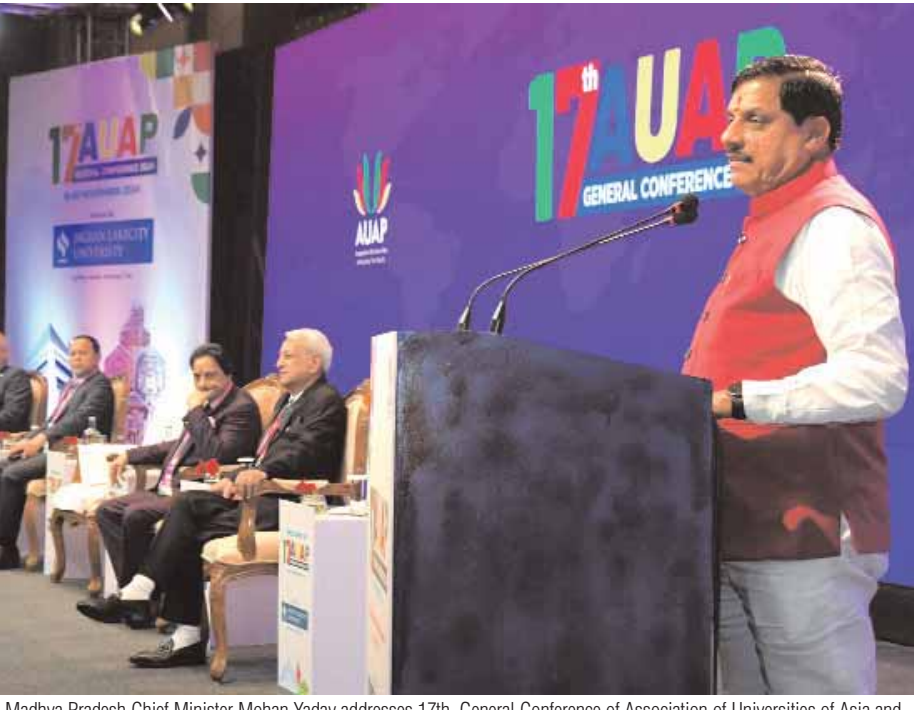
Madhya Pradesh Chief Minister Mohan Yadav addresses 17th General Conference of Association of Universities of Asia and the Pacific (AUAP), organised by Jagran Lakecity University in Bhopal on Tuesday.