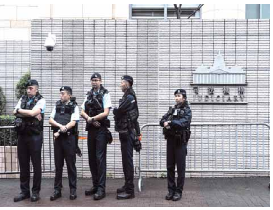
Police officers stand guard outside the West Kowloon Magistrates' Courts in Hong Kong on Tuesday.