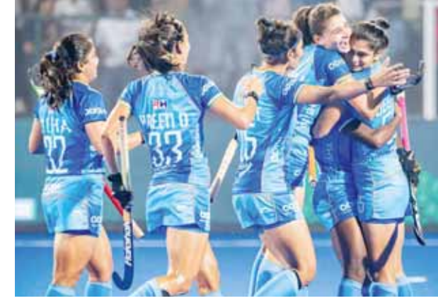
PTI ■ RAJGIR (BIHAR)