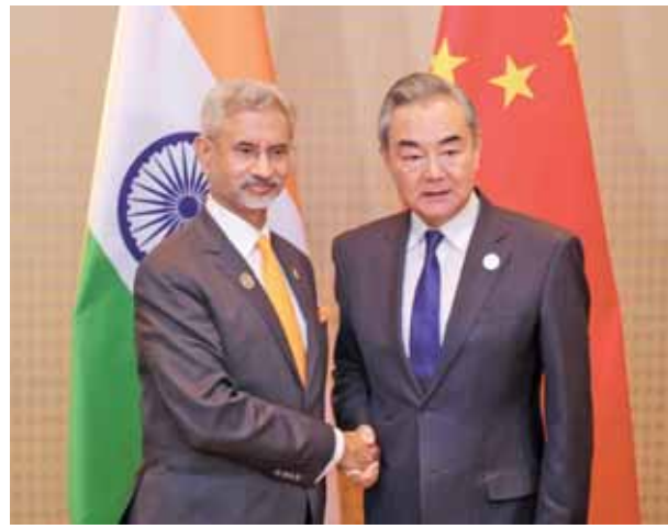
External Affairs Minister S Jaishankar in a meeting with China's Foreign Minister Wang Yi on the sidelines of the G20 Summit in Rio de Janeiro

External Affairs Minister S Jaishankar and his Chinese counterpart Wang Yi deliberated on the next steps in India-China ties at a meeting in Rio de Janeiro, in the first high-level engagement since the militaries of the two sides disengaged from Demchok and Depsang at the Line of Actual Control (LAC) in eastern Ladakh. The two leaders held the delegation-level talks on the sidelines of the G20 Summit in Rio de Janeiro late on Monday. The EAM said in a social media post both sides noted the progress in the recent disengagement of the border areas and exchanged views on the next steps in the bilateral ties. It is learnt that both sides are in the process of reviving various dialogue mechanisms including the special representatives talks on the boundary question as decided at a meeting between Prime Minister Narendra Modi and Chinese President Xi Jinping in the Russian city of Kazan last month. Days after the two sides reached an agreement on October 21 on disengagement in Demchok and Depsang, Indian and Chinese militaries completed the process marking a virtual end to over four-year standoff