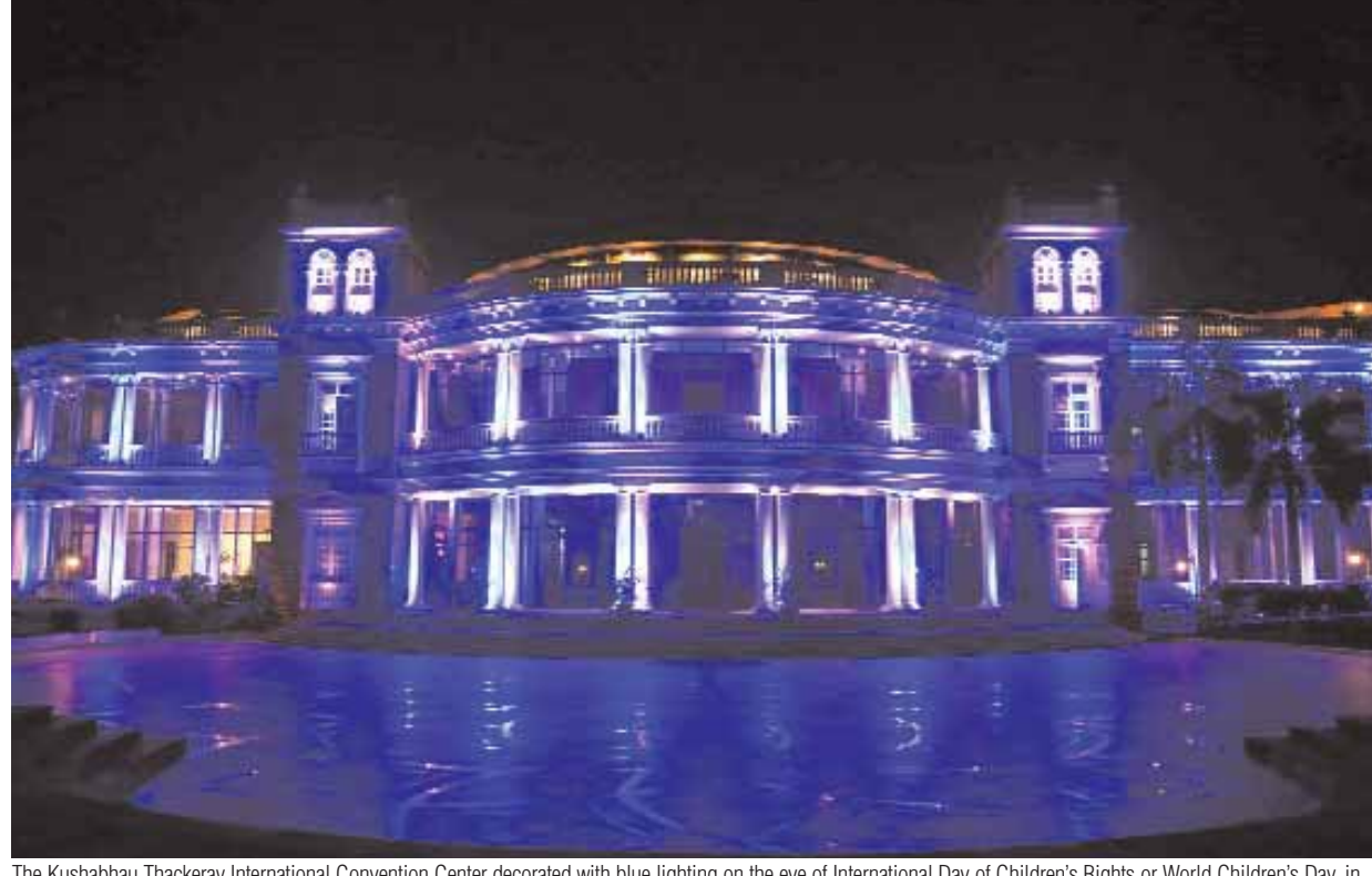
The Kushabhau Thackeray International Convention Center decorated with blue lighting on the eve of International Day of Children's Rights or World Children's Day, in Bhopal on Tuesday.

heights in the field of industrialization. He said that as per the vision of the Chief Minister, young entrepreneurs are moving forward in every district by organizing the Regional Industry Conclaves. Chief Minister Dr. Yadav is also going to go on a foreign tour to invite prominent industrialists. To make Madhya Pradesh a developed Madhya Pradesh, the Chief Minister has decided to celebrate the year 2025 as the Year of Industry. Chief Minister Dr. Yadav inaugurated the Madhya Pradesh Pavilion in the fair by lighting the lamp. He also visited various stalls set up in the Mandap and encouraged the craftsmen. The Pavilion has been developed on the theme of 'Vikasit Bharat@2047', in which the heritage of the state along with the artistic display of start-ups and enterprises has been showcased.