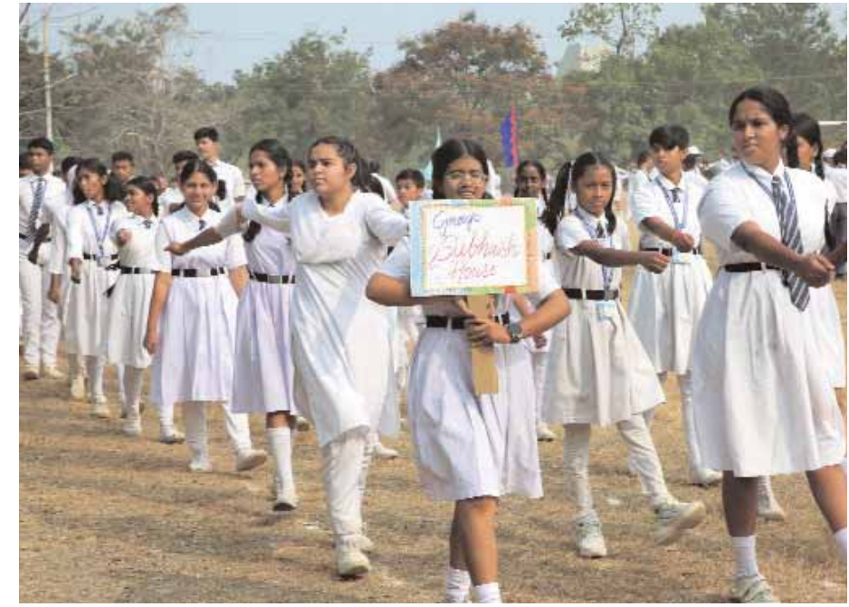
Students march past during the inauguration of the annual sports meet of Demonstration Multipurpose School, Regional Institute of Education in Bhopal on Tuesday.