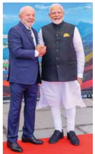
Prime Minister Narendra Modi being welcomed by President of Brazil Luiz Inacio Lula da Silva upon his arrival to attend the G20 Summit, in Rio de Janeiro, Brazil.

■ RIO DE JANEIRO The countries of the Global South are most adversely impacted by the food, fuel and fertilizer crisis caused by global conflicts and G20 must focus on addressing it, Prime Minister Narendra Modi said on Monday. In an address at a session at the G20 summit, Modi said India's G20 theme of "One Earth, One Family, One Future" is as relevant at the ongoing summit as it was last year. "I would like to say that countries of the Global South are most adversely impacted by the food, fuel and fertilizer crisis caused by global conflicts," he said. "So our discussions can only be successful when we keep in mind the challenges and priorities of the Global South," he added. The PM made the remarks at the G20 session on 'Social Inclusion and the Fight Against Hunger and Poverty'. Modi also called for reform of the institutions of global governance. "And just as we amplified the voice of the Global South by granting permanent membership of G20 to the African Union during the New Delhi summit, we will reform institutions of global governance," he said. The PM said India supports Brazil's initiative for a global alliance against hunger and poverty. "The people-centric decisions taken at the G20