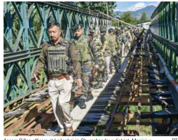
Assam Rifles officers at Laliohphai in Churachandpur district, Manipur.

PIONEER NEWS SERVICE ■ NEW DELHI / IMPHAL Union Home Ministry on Monday rushed 5,000 paramilitary troops to Manipur to assist the State Government in handling the current volatile situation. While 35 units will be drawn from the Central Reserve Police Force (CRPF), the rest will be from the Border Security Force (BSF). Home Minister Amit Shah reviewed the prevailing security situation and deployment of troops for the second consecutive day and directed top officials to focus on restoring peace and order there as early as possible. A total of 218 Central Armed Police Forces (CAPF) companies are now present in the State, which has been reeling from ethnic strife since May last year. The Home Minister took stock of the deployment of central forces there and directed the officials to restore peace and order there as early as possible, said officials. The situation in the Northeastern state, which has been reeling from ethnic strife since May last year, has been volatile following protests and violence after the recovery of bodies of women and