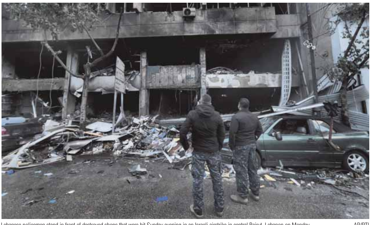
Lebanese policemen stand in front of destroyed shops that were hit Sunday evening in an Israeli airstrike in central Beirut, Lebanon on Monday.

tion "is to make sure the (Israeli) aggression fails to achieve its goals, while negotiation is for the state and the government". A Western diplomat familiar with the talks told The Associated Press there is a sense of "cautious optimism". "Diplomatic efforts are converging towards a cease-fire, but it's still in the hands and heads of key players to decide if it's in their interest or not to stop things right now," said the diplomat, who was not authorized to brief media and so spoke on condition of anonymity. The efforts are aimed at reestablishing a UN buffer zone in southern Lebanon established after the 2006 Israel-Hezbollah war.