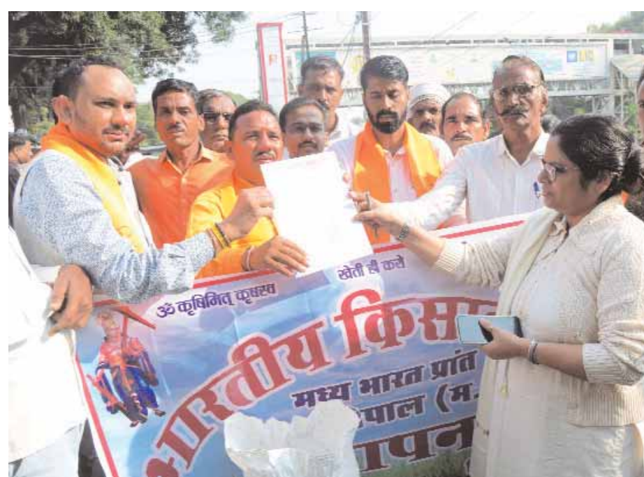
Farmers under the banner of Bharatiya Kisan Sangh handing over a memorandum to officials during a demonstration at district collector office against the shortage of Urea and DAP, undeclared power cuts during the sowing season, in Bhopal on Monday.