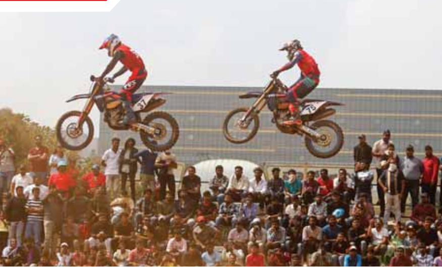
Riders take part in the MRF MOGRIP Supercross Championship 2024, in Bengaluru