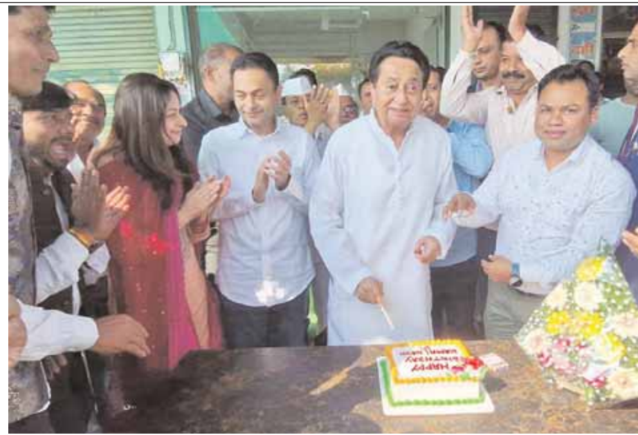
Senior Congress leader and former Chief Minister Kamal Nath cuts a cake on his birth anniversary in Chhindwara, Madhya Pradesh on Monday.