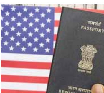
(23,157). "India is the top sender of international students (for the first time since 2008/2009) with over 3,31,602 students studying in the

time high" at 3,31,602, a rise of 23 per cent from 2022-23 when the number stood at 2,68,923. "India is now the leading country of origin for international students in the United States, accounting for 29 per cent of the total international student population," according to a note shared by the US Embassy on the Open Doors Report 2024. According to official data associated with the latest report, the top five source countries for international students in the US for 2023-24 are: India, China (2,77,398), South Korea (43,149), Canada (28,998) and Taiwan