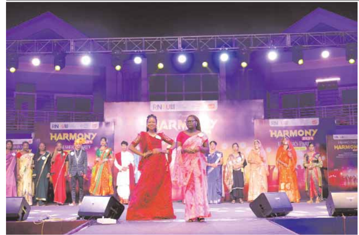
Students participate in a fresher's party 'Harmony-2024' at Rabindranath Tagore University in Bhopal on Monday.