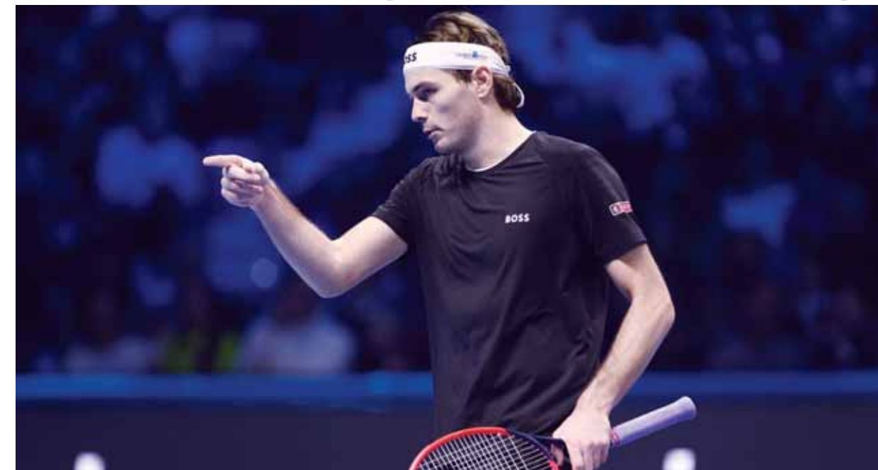
the season-ending events after Coco Gauff won the WTA Finals last week. Fritz's run in New York made him the first American man to reach a Grand Slam singles final in 15 years. He's playing at the ATP Finals for

Andre Agassi in 1999. "I trust my game and I trust my level and I don't feel nearly as uncomfortable in these situations anymore because I've been playing the top guys at big events a lot lately," Fritz said. "I'm getting more comfortable in the moment. I'm really, really confident in my game." Fritz upbeat after loss to Sinner. Fritz came away encouraged from his 6-4, 6-4 loss to Sinner on Tuesday. "I felt much more comfortable from the baseline. ... I had chances to break him in both sets," Fritz said. "He had an equal amount of chances, and he took his. He played the big points better than I did. It didn't feel anywhere near as one-sided as the Open." Sinner noted that Fritz "played a great match." "The difference was just a few points. Tomorrow will be very similar. ... But finals are always different than group matches." Fritz trying to match Gauff. Fritz wins the trophy, it will mark an American sweep of