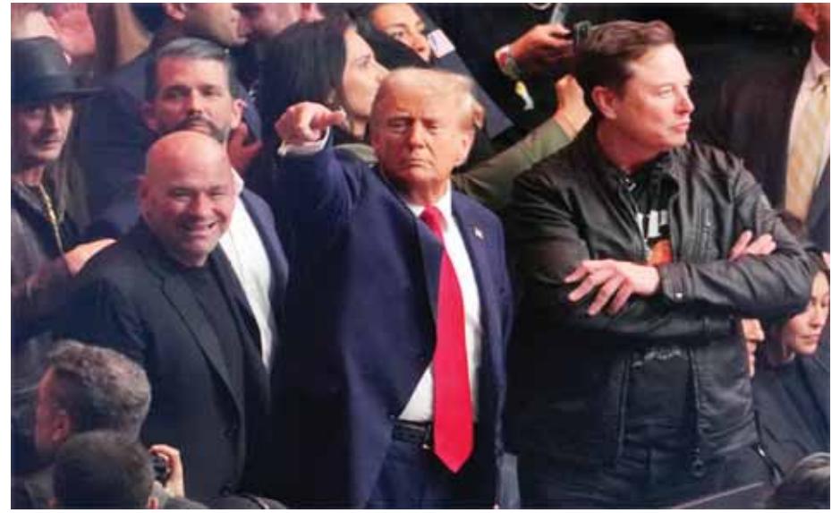
President-elect Donald Trump attends UFC 309 at Madison Square Garden, Saturday in New York, with Kid Rock, Donald Trump Jr., Dana White and Elon Musk.

President-elect Donald Trump has selected Chris Wright, a campaign donor and fossil fuel executive, to serve as energy secretary in his upcoming, second administration. CEO of Denver-based Liberty Energy, Wright is a vocal advocate of oil and gas development, including fracking, a key pillar of Trump's quest to achieve US "energy dominance" in the global market. Wright has been one of the industry's loudest voices against efforts to fight climate change and could give fossil fuels a boost, including quick action to end a year-long pause on natural gas export approvals by the Biden administration. Wright also has criticised what he calls a "top-down" approach to climate by liberal and left-wing groups and said the climate movement around the world is "collapsing under its own weight". Wright, who has never served in government, has written that more fossil fuel production is needed around the globe to lift people out of poverty. Consideration of Wright to head the administration's energy department won support from influential conservatives, including oil and gas tycoon Harold Hamm. Hamm, executive chairman of Oklahoma-based Continental Resources, a major shale oil company, is a longtime Trump supporter and advisor who played a key role on energy issues in Trump's first term. Hamm helped organise an event at Trump's Mar-a-Lago resort in April where Trump