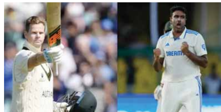
he wants to," he added. Ashwin's Test bowling average stands at a modest 42.15 in Australia compared to his home average of 21.57. Smith hoped to land the first blow on the 38-year-old to gain an early upper hand in the five-match series, beginning at Perth from November 22.

Australian batting talisman Steve Smith wants to adopt a proactive approach against Ravichandran Ashwin in the upcoming Border-Gavaskar Trophy to avoid his struggles against the Indian spinner during the 2020-21 series. Ashwin had nicked off Smith thrice during that rubber, and later in 2023 the Indian off-spinner dismissed the Aussie twice as he could only make 22 runs against his old foe. "I don't like getting out to off-spin in Australia. But he's also a very good bowler and he came in with some decent plans. There were a couple of occasions where he got on top of me," Smith told the Sydney Morning Herald. "But then I got on top of him at the SCG when I was a bit more proactive (Smith made 131 and 81 at Sydney). So, that's key for me. Just be proactive against him and not let him settle and bowl the way