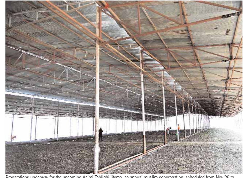
Preparations underway for the upcoming Aalimi Tablighi Ijtema, an annual muslim congregation, scheduled for Nov 29 to Dec 2, at Eitkhedi, Ghasipura near Bhopal on Sunday.