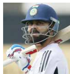
against New Zealand, you've got plenty of ammunition to back yourself up," Fox Cricket noted McGrath as saying on 'CODE Sports'. "So put the pressure on them and see if they're up for it," he added. Kohli, who has been India's batting mainstay for over a

Pace legend Glenn McGrath feels Australia have the "ammunition" to target an "emotional" Virat Kohli, who will be under pressure if he gets off to a poor start at the five-match Test series for the Border-Gavaskar Trophy, starting in Perth from November 22. India have won the last four Test series against Australia, including two Down Under. However, they head into the much-anticipated five-Test assignment on the back of a 0-3 series whitewash at the hands of New Zealand at home. "Without a doubt, especially after coming off a 3-0 loss