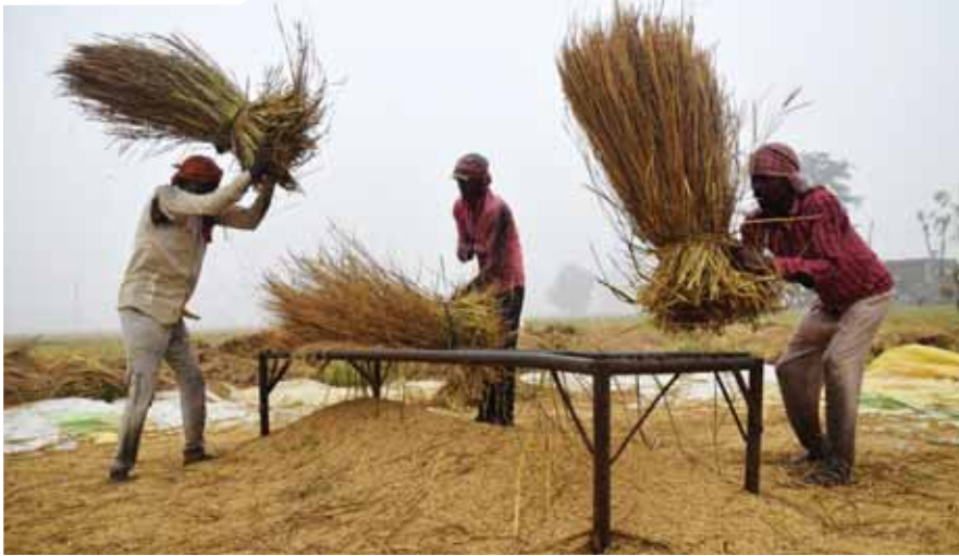
Labourers thresh paddy at a field on the outskirts of Amritsar