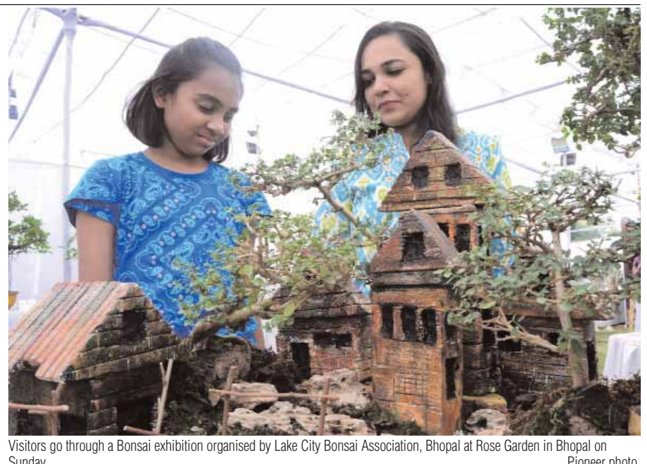
Visitors go through a Bonsai exhibition organised by Lake City Bonsai Association, Bhopal at Rose Garden in Bhopal on Sunday.