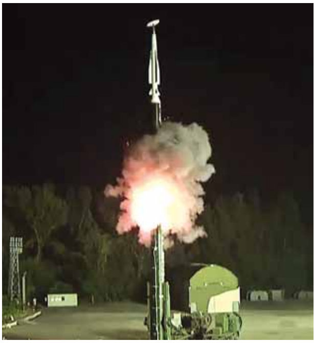
Flight trial of DRDO's long range hypersonic missile being successfully conducted at Dr. APJ Abdul Kalam Island, off-the-coast of Odisha