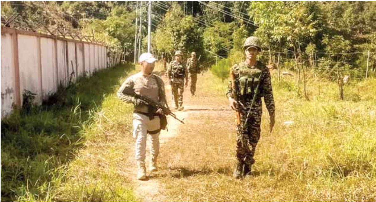
Security personnel patrol in a sensitive area of Manipur. Search operations and area domination were conducted by security forces in the fringe and vulnerable areas of hill and valley districts of the state