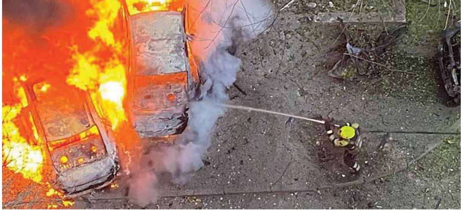
In this photo provided by the Ukrainian Emergency Service, emergency services personnel remove part of a Russian missile that hit an apartment house during massive missile attack in Kyiv, Ukraine, Sunday. AP/PTI

Western allies to bolster the country's air defences to counter assaults and allow for repairs. Explosions were heard across Ukraine on Sunday, including in capital Kyiv, the key southern port of Odesa, as well as the country's west and central regions, according to local reports. The operational command of Poland's armed forces wrote on X that Polish and allied aircraft, including fighter jets, have been mobilised in Polish airspace because of the "massive" Russian attack on neighbouring Ukraine. The steps were aimed to provide safety in Poland's border areas, it said. One person was injured after the roof of a five-story residential building caught fire in Kyiv's historic centre, according to Popko. A thermal power plant operated by private energy company DTEK was "seriously damaged", the company said.