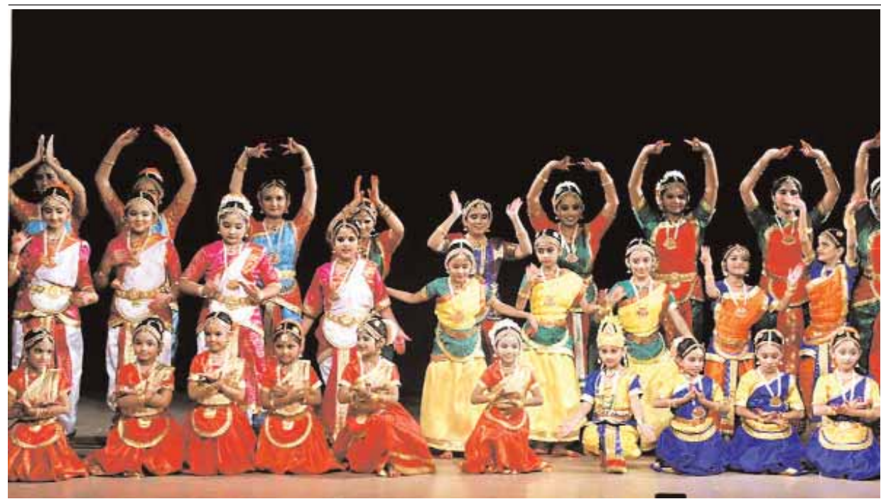
Artistes perform at a cultural event organised by Nrityanjali Bharatanatyam Nritya Academy at Shaheed Bhawan in Bhopal on Sunday.