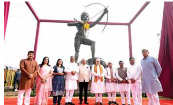
Union Home Minister Amit Shah, Delhi Lt Governor Vinay Kumar Saxena, Union Minister Manohar Lal Khattar, Union Minister of State Harsh Malhotra, BJP MPs Manoj Tiwari, Bansuri Swaraj, Kamajjeet Sehrawat and Ramvir Singh Bidhuri and others during the unveiling of a statue of freedom fighter Birsa Munda on his birth anniversary

(Inn of Moustaches) because every man had long moustaches, which was a symbol of masculinity in those days. The renaming of the historic area, comes ahead of the Delhi Assembly polls, and was announced by the minister on the occasion of the unveiling of a statue of Birsa Munda by Union Home Minister Amit Shah and Delhi Lieutenant Governor Vinay Kumar Saxena at the Baansera Bamboo Park near Sarai Kale Khan inter-state bus terminus (ISBT) in south-east Delhi. President Droupadi Murmu, Prime Minister Narendra Modi and several leaders also paid tributes to the great leader. Birsa Munda spearheaded a tribal movement that started in the