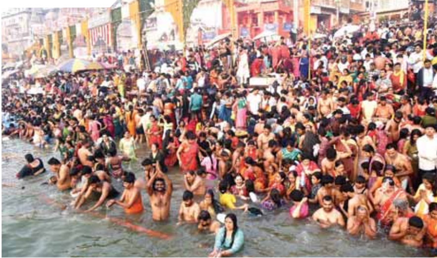
Devotees take a holy dip in the Ganga river at a ghat on the occasion of 'Kartik Purnima' festival, in Varanasi.