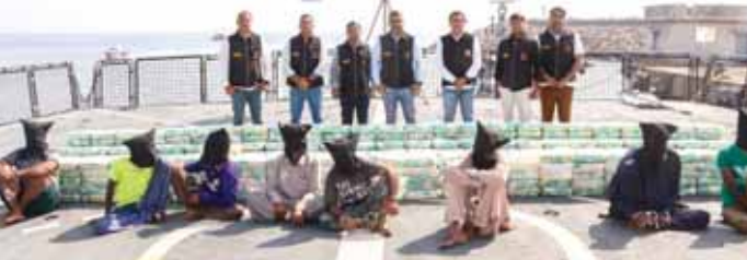
NCB personnel after an operation in which they successfully dismantled an international drug trafficking cartel and seized approximately 700 kg of meth in Gujarat

In a joint operation, agencies on Friday seized about 700 kg of drugs and arrested eight Iranian nationals from Indian territorial waters off the Gujarat coast around Porbandar. The street value of the seized Methamphetamine, a synthetic recreational variety of narcotics, could be anywhere between Rs 2,500-3,500 Crore in the international market, said Narcotics Control Bureau (NCB) officials. An operation codenamed 'Sagar Manthan- 4' was launched based on intelligence inputs to intercept an unregistered vessel, without an