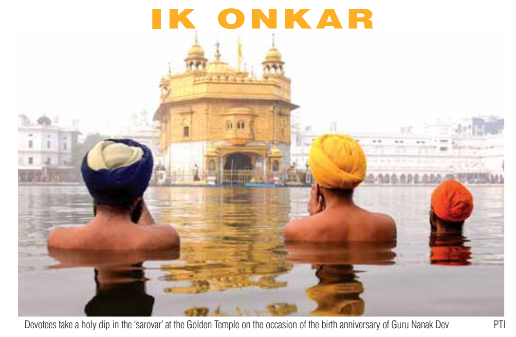
Devotees take a holy dip in the 'sarovar' at the Golden Temple on the occasion of the birth anniversary of Guru Nanak Dev

as of 9 am in the morning, marking the third consecutive day of severe pollution. Of the 39 monitoring stations in Delhi, 21 registered severe AQI levels, with four classified as 'severe plus'. The top five polluted areas in Delhi this morning are Jahangirpuri (with AQI 458), Bawana (455), Wazirpur (455), Rohini (452), and Punjabi Bagh (443), according to Central Pollution Control Board's Sameer App. However, the 24-hour overall air quality showed slight improvement compared to Thursday's AQI of 432. Drone footage captured from areas like AIIMS and Akshardham Temple highlighted the extent of smog, making even prominent landmarks barely visible. After a high level meeting with officials and all stakeholders, Delhi Environment Minister Gopal Rai announced that an additional 106 cluster buses would ply in the city while metro trains would make 60 extra trips in view of GRAP-3 measures imposed due to worsening air quality. Emergency measures, such as artificial rain, will be considered if the air quality deteriorates further, the minister said, adding that he would Centre about it again. Private construction and demolition activities have been banned under GRAP III measures, he said.