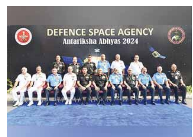
The discussions highlighted the importance of monitoring and protecting critical assets and maintaining situational awareness in the increasingly contested space environment. Throughout the three-day event, participants engaged in scenario based exercises, facilitated by subject experts from various Ministries and Departments of the Government of India, besides military, scientific and academia. The experts provided valuable

Defence Space Agency has successfully conducted maiden three-day Exercise 'Antariksha Abhyas' to enhance strategic readiness in space warfare, defence ministry said here on Wednesday. Giving details, officials said Defence Space Agency of Headquarters Integrated Defence Staff successfully conducted the Space Table Top Exercise Antariksha Abhyas-2024 from November 11 - 13, a significant milestone aimed at bolstering the strategic readiness of the Indian Armed Forces in the domain of space warfare. This pioneering event marked a crucial step in strengthening India's space based operational capabilities, enhancing tri-services integration for space security. Key components of the exercise included focused discussions on emerging space technologies, space situational awareness and India's space programmes.