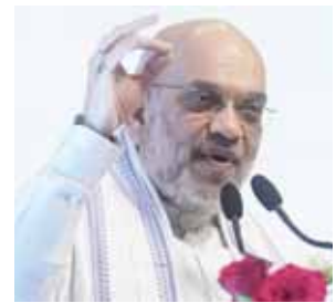
"In a firm step towards realizing Modi Ji's vision of enhancing women's participation in every field of nation-building, the Modi government has approved the establishment of the first all-women battalion of the CISF. "To be raised as an elite troop, the Mahila Battalion will shoulder

Union Home Minister Amit Shah on Wednesday said the soon to be raised all-woman battalion of the CISF will shoulder the responsibility of protecting the nation's critical infrastructure, like airports and metro rails, and provide security to VIPs as commandos. A first-ever all-woman battalion of the Central Industrial Security Force (CISF) comprising more than 1,000 personnel was sanctioned by the Union government on Monday keeping in mind the burgeoning duties of the force.