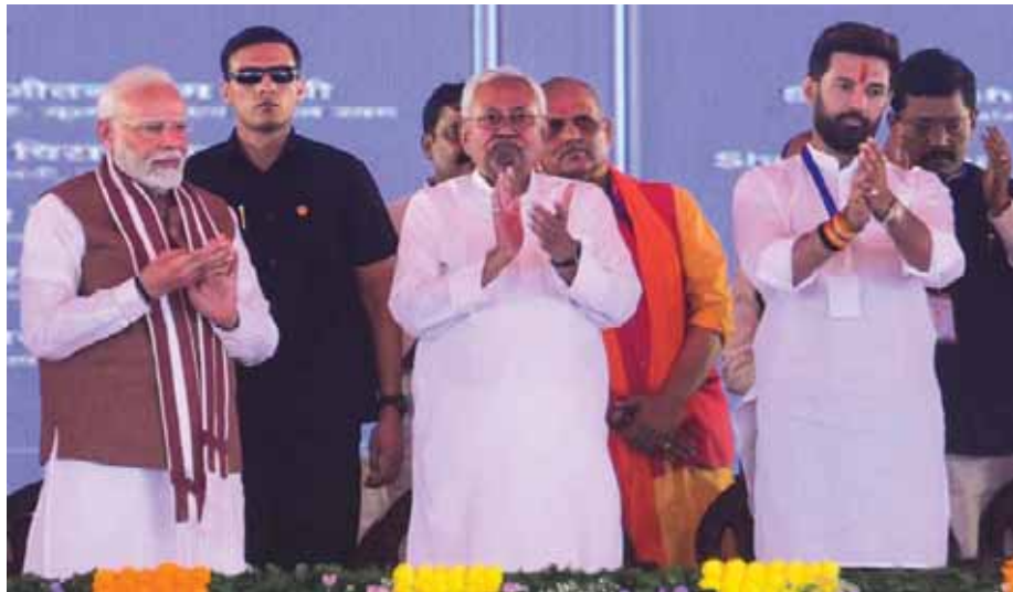
The Prime Minister began his speech with a reference to the assembly polls underway in Jharkhand, which was carved out of Bihar two-and-a-half decades ago, and hoped that

"lokpriya mukhyamantri" (popular chief minister). Modi said, "Nitish babu has set up a model of sushasan (good governance)." He added, "No praise is too high for him (jitni saraahna ki jaae kam hai) for his contribution in pulling Bihar out of the era of jungle raj." Now, under the NDA's double engine government, the state is making rapid, all-round progress." Earlier, Kumar had thanked the Prime Minister for AIIMS, Darbhanga, even as he recalled having first made request for the super speciality hospital in the north Bihar town with late BJP leader Arun Jaitley.