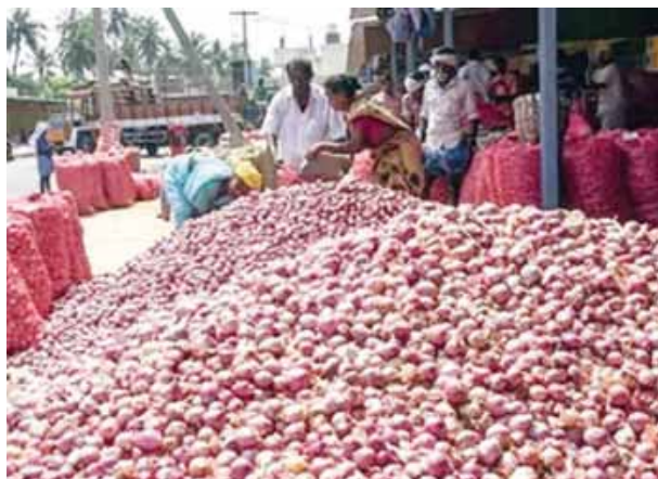
per kg in Nashik. Onions are not produced in Odisha and hence, the state is dependent on other states. Prices of onion and garlic are high outside the state