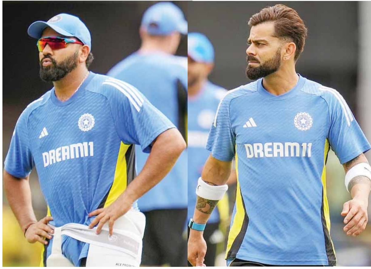
Kohli with the new ball, and that they should quickly sort their batting. ("They should) work on their technique, freshen up, get away from cricket for as much as they can and then hit the ground running when

Former Australian pacer Brett Lee has advised India skipper Rohit Sharma and star batter Virat Kohli to hit the "reset button", work on their technique and hit the ground running in the five-Test series against Australia, beginning in Perth in less than 10 days' time. The two batting stalwarts will be keenly observed during the Border-Gavaskar series. Down Under following their underwhelming performance in the 0-3 Test whitewash by New Zealand recently. "When you have a couple of bad runs back to back, that's when the pressure gets set in. So, I guess the thing now is that someone like Virat Kohli and Rohit Sharma, they've just got to go back to the drawing board," Lee said on his YouTube channel. "They are champions because they do the basics better than anybody else. Then, just hit the reset button, almost." Lee also warned that the Australian pacers would be aiming to attack Rohit and