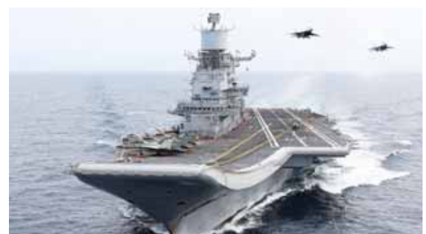
organisations and agencies, it said. While coastal security exercises are conducted by individual coastal states and maritime security agencies regularly, 'Exercise Sea Vigil' coordinated by the Indian Navy stands out as a national-level initiative that provides a holistic appraisal of India's maritime defence and security capabilities. "The exercise offers a significant opportunity to assess the current preparedness of all maritime security agencies, identify their strengths and weaknesses and enhance the nation's overall maritime defence framework," the Navy said. The Coastal Defence and Security Readiness Evaluation

A pan-India coastal defence exercise aimed at assessing the current preparedness of all maritime security agencies, identifying their strengths and weaknesses and enhancing the nation's overall maritime defence framework is set to be conducted on November 20-21, the Navy said on Wednesday. Originally conceptualised in 2018, 'Exercise Sea Vigil' was designed to validate and enhance measures adopted to bolster coastal defence post the 26/11 Mumbai terror attacks. "This year, participation by other Services (the Indian Army and the Indian Air Force), and planned deployment of a large number of ships and aircraft have enhanced the tempo of the exercise," according to a statement issued by the Indian Navy. The Navy leads this exercise whose fourth edition, to be held on November 20-21, will span an "unprecedented scale", both in terms of geographical reach and the magnitude of participation, with the involvement of six ministries and 21