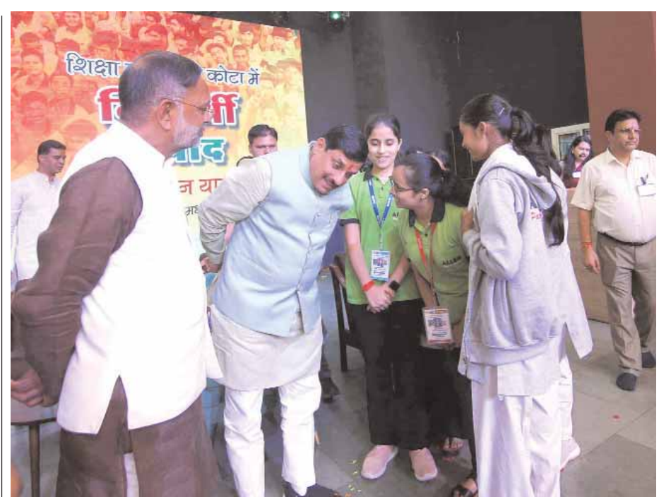
Madhya Pradesh Chief Minister Mohan Yadav interacts with the students of Madhya Pradesh in Kota, Rajasthan on Wednesday.

(ECHS), or Ayushman CAPP must choose between their current plan and the Ayushman Bharat scheme. Senior citizens covered under private health insurance or the Employee State Insurance (ESI) scheme are also eligible to receive benefits under the Ayushman scheme. Dr Bharsat emphasized that the Aadhaar card serves as the primary identification document for beneficiaries in the scheme. For those whose Aadhaar card only shows the birth year instead of the full date, January 1, 2025, will be considered as the eligibility date upon reaching 70 years of age. Three methods are available for easy identification: thumb impression, iris scan, and mobile OTP, ensuring a smooth registration process for beneficiaries.