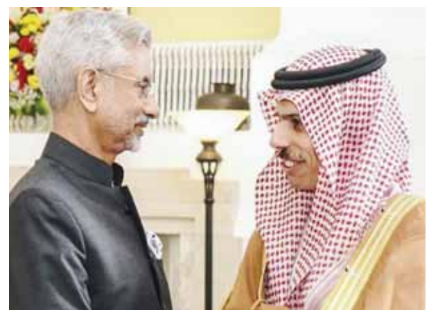
for the industries of the two sides to build new partnerships. "Trade and investment are important pillars of our partnership, and we are strengthening our collaboration in new areas including technology, energy, renewable energy including green hydrogen, connectivity, health and education," he said. Al Saud is on a two-day visit to India. On the situation in Gaza, Jaishankar said any response

India supports an early ceasefire in Gaza and it has consistently stood for resolution of the Palestinian issue through a two-state solution, External Affairs Minister S Jaishankar said here on Wednesday. In his opening remarks at a meeting with Saudi Foreign Minister Prince Faisal bin Farhan Al Saud, Jaishankar said the situation in West Asia is a matter of "deep concern", particularly the conflict in Gaza. The external affairs minister described Saudi Arabia as an important force for stability in the region. In his opening remarks at a meeting with Saudi Foreign Minister Prince Faisal bin Farhan Al Saud, Jaishankar said the situation in West Asia is a matter of "deep concern", particularly the conflict in Gaza. The external affairs minister described Saudi Arabia as an important force for stability in the region. Jaishankar and Al Saud co-chaired the second meeting of the Committee on Political, Security, Social and Cultural Cooperation (PSSC) held under the framework of the Strategic Partnership Council (SPC). In his remarks, Jaishankar said Saudi Arabia's Vision 2030 and India's Viksit Bharat 2047 hold complementarities