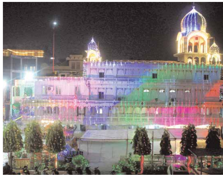
Tinsel lights illuminate Gurdwara Nanaksar ahead of Guru Nanak Dev's birth anniversary in Bhopal on Wednesday.