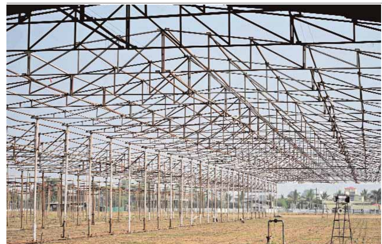
Preparations underway for the upcoming Aalimi Tablighi Ijtima, an annual muslim congregation, scheduled from Nov 29 to Dec 2, at Eintkhedi, Ghasipur near Bhopal on Wednesday.