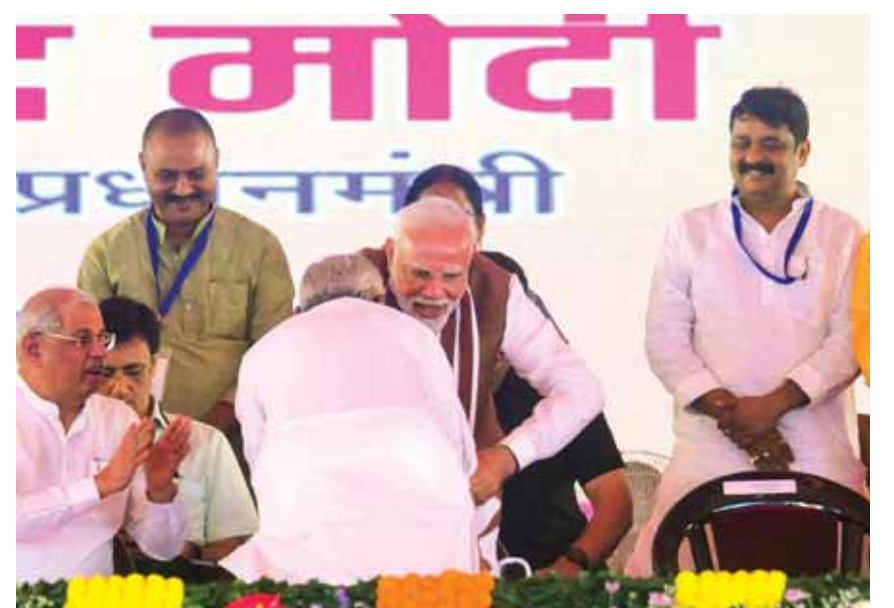
Bihar Chief Minister Nitish Kumar took everyone by surprise at an event in Darbhanga when he tried to touch Prime Minister Narendra Modi's feet. In a video that has gone viral on social media, Nitish Kumar, 73, walked towards PM Modi, 74, with folded hands and bowed to touch his feet in a third such instance this year. However, PM Modi quickly stops the JD(U) leader from touching his feet and is seen shaking his hands. Another video that has gone viral from the same event shows Modi pulling Nitish Kumar to his side as party workers garland the Prime Minister