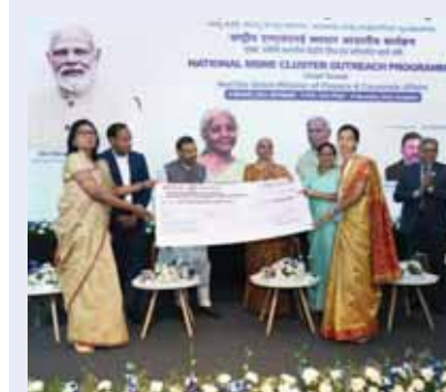
The Finance Minister launched five Nari Shakti branches of Union Bank of India for women entrepreneurs in a step to boost women's power. Union Finance Minister Nirmala Sitharaman virtually inaugurated five Nari Shakti branches of Union Bank of India

from Bengaluru. She urged the bank to develop technology-driven, cluster-based schemes specifically tailored to support women, aiming to empower female entrepreneurs and strengthen financial inclusion for women across the country. Furthermore, she encouraged women entrepreneurs to make use of these schemes and contribute to job creation. The Nari Shakti operates with a focus on extending credit to women entrepreneurs. In addition to financing women-owned manufacturing and service units, the bank will also focus on advisory services, workshops on start-ups, skill development programs, mentorship, networking, and collaborations. Union Bank of India has opened Nari Shakti branches in Bengaluru, Chennai, Visakhapatnam and Jaipur. It is a right step in the right direction. Akhilesh Krishnan | Mumbai