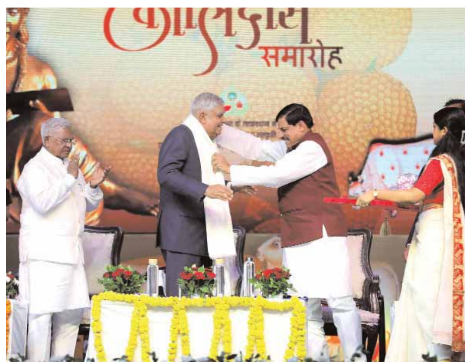
Vice President Jagdeep Dhankhar being felicitated by Madhya Pradesh Chief Minister Mohan Yadav as Governor Mangubhai Patel looks on at the inauguration ceremony of 66th Akhil Bharatiya Kalidas Samaroh in Ujjain, Madhya Pradesh on Tuesday.

will have to sacrifice himself while discharging his civic duties. Referring to the empowerment of women, the Vice President said that the works of great poet Kalidas are an important example of empowerment of women. His work Abhigyan Shakuntalam can be seen as a reference. Dhankhar said that under the leadership of Prime Minister Narendra Modi, today every person in the country has an opportunity to showcase his talent. The development of technology in the country is surprising the whole world. "Ek Ped Maa Ke Naam" campaign has been launched by the Prime Minister for environmental protection. This campaign will bring the same revolution as has happened in the field of cleanliness. In the coming year 2047, India will become the leader of the world.