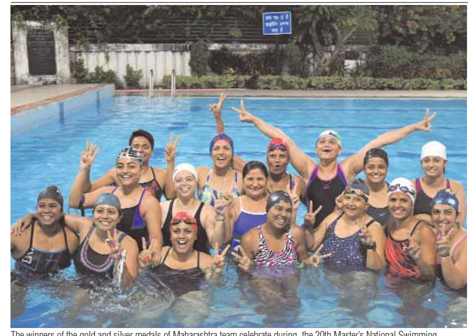
The winners of the gold and silver medals of Maharashtra team celebrate during the 20th Master's National Swimming Championship under the auspices of the Swimming Federation of India at Prakash Taran Pushkar in Bhopal on Tuesday.