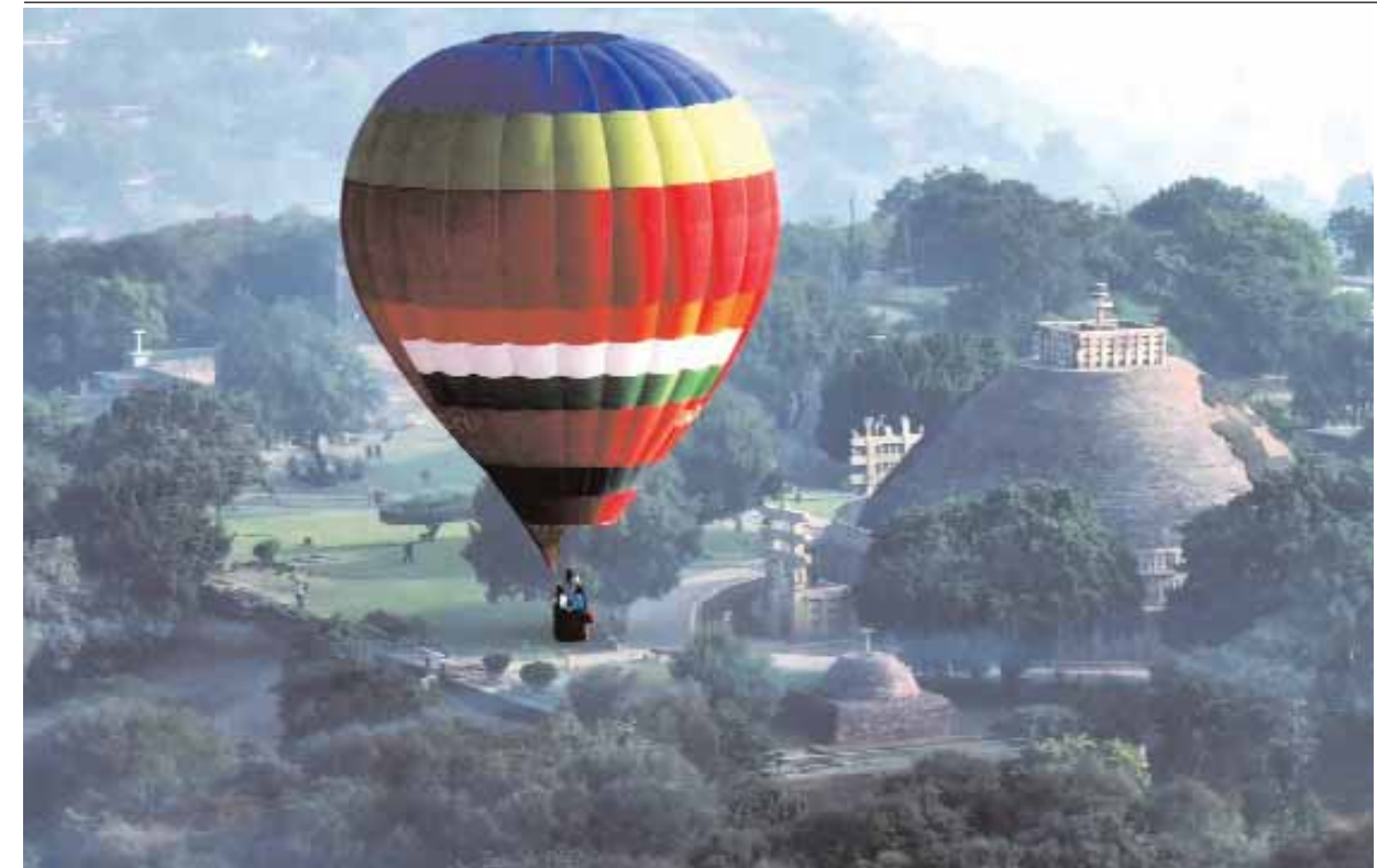
A hot air balloon flies in the air over the world heritage site Sanchi stupas during a hot air balloon show jointly organised by Army Adventure Nodal Center, 3 EME Center of Indian Army and Madhya Pradesh Tourism Board at Sanchi, Raizen district Madhya Pradesh on Tuesday.