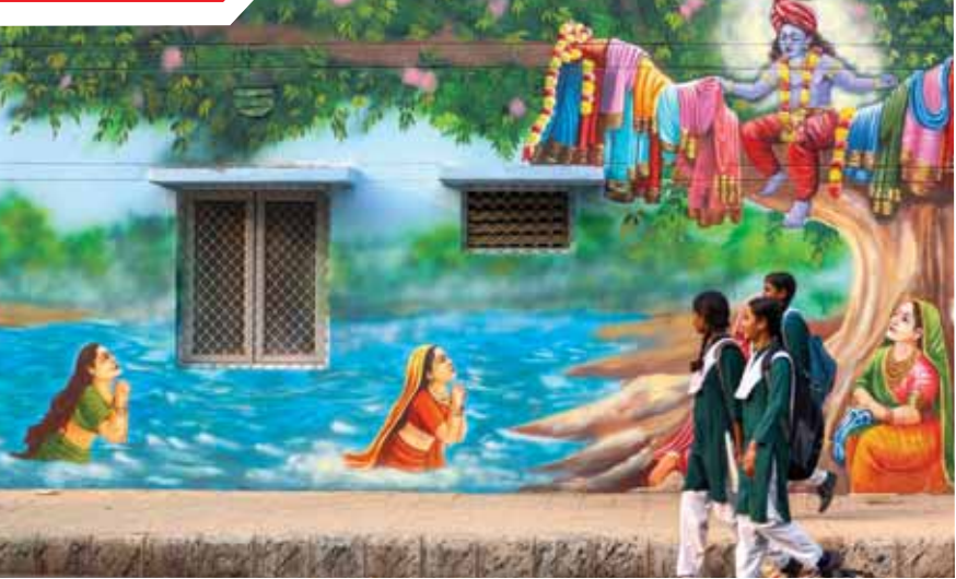
Students pass by a wall painting depicting a scene from 'Krishna Leela', in Prayagraj