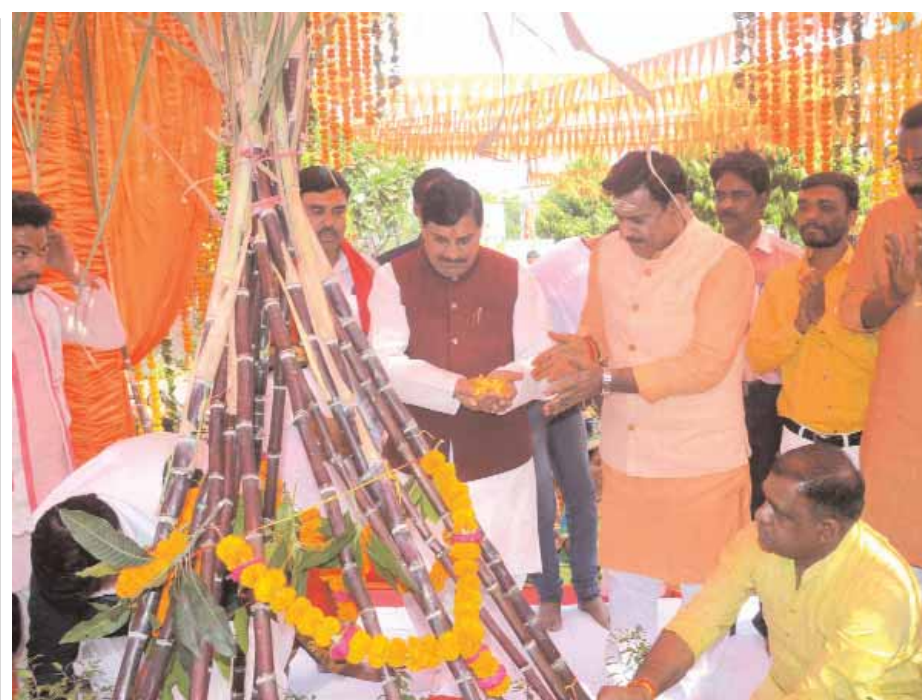
Madhya Pradesh Chief Minister Mohan Yadav and BJP MLA Rameshwar Sharma offer prayers on the occasion of Dev Uthani Ekadashi, at Yuva Sadan in Bhopal on Tuesday.

increased pension will not be paid for the period till 30 April 2023. A decision was also taken to take action regarding government servants who have filed writ petitions in the court and have been successful in view of the government's decision. The Cabinet decided to transfer the newly constructed building located in Indore by Madhya Pradesh Finance Corporation to the Commercial Tax Department at a transfer price of Rs 150 crore. The Commercial Tax Department will be able to start using the building after getting possession of the building, completing the electrical adjustment, general repairs etc. and obtaining the building completion certificate from the Municipal Corporation Indore.