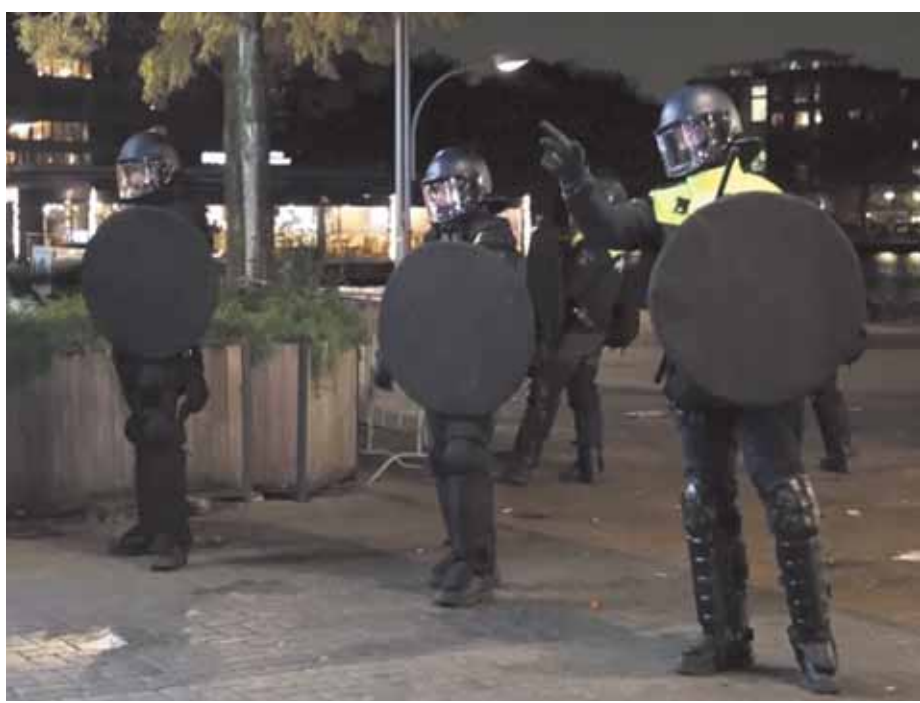
In this image taken from video, police officers patrol in riot gear on the streets of Amsterdam as the city is facing tensions following violence last week.

AP ■ THE HAGUE A senior police officer warned Tuesday of calls for more rioting in Amsterdam, after dozens of people armed with sticks and firecrackers set a tram on fire Monday night as the city faces tensions following violence last week targeting fans of an Israeli soccer club.