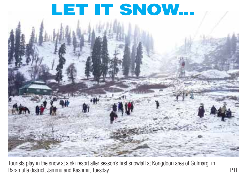
Tourists play in the snow at a ski resort after season's first snowfall at Kongdoori area of Gulmarg, in Baramulla district, Jammu and Kashmir, Tuesday

Retail inflation rose to 6.21 per cent in October from 5.49 per cent in the preceding month mainly due to higher food prices, breaching the Reserve Bank of India's (RBI's) upper tolerance level, according to official data released on Tuesday. The consumer price index-based inflation was 4.87 per cent in October 2023. The National Statistics Office data showed that inflation in the food basket rose to 10.87 per cent in October from 9.24 per cent in September and 6.61 per cent in the year-ago month. The RBI, which kept the key short-term lending rate unchanged earlier this month, has been tasked by the government to ensure inflation remains at 4 per cent with a margin of 2 per cent on either side.