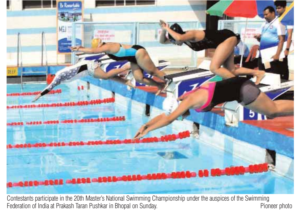
Contestants participate in the 20th Master's National Swimming Championship under the auspices of the Swimming Federation of India at Prakash Taran Pushkar in Bhopal on Sunday.