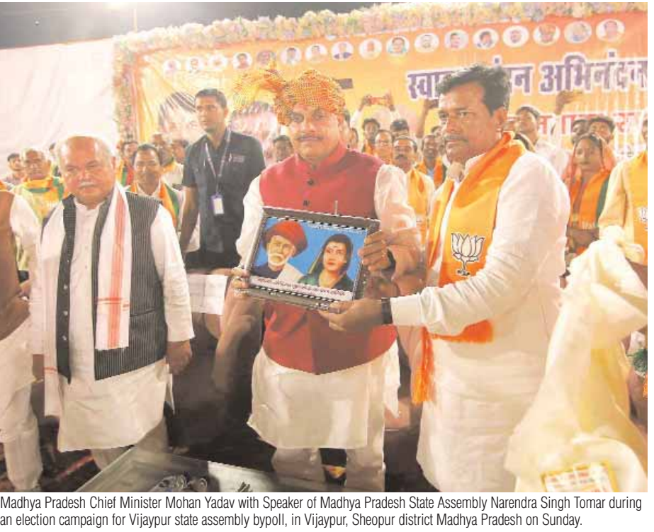
Madhya Pradesh Chief Minister Mohan Yadav with Speaker of Madhya Pradesh State Assembly Narendra Singh Tomar during an election campaign for Vijaypur state assembly bypoll, in Vijaypur, Sheopur district Madhya Pradesh on Sunday.

yielded very positive results. Of these, investment proposals worth Rs 2 lakh 76 thousand crore have been received in various sectors, which will create 3 lakh 28 thousand 670 employment opportunities. Chief Minister Yadav said that Madhya Pradesh will celebrate the year 2025 as the Year of Industry. This year, a two-day Global Investors Summit will be organized in Bhopal on 7-8 February 2025. Madhya Pradesh is becoming the first choice of investors The Chief Minister said that Madhya Pradesh is not only becoming an industrial hub but is also paving the way for progress in every field. Due to better connectivity, industry-friendly policies, and strong infrastructure in the state, Madhya Pradesh is becoming the first choice for investors.