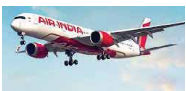
FSC Jet Airways that flew for 25 years before getting grounded in April 2019 due to financial turbulence is set to be liquidated. From November 12, the

service carrier to start operations in the last 10 years. Since the merger of full-service carrier (FSC) Indian Airlines with Air India in 2007, at least five FSCs dotted the Indian skies. As years passed by, Kingfisher and Air Sahara faded away while Vistara took flight in January 2015. Kingfisher went belly up in 2012 while Air Sahara, which was acquired by Jet Airways and renamed as JetLite, sank with Jet Airways in 2019.