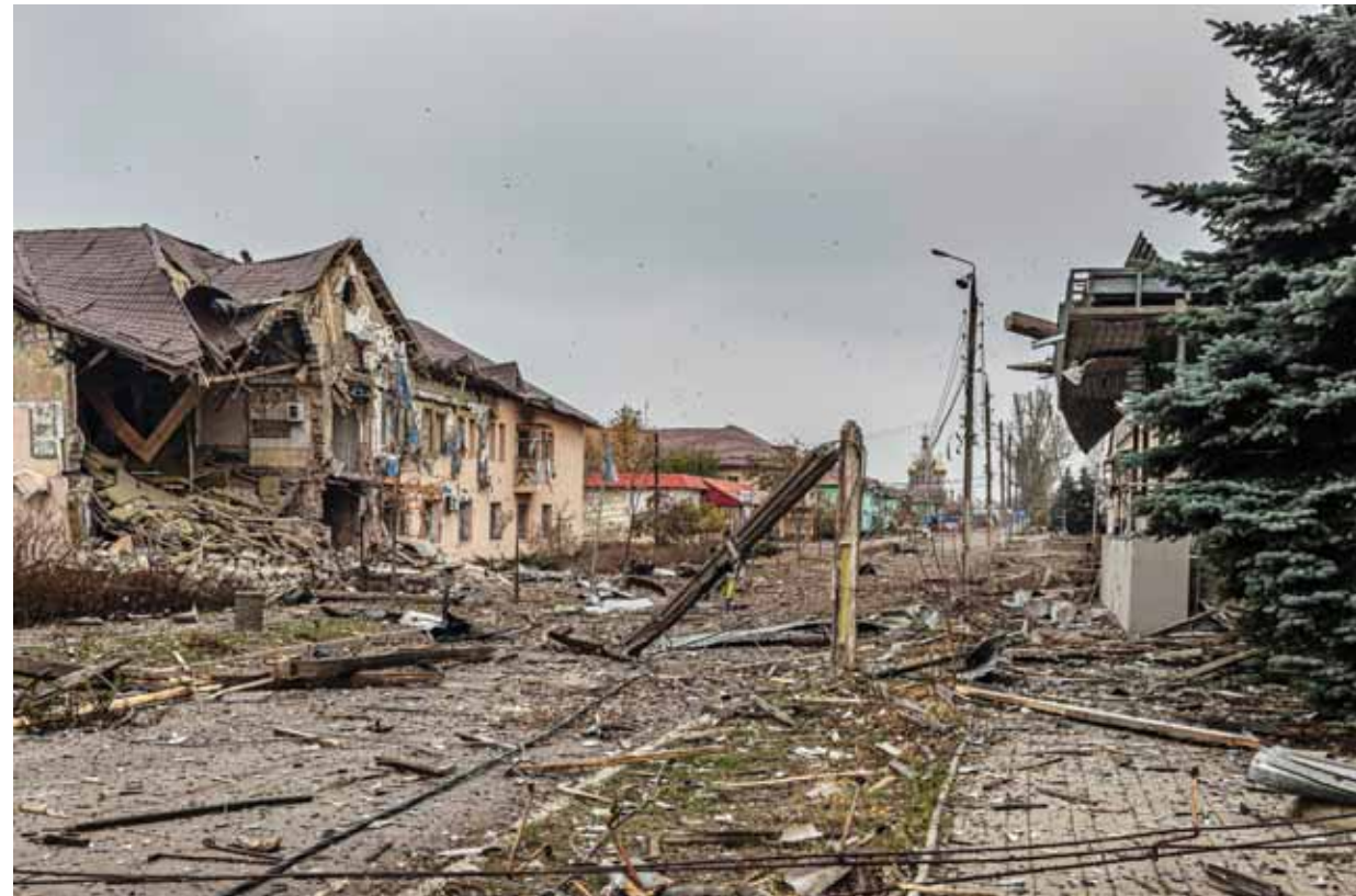
A central streets covered in debris from destroyed residential buildings after Russian bombing in Kurakhove, Donetsk region, Ukraine.

the basements, many are shocked by the state of the destroyed city, suggesting that they have been hiding underground for quite some time. After dressing the children in bulletproof vests and helmets, the White Angels take them to the nearby city of Kostyantynopil, from where other volunteers transport them to refugee registration points in the regional centers of Dnipro or Zaporizhzhia. "We evacuate people every day without stopping. We just dropped people off in Kostyantynopil, and we still have addresses to go through today," Shchus explains. Asked about adapting to work in such challenging and dangerous conditions, the police chief worries about the impact on his team. "I think everyone has already adapted. I wouldn't even call it adaptation. It's more like an unhealthy state of mind. I don't know how this will influence them socially in the future," he says. "These people are living in inhumane conditions, and they're surviving on adrenaline. The war is their life. These are hard conditions to work in, but everyone is working."