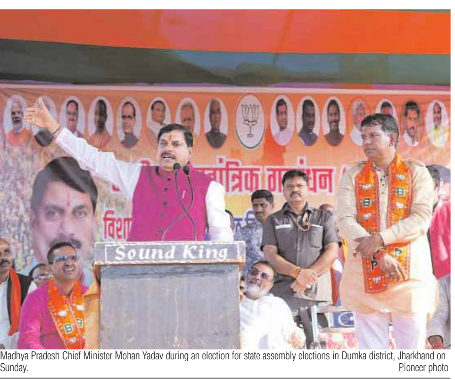
Madhya Pradesh Chief Minister Mohan Yadav during an election for state assembly elections in Dumka district, Jharkhand on Sunday.

state with mineral wealth and hardworking people would become the best state in the country. But unfortunately, a group of thieves came to power here, who wanted to loot your earnings. You kept earning with your hard work and they kept looting.