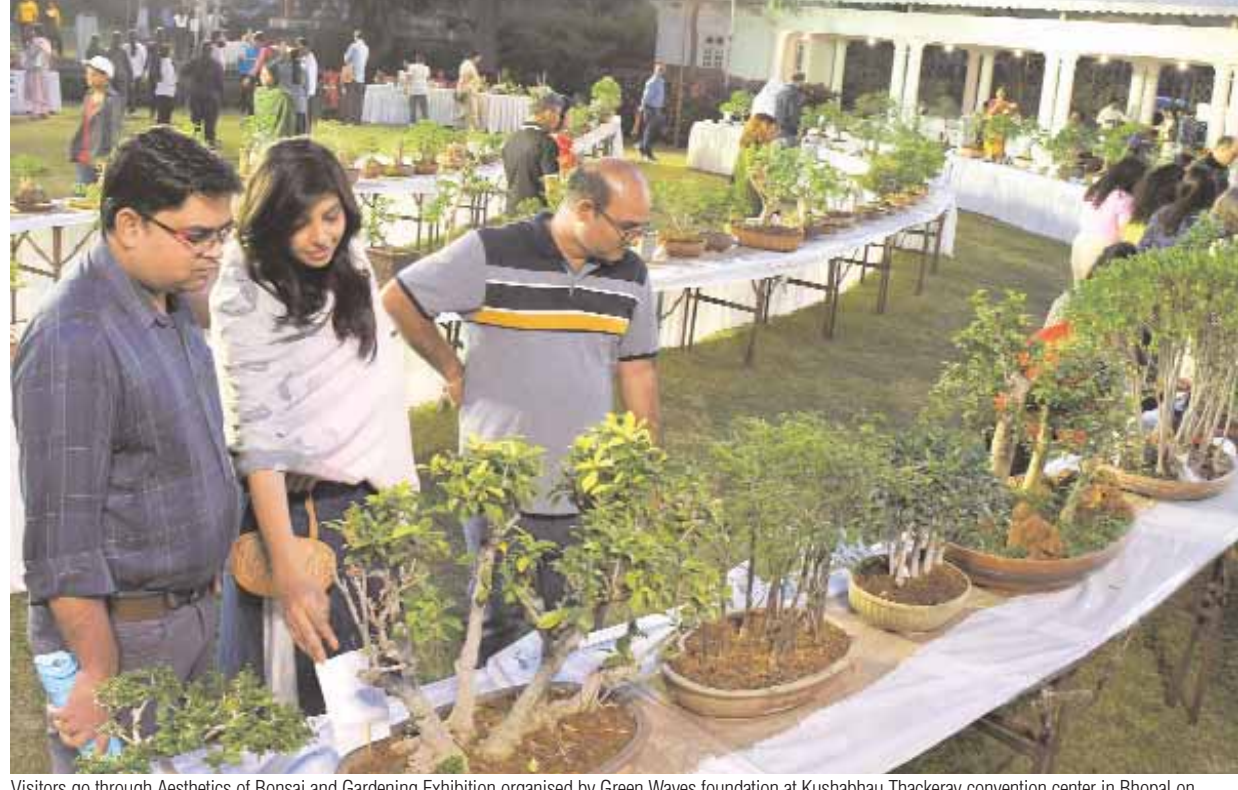
Visitors go through Aesthetics of Bonsai and Gardening Exhibition organised by Green Waves foundation at Kushabhau Thackeray convention center in Bhopal on Sunday.