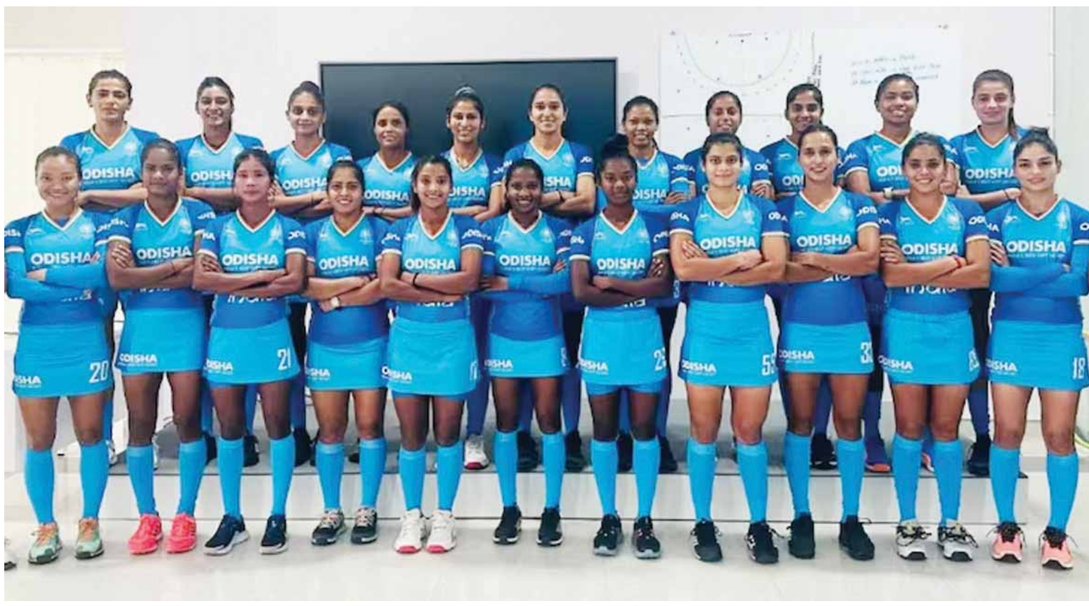
the ball you know you have said. the past, that is history for present and the present is Champions Trophy to defend which can get the entire