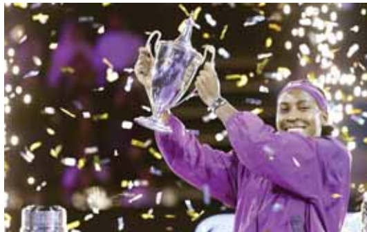
players - Aryna Sabalenka and Iga Swiatek - on her run to the final at the season-ending event in Riyadh. She felt vindicated after that and appeared to take a swipe at observers who wrote her off. "I just love to say I'm right. Specifically today, I got comments about how I was going to lose badly, so I was just like, 'OK, we'll see.'" Gauff explained. "It's honestly just

AP ■ RIYADH Coco Gauff won the WTA Finals for the first time by rallying to beat Olympic champion Zheng Qinwen 3-6, 6-4, 7-6 (2) in the final. The 20-year-old American came from 2-0 and 5-3 down in the final set and was two points from defeat at one stage. Yet she took the set to a tiebreaker and won the first six points. Zheng threatened a comeback but Gauff took the victory off her third match point with a forehand winner as she came into the net. She is the first American to win the Finals since Serena Williams in 2014, and received $4.8 million in prize money. She also is the youngest player to win it since Maria Sharapova in 2004, the year Gauff was born. Gauff beat the world's top two