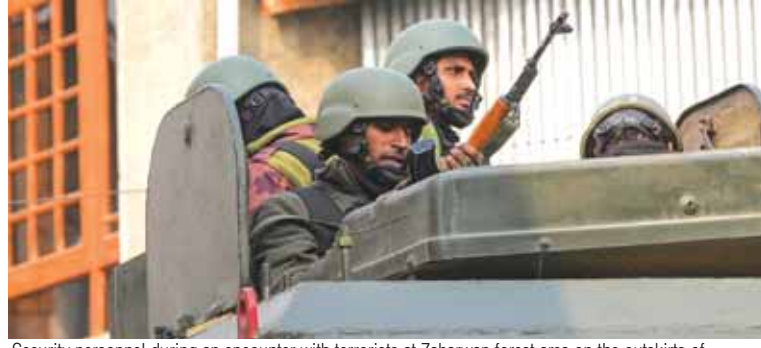
Security personnel during an encounter with terrorists at Zabarwan forest area on the outskirts of Srinagar, on Sunday