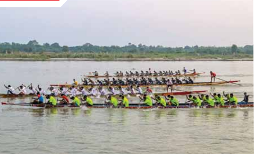
People take part in a boating competition, in Nadia