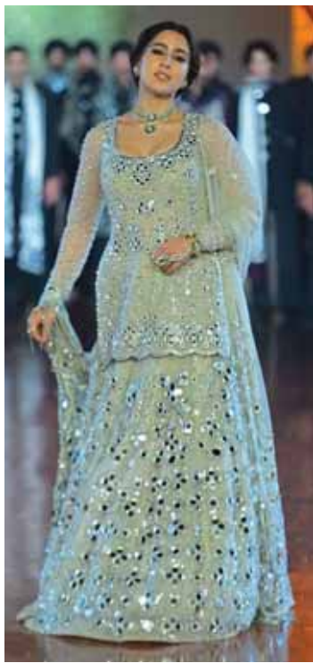
EACH ENSEMBLE WAS METICULOUSLY HANDCRAFTED, ADORNED WITH FLORAL MOTIFS, GEOMETRIC PATTERNS AND AN ARRAY OF EMBELLISHMENTS, INCLUDING PEARLS, SEQUINS AND HIS SIGNATURE MIRRORS. THE LUXURIOUS FABRICS, SILKS, SOFT WOOL, AND SHEER MATERIALS FLOWED BEAUTIFULLY, ENSURING THAT EVERY PIECE FELT ETHEREAL AND FESTIVE

segment was not only a visual delight but also a tribute to the artistry that often goes overlooked in modern fashion. Mishra's designs in 'Kalbeliya' captured the essence of the tribe, incorporating a palette of bold colours like black and ivory, paired with unexpected combinations found in traditional attire. Each ensemble was meticulously handcrafted, adorned with floral motifs, geometric patterns and an array of embellishments, including pearls, sequins and his signature mirrors. The luxurious fabrics, silks, soft wool, and sheer materials flowed beautifully, ensuring that every piece felt ethereal and festive. Silhouettes varied from traditional lehengas and anarkalis to contemporary kaftans, providing something for every wedding function. The blouses featured daring necklines and chic short kurtas, while the kaftans introduced a modern twist to the classic designs. This fusion of styles ensured that the collection appealed to a wide audience, from brides to modern women seeking elegance. In addition to bridal wear, Mishra's collection highlighted the versatility of mirror-work across both menswear and womenswear. The show reflected his commitment to reviving this ancient craft while seamlessly blending it with contemporary aesthetics.