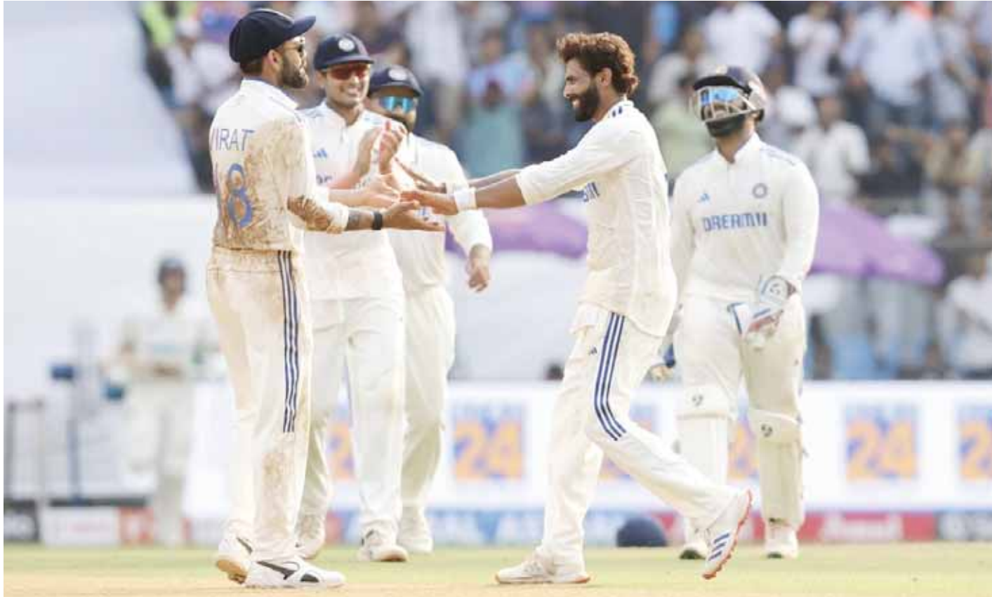
Tom Latham's (1) off and middle stumps in the first over. Earlier, India's progress suffered a severe blow with the exit of Pant towards the end of the morning session, as its effects were felt acutely when play resumed post lunch. From Pant's dismissal in the 38th over to India eventually folding in the 60th, the team managed eight fours and two sixes - the wicketkeeper-batter alone hit that many during his brisk half-century earlier. Patel, finding the right length, reaped rewards as the Kiwi spinner claimed another five-for at the Wankhede Stadium, following up his world record 10/119 in the first innings of the 2021 Test here.

Having made a subdued impact so far, Ashwin's delight on getting Rachin Ravindra (4) stumped was evident as he beat the charge of the batter with bounce and turn. With Glenn Phillips (26) using the long handle to a good effect, Ashwin cleaned up the New Zealand batter for another crucial breakthrough. Young, who batted as solid as he did in the first innings, was Ashwin's third victim giving the bowler catching practice after being outfoxed on a carrom ball. The 37-year-old Ashwin made impact beyond his bowling when he took an outstanding catch to end a stubborn 50-run association between Young and Daryl Mitchell (21), who, for a passage of play, threatened to take the game away. Young and Mitchell had steadied the ship after New Zealand's top-order was blown away, but the latter's charge against Jadeja proved costly as he did not get the distance in his stroke. From mid-off, Ashwin covered 19 metres running sideways to his left and put in a fabulous dive to complete the dismissal, post which New Zealand crumbled further. Tom Blundell (4) chopped one onto his stumps off Jadeja while Ashwin cleaned up Phillips, who had switched to aggressive batting knowing New Zealand desperately needed more runs. At the start of Kiwis' reply, Akash provided a rare sight of a pacer disturbing a batter's furniture on turning track when he dismantled