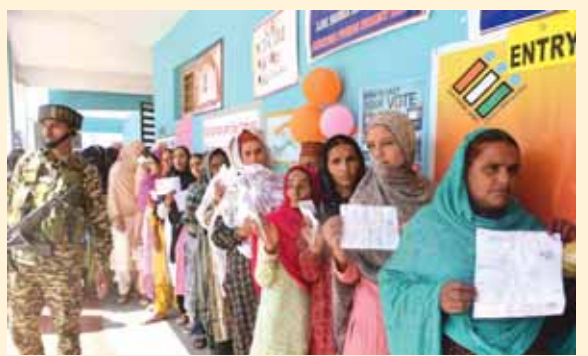
People wait in a queue to cast their votes at a polling booth during the sixth phase of Lok Sabha elections, in South Kashmir, on Saturday

With 'urban apathy' casting its shadow on the sixth phase of polling, the voter turnout stood at 60 per cent as of 8 pm on Saturday in 58 constituencies in six States and two Union Territories amid adverse weather.