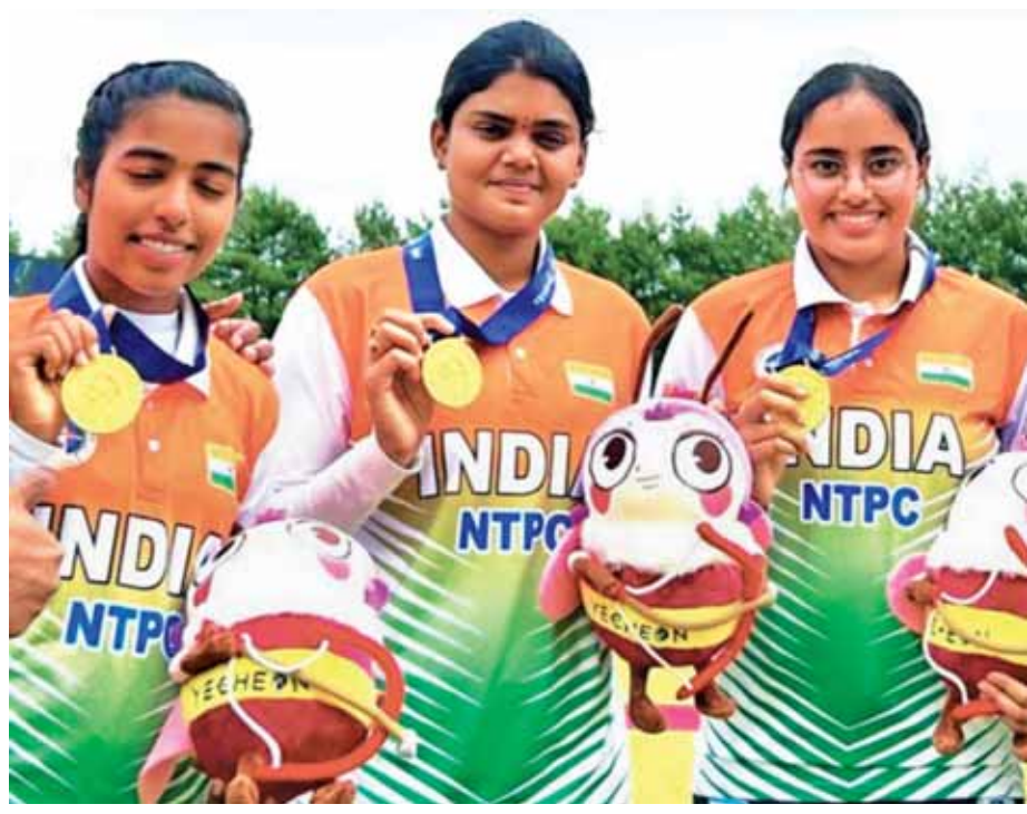
(L-R) Archers Aditi Swami, Jyothi Surekha Vennam and Parneet Kaur after winning women's compound team gold at Archery World Cup Stage 2, in Yecheon, South Korea, Saturday