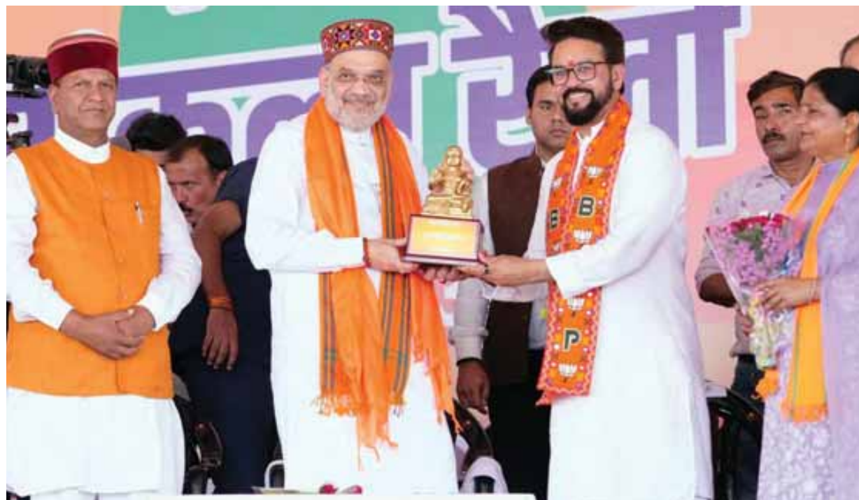
Union Home Minister Amit Shah addresses Vijay Sankalp Rally in support of BJP candidate from Hamirpur Lok Sabha Union Minister Anurag Thakur on Saturday. The elections are scheduled for final phase in Himachal Pradesh on June 1

The Election Commission had set up 2,338 polling stations for 18,36,576 voters, including 9,33,647 male, 9,02,902 female, and 27 third-gender voters. The voter list also includes 17,967 persons with disabilities and 540 individuals over the age of 100.