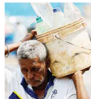
force "till satisfactory rainfall is received and the useful stock in the water bodies improves".

With the storage levels in the dams supplying drinking water to the country's commercial Capital having gone down markedly, the Brihanmumbai Municipal Corporation (BMC) on Saturday announced a five per cent water cut in the metropolis from May 30, 2024, followed by a 10 per cent cut from June 5. In its announcement, the BMC said that the water cut would remain in