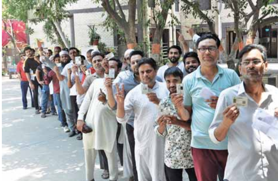
People wait in queues to cast their votes at a polling booth during the sixth phase of Lok Sabha election in New Delhi on Saturday

against Congress' Kanhaiya Kumar. Meanwhile, South Delhi's Mehrauli recorded the lowest turnout at 48.10 per cent. Rural assembly segments including Badli (57.83 per cent), Bawana (48.37 per cent), Mundka (52.17 per cent) and Najafgarh (59.10 per cent) saw average voting. Five assembly constituencies in North east Delhi recorded more than 60 per cent voter turnout including minority dominated assembly segments of Babarpur (62.05 per cent), Mustafabad (61.92 per cent), Gokalpur (60.98 per cent), Rohtas Nagar (60.62 per cent) and Ghonda (60.13 per cent). The lowest turnout was recorded at Burari (53.60 per cent) in the constituency. The Chandni Chowk Lok constituency, which comprises minority-dominated areas like Ballimaran (56.14 per cent), Matia Mahal (58.46 per cent), Shakur Basti (58.42 per cent), clocked the third lowest voter turnout at 53.27 per cent. The South Delhi constituency, which is seeing a fight between BJP's Ramvir Singh Bidhuri and AAP's Sahi Ram Pehalwan clocked the second lowest voting percentage at 52.83 per cent. Meanwhile, South Delhi's Mehrauli recorded the lowest turnout at 48.10 per cent. Rural assembly segments including Badli (57.83 per cent), Bawana (48.37 per cent), Mundka (52.17 per cent), Rohtas Nagar (60.62 per cent) and Ghonda (60.13 per cent). The lowest turnout was recorded at Burari (53.60 per cent) in the constituency.