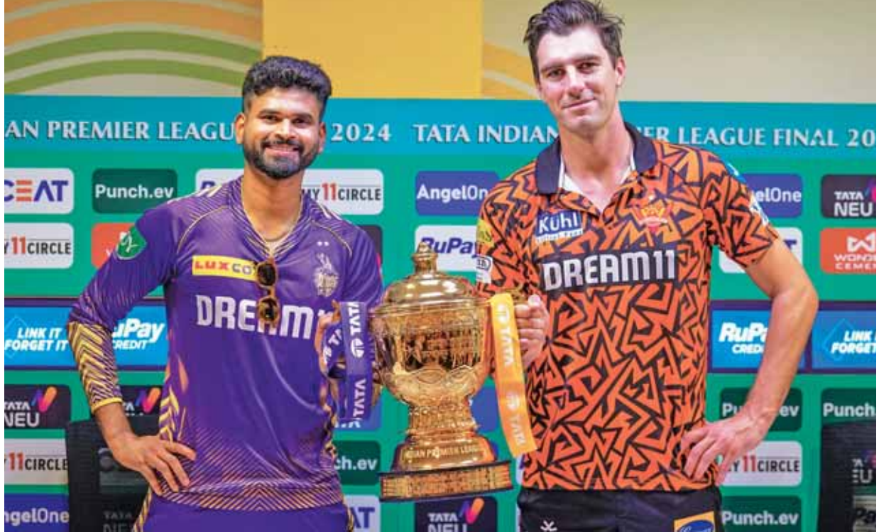
same team. Obviously a bigger perk in Indian head coach's assignment awaits Gambhir and a trophy would not only burnish his credentials but also raise the demand to have him in that Indian dressing. If one looks at man-to-man comparison, KKR tick more boxes in terms of overall match-winners with Sunil Narine, Andre Russell, Rinku Singh, the two Iyers — Shreyas and Venkatesh — the two Ranas — Nitish and Harshit — and spinner Varun Chakravarthy in their ranks. However, SRH's uncapped domestic stars like Abhishek Sharma, Nitish Reddy have done really well along with out-of-favour India internationals such as Bhubneshwar Kumar, T Natarajan and Jaydev Unadkat. SRH's 36-run win over Royals on a difficult track will certainly boost their confidence but they also must realise that the Chepauk wicket will be tailor made for Varun