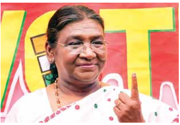
President Droupadi Murmu shows her finger marked with indelible ink after casting vote at Dr Rajendra Prasad Kendriya Vidyalaya, President's Estate, during the sixth phase of Lok Sabha elections, in New Delhi, on Saturday

With the beginning of 'Nautapa', a nine-day period of extreme heat from Saturday, Delhi on Saturday recorded a voter turnout of 54.27 per cent till 6 pm in the sixth phase of Lok Sabha election.