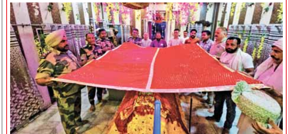
BSF personnel, along with villagers, offer 'chadar' at Baba Chamliyal shrine after the annual Indo-Pak fair organised on the two sides of the International Border (IB), in Samba district, on Thursday