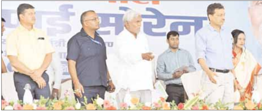
Chief Minister Champai Soren during the foundation stone laying ceremony of Gautam Medical College and Hospital at Ranchi Smart City Campus in Ranchi on Thursday.

field of health system. This initiative will definitely give a new direction to the development of the state. The CM said that in view of the health related requirements in Jharkhand, there is a need to open more and more medical colleges and hospitals. Even today, there are very few medical colleges and hospitals in this state as compared to the standard level of the country. In such a situation, the state government is continuously making efforts for new medical colleges and hospitals here. I am confident that in the coming days, many medical colleges and hospitals will open here on private or PPP mode,