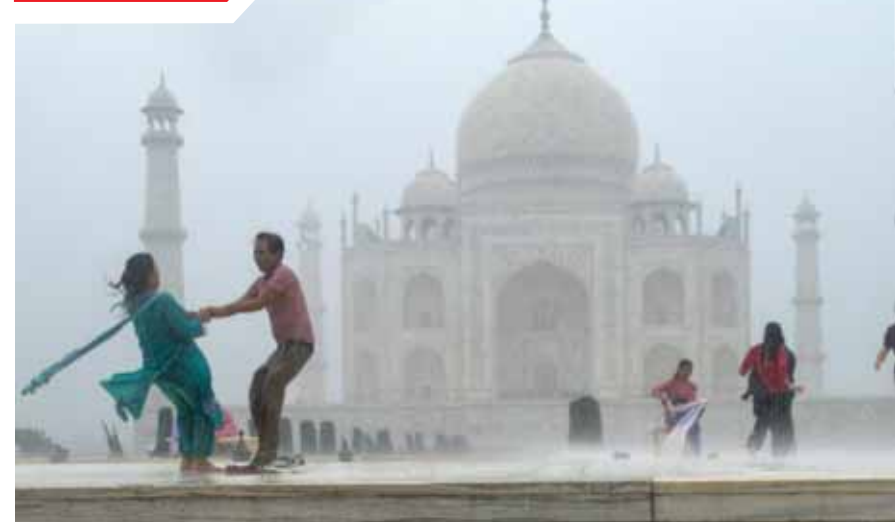
Tourists enjoy during rains, at the Taj Mahal, in Agra