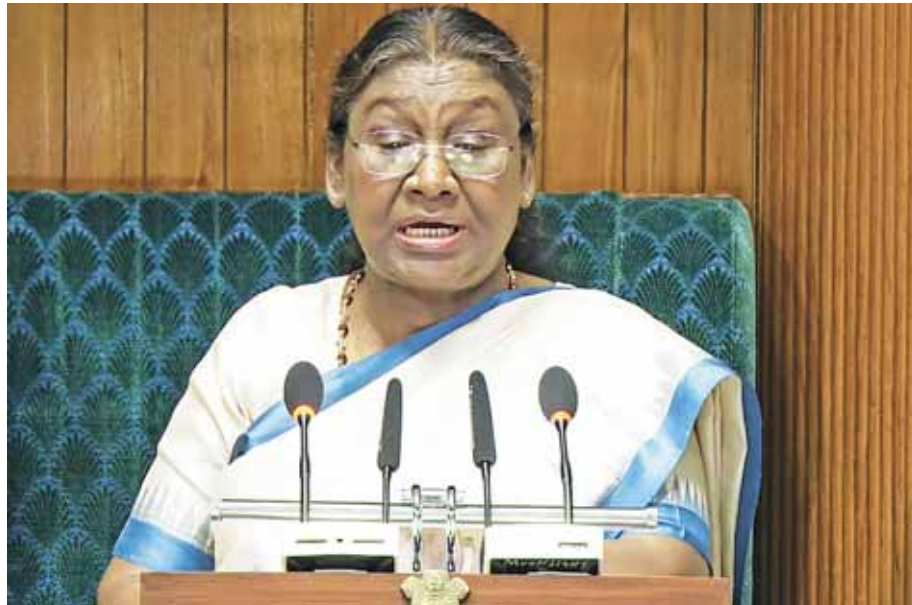
President Droupadi Murmu addresses the joint sitting of the Lok Sabha and Rajya Sabha, in New Delhi, on Thursday. The first session of the 18th Lok Sabha began on Monday and the 264th session of the Rajya Sabha will begin on June 27

Addressing the 18th Lok Sabha for the first time, Murmu said her Government was working to create an environment to enable youth of the country to dream big and realise their dreams. As she mentioned the steps taken by the Government on the education front, some Opposition members were heard shouting "NEET". Speaking about the recent general elections, Murmu said the whole world is talking about successful completion of India's Lok Sabha polls. "The world is witnessing that the people of India have elected a stable Government with clear majority for a third consecutive term," she told the joint sitting of the two Houses of Parliament. In her first address to a joint sitting of Lok Sabha and Rajya Sabha after Prime Minister Narendra Modi began his third term, Murmu described the poll result as an endorsement of his Government's policies while ruing attempts to weaken people's faith in electoral process including EVMs, an apparent swipe at Opposition parties. It is like cutting the very branch on which "we all are sitting", she said. A day after Modi and Lok