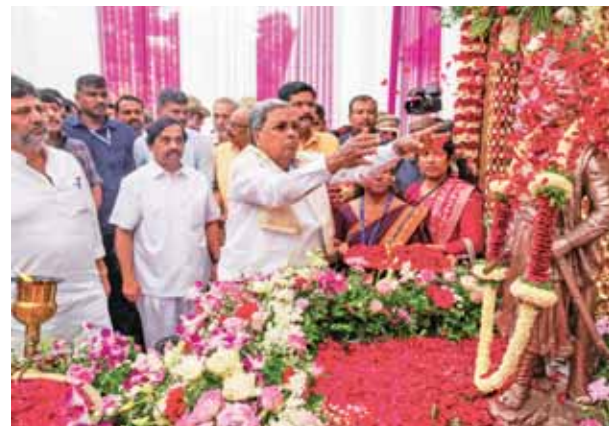
Karnataka Chief Minister Siddaramaiah pays floral tribute during the 515th birth anniversary celebration of Bengaluru's founder Nadaprabhu Kempegowda, at Kanteerava Stadium, in Bengaluru