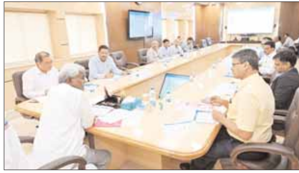
Chief Minister Champai Soren holds a review meeting with the senior officials at Project building in Ranchi on Thursday. PNS

PNS : RANCHI Chief Minister Champai Soren today conducted an in-depth review of the latest work progress of the Department of Drinking Water and Sanitation in the presence of officials in the Jharkhand Ministry. In the meeting, the CM directed the officials to complete all the small and big schemes taken under the Jal Jeevan Mission (Har Ghar Jal) Gramin within the stipulated time frame. The CM directed that all those houses where tap water has been supplied, review whether there is availability of water in the taps installed under the scheme or not. The CM said that it should be ensured that water reaches all the houses covered under Jal Jeevan Mission. He said that the Jal Jeevan Mission is an important scheme to provide tap water to every house. Our government is trying to solve the drinking water problem with full readiness. The CM directed the officials to complete all the water supply projects run by the government on time and pay special