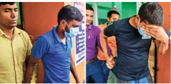
In this combo photo, men arrested in the NEET-UG paper leak case being taken to custody following their medical check-up at LNJP hospital, in Patna