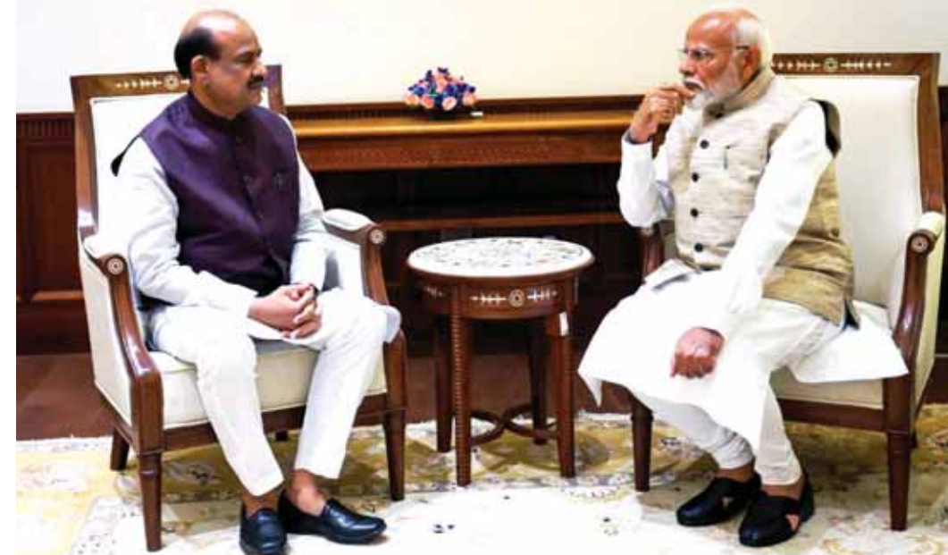
Prime Minister Narendra Modi with Speaker Om Birla during a meeting at the Parliament House in New Delhi

resolution condemning the imposition of Emergency and termed the decision by then prime minister Indira Gandhi an attack on the Constitution, triggering a wave of protests by the opposition in the House. Birla's reference to the Emergency, shortly after his election as Lok Sabha speaker, also saw a face-off between the government and the opposition in the first session of the lower house.