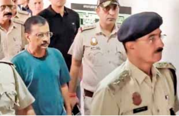
Delhi Chief Minister and AAP leader Arvind Kejriwal being produced before the Rouse Avenue Court in connection with a money laundering case related to the Delhi liquor policy, in New Delhi, on Wednesday