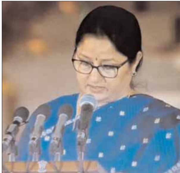
PNS : RANCHI

The BJP leaders celebrated the elevation of two leaders as ministers