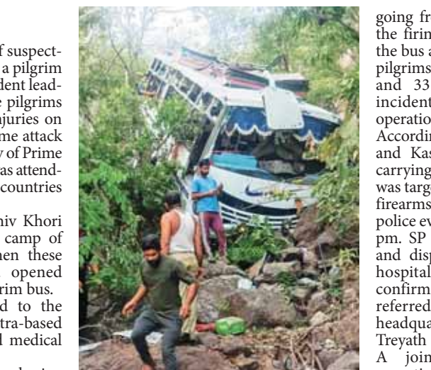
The damaged bus after it plunged into a gorge following an alleged attack by suspected terrorists, in Reasi district of Jammu and Kashmir

In a dastardly attack, a group of suspected Pakistani terrorists targeted a pilgrim bus which resulted in a fatal incident leading to the killing of at least nine pilgrims while 33 others also received injuries on Sunday at 6.10 pm. The gruesome attack coincided with the oath ceremony of Prime Minister Narendra Modi which was attended by heads of the neighbouring countries sans Pakistan. The bus was returning from Shiv Khori shrine towards the Katra base camp of Mata Vaishno Devi Shrine when these terrorists hiding in the area opened indiscriminate firing on the pilgrim bus. The injured have been rushed to the district hospital in Reasi and Katra-based Narayana hospital for advanced medical treatment. SSP Reasi Mohita Sharma while sharing details of the horrific incident told reporters, "Initial reports suggest that terrorists fired upon the passenger bus