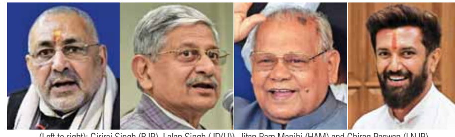
(Left to right): Giriraj Singh (BJP), Lalan Singh (JD(U)), Jitan Ram Manjhi (HAM) and Chirag Paswan (LNPJ)

Bihar got a better pie in the Modi.3 Council of Ministers when compared to Uttar Pradesh given the coalition dharma since the Nitish Kumar-led Janata Dal (U) and Chirag Paswan-led LJP have extended support to Narendra Modi with 12 and five Lok Sabha seats, respectively. Among the new faces included is Ram Nath Thakur. JD(U) leader and son of Bharat Ratna Karpoori Thakur. The moves sent a strong message to the EBCs in Bihar. For the States — Bihar and UP — caste