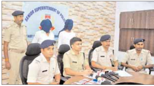
PNS : JAMSHEDPUR

As part of an ongoing anti-crime campaign, Jamshepur Police made a significant breakthrough by apprehending two individuals in possession of illegal firearms. The arrest took place near Moharda Basti, close to Nirmal Store, under the jurisdiction of Birs Nagar Police Station. The police operation, aimed at curbing the rising instances of crime in the city, resulted in the confiscation of two country-made pistols, four live bullets, three mobile phones, and a Hyundai i10 car. According to the authorities, the suspects were intercepted during a routine vehicle check. Their suspicious behavior prompted the officers to conduct a thorough search, which led to the discovery of the illicit items. The arrested individuals were immediately taken into custody and later transferred to