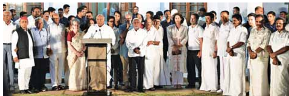
INDIA Bloc leaders in New Delhi.

sessions, leading to blockades within the complex. The Parliament Library building and the Annex are separated by a road that has a reception office and a row of barracks, housing security offices along a compound wall. The statue of Babasaheb Ambedkar is located inside the Parliament complex and thousands of visitors through the premises to pay tribute to him on his birth and death anniversaries. The Red Cross Road outside the Parliament premises will also become a part of the complex as there are plans to develop offices for Lok Sabha and Rajya Sabha members on the land which currently houses the International Red Cross Society. The row of barracks has been vacated and plans are also being made to demolish the compound wall separating the Parliament buildings from the Annex. These offices have been shifted to the North Utility Block of the new Parliament building.