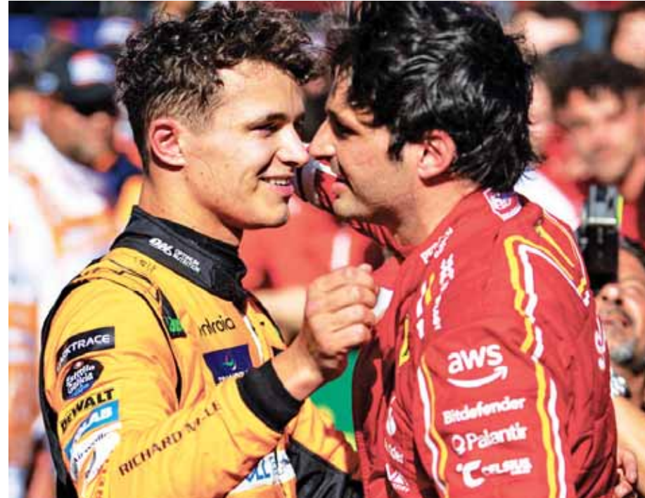
picture once we hit the track, the reality is we are so closely matched between those three teams." Verstappen has a 31-point lead over Leclerc in the drivers' championship. Norris trails Leclerc by 25 points, equal to one race win. But three drivers from three teams - Norris, Leclerc and Verstappen - have won the last three races for the first time since 2021. Last season, Verstappen won his second consecutive Canadian Grand Prix amid a run of a record 10 straight victories. "I'm not focused on what the others are doing because that's just a waste of time and energy," the 26-year-old Dutchman said. "We know that from our side, there are things that we can do better and that's what we'll focus on." While Ferrari appears to thrive on courses where curbing-riding is a big factor, the opposite has been true for Red Bull. Verstappen called Monaco, where he finished sixth and Red Bull teammate Sergio Perez did not finish, a reminder of that. "This is something that we know, and we haven't been able to fix it yet. I do think that after Monaco, it gave us another wake-up call," Verstappen said. "With everyone catching up, naturally, you can't rely on your advantage anymore even though your curbing-riding is bad.

Lando Norris is putting the Lpressure on Ferrari. The McLaren Formula 1 driver said the Canadian Grand Prix could be anyone's race Sunday, but he's giving the edge to the Italian team after Charles Leclerc's victory two weeks ago in Monaco. "I think they're favorites," Norris said Thursday. "It's impossible for me to say if it's going to be us, Ferrari or Red Bull on top. That's why it's exciting, because none of us really know." Led by three-time defending season champion Max Verstappen, Red Bull won 21 of 22 races last year. Verstappen had a record 19 victories. Red Bull tops the constructors' championship this season, but Leclerc's victory helped Ferrari move within 24 points. Norris thinks Ferrari could have the upper hand again this weekend, partially because curbing-riding is such a factor at recently resurfaced Circuit Gilles Villeneuve. Leclerc downplayed the favorite talk. "Everybody doesn't want to be going into a weekend hearing that they are favorites," Leclerc said. "You're never going to hear me (say) we are 100% the favorite this weekend and the same for them, so you've got to throw the ball to your closest opponents. "It might not be the true