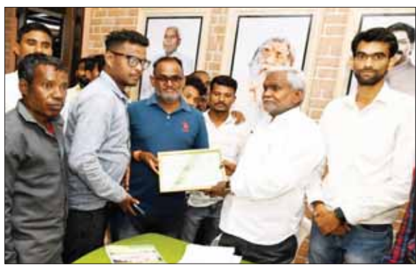
A delegation from Sarvajani Manasha Club Basudiha, Gamharlia Saraikela-Kharsawan met Chief Minister Champai Soren in Ranchi on Friday.