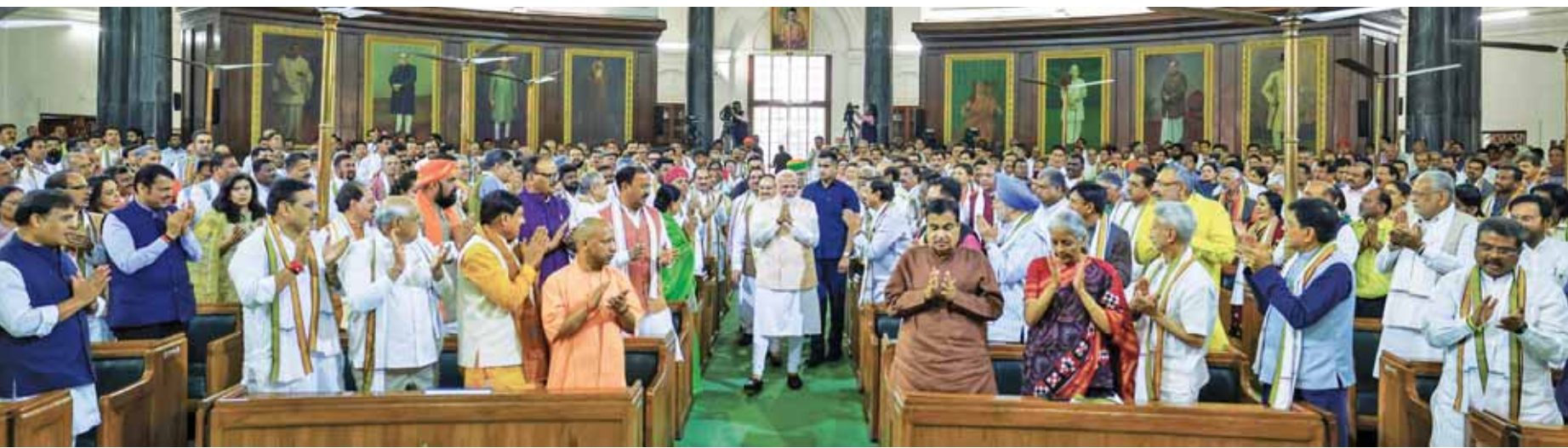
Prime Minister Narendra Modi arrives to attend the NDA Parliamentary Party meeting at Samvidhan Sadan, in New Delhi, on Friday

NEW INDIA, DEVELOPED INDIA, ASPIRATIONAL INDIA