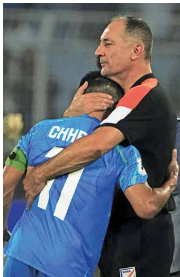
expected. The draw is realistic tonight, they opened the game much better and with more confidence — in terms of passing, speed of passing and moving," Stimac said.

Stimac was critical of Sahal Abdul Samad and Anirudh Thapa who failed to impress. "When you don't win the game and aren't happy with the result, how can you say that some players impressed you. You could see that we couldn't start dominating the game in the middle even if we started with Sahal and Thapa. I expected much more from them in the first half. "Sahal didn't play in the final stages. He was covering lots of ground, his defensive work was fantastic and he looked nice with Sunil. But I needed Sahal to be playmaker to dictate the game, create chances and also put in defensive work." Speaking about Thapa, Stimac said his performance was underwhelming considering that he is an experienced player. "Thapa has got enough experience to adapt to situations. I expect more from them as they have enough experience to do so," he added. The coach further gave his thumbs up to the fans for turning up in huge numbers to make Chhetri's last match extra special. "Huge appreciation for the fans, for their support." Chhetri stirred up emotions in his final outing but the Indian football team failed to convert the chances. "We are obviously disappointed with the result. The game was tough, as we