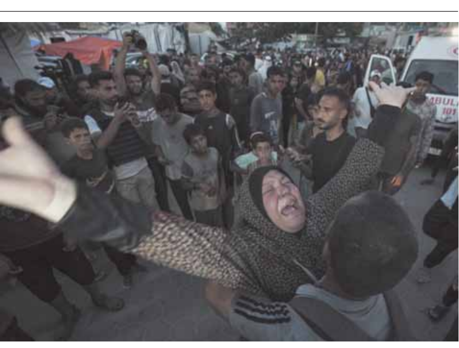
Palestinian woman mourns relatives killed in the Israeli bombardment of the Gaza Strip outside a hospital in Deir al Balah on

More than 35,000 people voted "uncommitted' in New Jersey