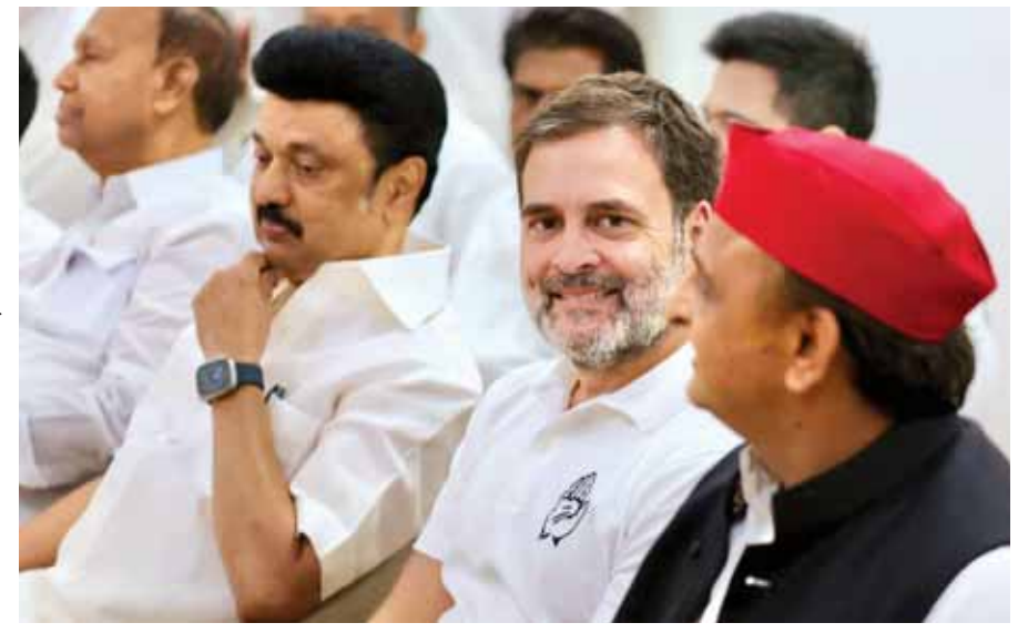
Congress leader Rahul Gandhi, Samajwadi Party leader Akhilesh Yadav, DMK supremo and Tamil Nadu Chief Minister MK Stalin amongst other INDIA Bloc partners at a meeting in New Delhi on Wednesday

Struggling for a tally to form a Government at the Centre by dislodging BJP-led NDA claims, the Congress led INDIA Bloc on Wednesday welcomed all parties that share a fundamental commitment to the values enshrined in the Preamble of Constitution towards formation of a government. Indicating "appropriate time", the INDIA Bloc in a statement said it will continue to fight against the fascist rule of the BJP-led by Narendra Modi. "We will take appropriate steps at the appropriate time to realise the people's desire not to be ruled by the BJP Govt. This is our decision that whatever promises we have made to the people, we will keep it up," Congress president Mallikarjun said Kharge while addressing the Opposition leaders who converged at his residence for the first meeting of the Bloc after its impressive gains in Lok Sabha that pulled down the ruling BJPs mark below the majority figure of 273 of the 543 members of Lok Sabha. 'The mandate is decisively against Modi, against him and the substance and style of his politics. It is a huge political loss for him personally apart from being a clear moral defeat as well. However, he is determined