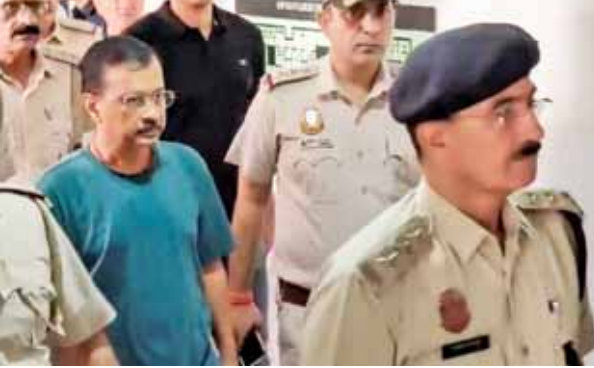
Delhi Chief Minister and AAP leader Arvind Kejriwal being produced before the Rouse Avenue Court in connection with a money laundering case related to the Delhi liquor policy, in New Delhi, on Wednesday