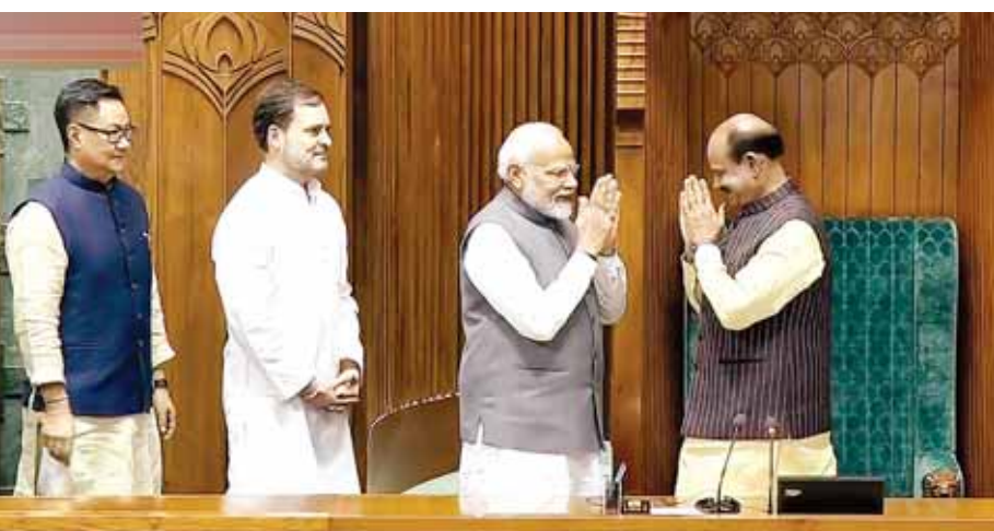
Prime Minister Narendra Modi greets Om Birla after the latter was elected as the Speaker of the House during the first Session of the 18th Lok Sabha, in New Delhi, on Wednesday. Leader of the Opposition Rahul Gandhi and Union Minister for Parliamentary Affairs Kiren Rijiju are also seen