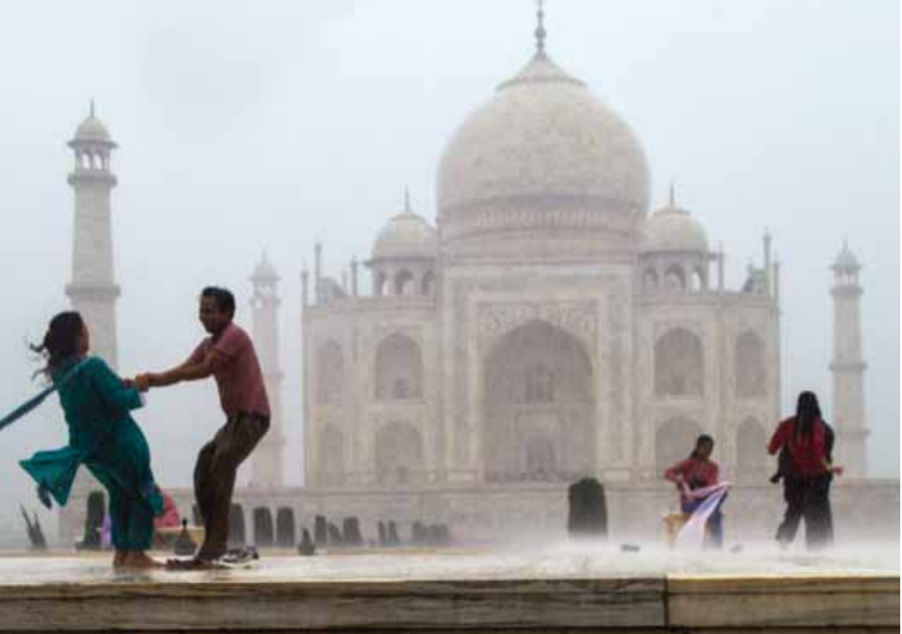
Tourists enjoy rain at the Taj Mahal in Agra