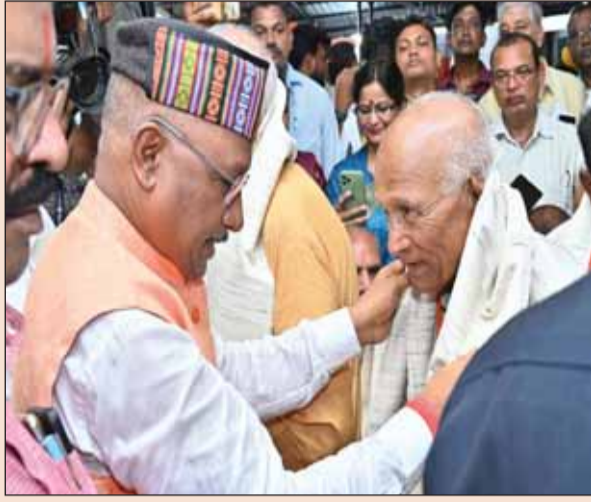
Opposition leaders were jailed and media censorship was imposed during that period, and in memory of those dark days June 25 is observed as black day, he said.