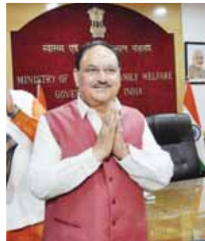
Union Health Minister JP Nadda

After that several names are doing the rounds which include the party's general