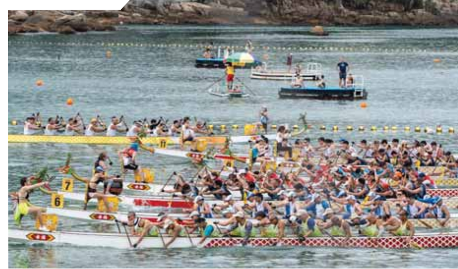
Competitors at the annual dragon boat race in Hong Kong