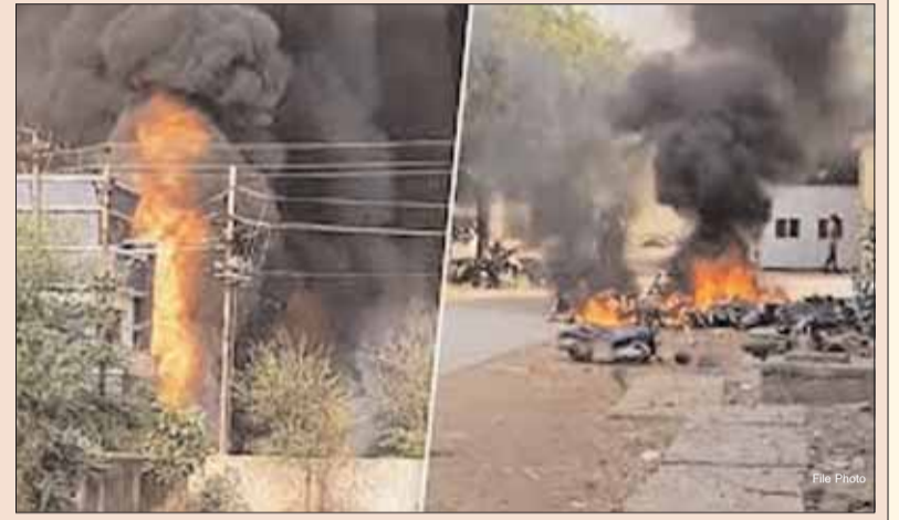
and vehicles during a protest called on by the Satnami community against the vandalism. More than two dozen cars, around 70 two-wheelers and a government building were torched at the district office on Monday.