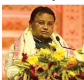
BHUBANESWAR/AMRAVATI