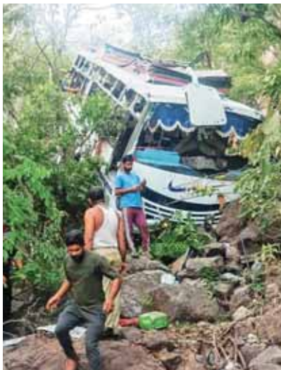
The damaged bus after it plunged into a gorge following an alleged attack by suspected terrorists, in Reasi district of Jammu and Kashmir.