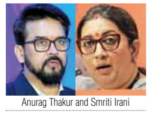
Anurag Thakur and Smriti Irani

Husbandry and Dairying in the Cabinet reshuffling of 2021, is likely to be dropped this time. During the election campaign, Rupala courted controversy by calling erstwhile 'maharajas' being subjects of the British and foreign rulers, angering the Kshatriya community. The omission of Union and Information Minister Anurag Thakur has surprised many as he was not among the leaders invited to meet Modi. The PM customarily