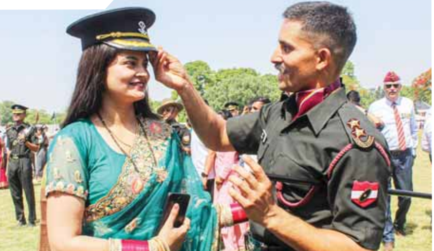
A newly inducted officer with his wife after the Passing Out Parade at the IMA, in Dehradun