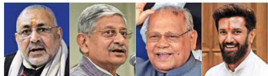
(Left to right): Giriraj Singh (BJP), Lalan Singh (JD(U)), Jitan Ram Manjhi (HAM) and Chirag Paswan (LNP)

combination and comfort of the allies have been kept in mind. The other five Bihar leaders who were inducted in the Council of Ministers included JD(U)'s Rajiv Ranjan Singh,