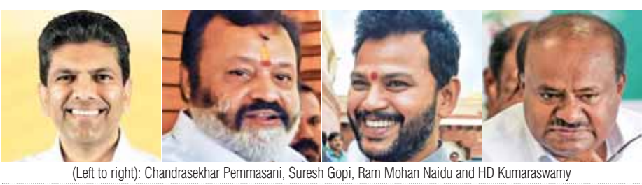
(Left to right): Chandrasekhar Pemmasani, Suresh Gopi, Ram Mohan Naidu and HD Kumaraswamy

Ram Mohan Naidu and Chandra Sekhar Pemmasani, JD(U)'s Lalan Singh and Ram Nath Thakur, Shiv Sena's Prataprao Jadhav besides other National Democratic Alliance members such as Chirag Paswan, Jitan Ram Manjhi, HD Kumaraswamy, Jayant Chaudhary, Ramdas Athawale, and Anupriya Patel are inducted in the Council of Ministers. BJP's G. Kishan Reddy, Sukanta Majumdar, Jiten Prasad, Rao Inderjit Singh, Nityanand Rai and Bhagirath Choudhary are also inducted in new Government. Seven former Chief Ministers are part of the new Council of Ministers. The other six former Chief Ministers are Shivraj Singh Chouhan (Madhya Pradesh), Rajnath Singh (Uttar Pradesh), Manohar Lal Khattar (Haryana), Sarbananda Sonowal (Assam), H. D. Kumaraswamy (once dubbed the "accidental Chief Minister" by Karnataka BJP, (Karnataka), and Jitan Ram Manjhi (Bihar). While five of these former Chief Ministers are from the BJP Kumaraswamy and Manjhi represent two of the BJP's allies — JD(S) and Hindustani Awam Morcha, respectively. Meanwhile one its constituent in the NDA coalition, Aitav Pawar-led NCP, turned down BJP's offer to accommodate Pratul Patel as a Minister of State with Independent charge said it was assured that "remedial measures" would be taken.