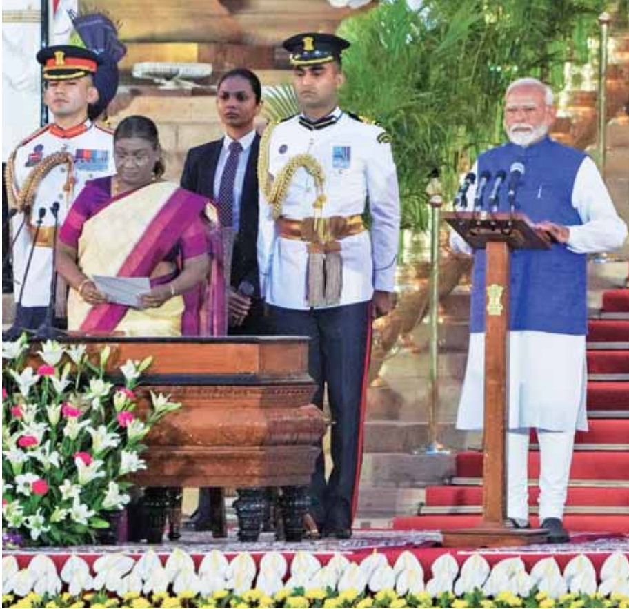
President Droupadi Murmu administers the oath of office to Narendra Modi as Prime Minister at Rashtrapati Bhavan in New Delhi on Sunday.

Scripting a history, Prime Minister Narendra Modi on Sunday took over as Prime Minister for a third consecutive term becoming the first non-Congress leader and second after first Prime Minister Jawaharlal Nehru to don the mantle. With this Modi also becomes the only leader in the country to hold a constitutional post back to back for more than two decades which includes — three terms as PM and prior serving 12 years as Chief Minister of Gujarat. President Draupadi Murmu administered Modi the oath of office and with this he also became the only PM to have been administered the oath by three presidents, including Pranab Mukherjee and Ramnath Kovind. Modi also under his regime was part of the consecration of Ram Temple in Ayodhya early this year and dedicated to the nation a new Parliament last year in September. If Modi completes his current five year term as PM leading the NDA regime he will have served a total of 27 years in office. He has been since leading his party to victory and power in 2002, 2007 and 2012 in Gujarat as CM and then in 2014 and 2019 at the Centre and again in 2024. It is though different this time as the BJP has lost majority on its own. Modi's third term which has