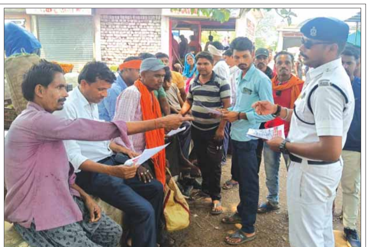
Using street plays, banners and pamphlets, the South East Central Railway personnel are educating people of Chhattisgarh about the safe way to use level crossing gates to prevent accidents.

The police recovered Rs 7.20 lakhs from them. A court sent them to prison.