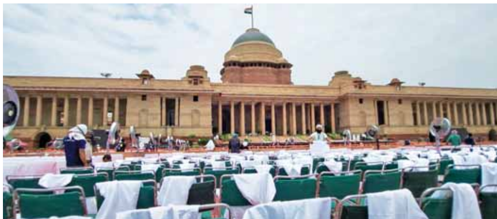
Preparations underway for the swearing-in-ceremony of the new Government, at the Rashtrapati Bhavan in New Delhi