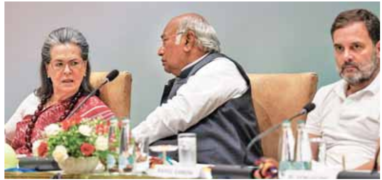
Congress President Mallikarjun Kharge with party leaders Sonia Gandhi and Rahul Gandhi during the extended Congress Working Committee meeting, in New Delhi

Bangladesh Prime Minister Sheikh Hasina arrived in New Delhi on Saturday afternoon to attend the swearing-in ceremony of Narendra Modi as Prime Minister on the evening of June 9. India on Friday formally announced that the leaders of seven countries from the neighbourhood and the Indian Ocean region will attend the ceremony. Sri Lankan President Ranil Wickremesinghe, his Maldivian counterpart Mohamed Muizzu, Bangladeshi Prime Minister Sheikh Hasina and Nepalese Prime Minister Pushpa Kamal Dahal "Prachanda" will attend the ceremony, according to the Ministry of External Affairs (MEA). Modi is expected to hold separate meetings with the visiting leaders, it was learnt.