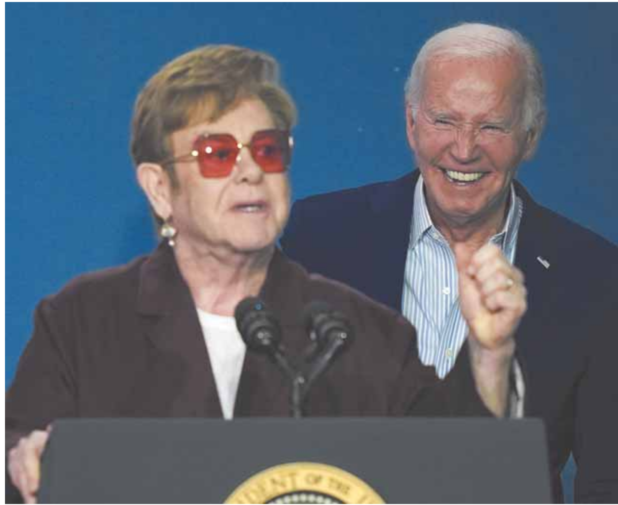
Elton John speaks as President Joe Biden listens at the grand opening ceremony for the Stonewall National Monument Visitor Center in New York.

The Chicago Tribune's editorial titled 'As America sank into the couch, Joe Biden and Donald Trump combined for a depressing farce. Enough' was the most uncharitable as it said, "By all means, defend the honour and service of the man. But to pretend he (Biden) is the party's best choice for four more years? For a party that loves to accuse Republicans of mendacity, it's pretty rich." "Biden, if we've not made that clear, should announce that he will be a single-term president who now has seen the light when it comes to his own capabilities in the face of the singular demands of being the president of the United States. He can do so with honour, but he is the only person who can do so. Certainly, his family can help. But, again, he is the only one," it asserted. The Wall Street Journal started by saying the Trump-Biden debate was "painful—for the United States." "President Biden's halting, stumbling debate performance Thursday night showed all too clearly that he isn't up to serving four more years in office. For the good of the country, more even than their party, Democrats have some hard thinking to do about whether they need to replace him at the top of their ticket," were its scathing remarks only to be added with a disclaimer: "This isn't a partisan thought; it's a patriotic one."