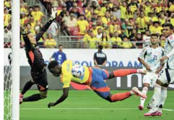
group stage. Colombia has won 10 straight and is unbeaten in 25 games (20-0-5) since losing at Argentina in a World Cup qualifier in 2022. Costa Rica did not have a shot on goal.

Davinson Sánchez and Jhon Córdoba scored three minutes apart in the second half, and Colombia advanced to the Copa America quarterfinals with a 3-0 win over Costa Rica. Colombia controlled possession (62%) for the second straight game and led 1-0 at halftime on Luis Díaz's penalty kick in the 31st minute. Los Cafeteros kept up the pressure in the second half and wrapped up Group D with a dominating performance in front of 27,386 pro-Colombian fans at State Farm Stadium. Colombia outshot Costa Rica 14-5 and faces Brazil on Tuesday in Santa Clara, California to close out the