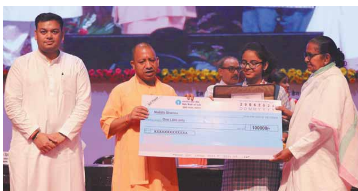
Chief Minister Yogi Adityanath handing over a cheque to a student at a programme organised in Lok Bhavan on Saturday

achieving high positions in the country, state, and district. He stated, "Through these programmes, we are honouring our talented students and presenting them as role models to the new generation, showing that if they also work hard, they will earn respect." Sharing his success mantra with the students, Chief Minister Yogi emphasised that no matter which field they choose in life, there is no substitute for hard work. He said, "A person who takes shortcuts in life can never reach the destination. Therefore, you should strive to work as hard as you can in life. The students who put in the effort made it to the merit list. Success confirms that we are on the right path and should remain focused and undeterred." Chief Minister Yogi stated that students from Uttar Pradesh Secondary Education, Uttar Pradesh Board of Secondary Sanskrit Education, Council for the Indian School Certificate Examination (CISCE), New Delhi, and the Central Board of Secondary Education (CBSE), New Delhi have been honoured here. He remarked, "A total of 170 students, including 112 girls and 58 boys have made it to the merit list of high school and intermediate. This success demonstrates that our daughters have made significant