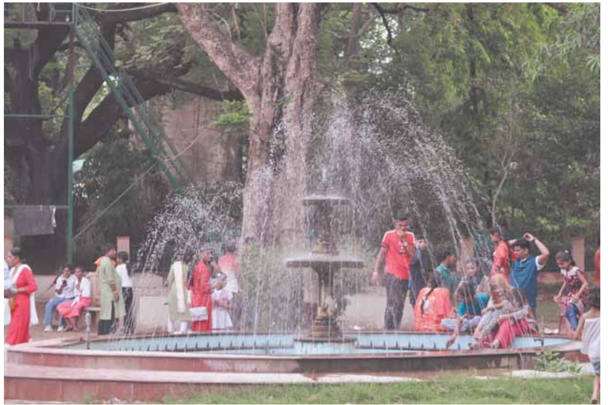
Visitors seem to be making the most of pleasant weather at Lucknow Zoo on Saturday