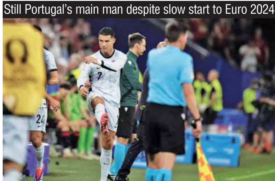
be asked heading into the knockout stage: will the constant drama surrounding Ronaldo wind up being a distraction for the Portugal team in its bid for another big soccer title, eight years after winning its only one at Euro 2016? Roberto Martinez clearly

Bruno Fernandes for Portugal's third goal in the 3-0 win over Turkey. A double-stopper that befuddled Abdulkemir Bardakci and left the Turkey center back on his back has proved a hit on social media and gave the world a reminder of the Ronaldo of 10, 15, even 20 years ago. Ronaldo, though, is 39 now. Those big moments have become fleeting, especially when it comes to the big tournaments and when he's playing against top-level defenses. Make that seven straight matches in which he has failed to score at a major tournament, covering the 2022 World Cup and Euro 2024. For the first time in his 21-year international career taking in five World Cups and six European Championships, he has ended a group stage without a goal. So, with the powers of this undoubtedly soccer great on the wane, the question will again