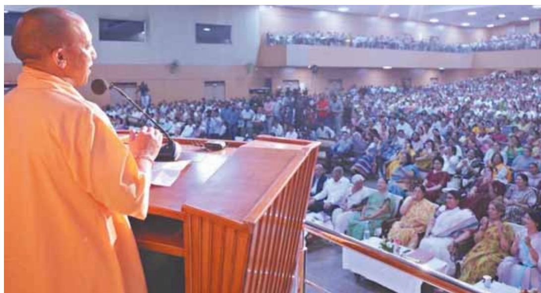
Chief Minister Yogi Adityanath addressing the gathering at CMS in Lucknow on Saturday

Urging teachers not to make classrooms boring and tense, Chief Minister Yogi Adityanath said that every child has unique capabilities. He stressed the importance of setting expectations that align with each student's potential and asserting that imposing unrealistic goals could be detrimental and inhumane. Yogi highlighted the transformative impact of teachers who tailor their approach to nurture each child's personality incrementally. He expressed confidence that with the right encouragement, no obstacle could deter a student who embraces forward momentum without fear of the future, underscoring the role of educators in fostering such resilience. The chief minister also said that while achieving careers like IAS or IPS was commendable, it was equally vital to cultivate patriotism and instill humanitarian values in every child. Speaking at a felicitation ceremony for teachers at CMS, Yogi addressed the prevalent challenges in education, emphasising the need for proactive solutions. "What are the solutions to these problems? We must prepare ourselves to find them. Success isn't a matter of luck; it hinges on diligent effort. The harder one works, the greater the success and internal fulfillment," he said. Yogi urged teachers to innovate in