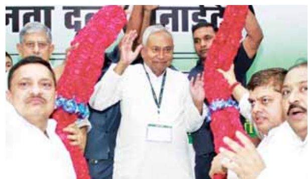
Bihar Chief Minister and JD(U) leader Nitish Kumar during the party's National Executive Meeting in Delhi on Saturday

The Janata Dal (U), a major partner in the NDA Government at the Centre, on Saturday urged the Central Government to consider either special category status or a special package for Bihar underlining the party's important role in the formation of the Prime Minister Narendra Modi-led Government. The party's national executive meeting held in the national Capital flagged price rise and unemployment as "burning issues", as its political resolution expressed the confidence that the National Democratic Alliance (NDA) Government would take more effective steps to handle them. In the meeting chaired by JD (U) president and Bihar Chief Minister Nitish Kumar, the party appointed Rajya Sabha MP Sanjay Kumar Jha as its working president since he enjoys good rapport with the BJP leadership and is considered to be very good at crisis management. Meanwhile, Congress took the opportunity to ask JD (U) to pass a Cabinet resolution for the special status in Bihar where it's in alliance with the BJP and simultaneously hoped that another major partner of NDA, TDP, too would gather courage to press demand for a special package. JD (U) was part of Congress-led INDIA Bloc before the Lok Sabha polls while TDP