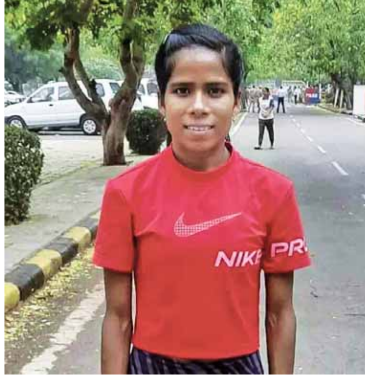
father used to work at a jute mill while her mother is a homemaker. She said she had to struggle a lot financially when she started her career. "Who does not struggle in India?"