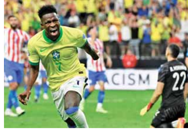
meeting, defeating Paraguay 4-0 two years ago in World Cup qualifying, and there was little doubt about the outcome of this match after two late goals broke it open in what was a contentious end to the first half. Moments after teammate Bruno Guimaraes hit the

Canarinho, who opened the tournament Tuesday with a scoreless draw against Costa Rica despite outshooting their opponent 18-2. With four points, Brazil is two behind group leader Colombia, which defeated Costa Rica 3-0 earlier Friday. A victory or tie by Brazil against Colombia on Tuesday ensures one of the group's two spots in the knockout stage. Brazil also has a six-goal differential advantage over Costa Rica, so a loss likely won't keep out the nine-time Copa America champions. Brazil has had its difficulties against Paraguay in Copa America play, having drawn in their previous five meetings. That tied for the second-longest unbeaten streak against Brazil in this tournament, which Paraguay also was part of from 1963-83. But Brazil won the most recent