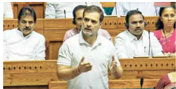
Leader of Opposition Rahul Gandhi speaks in the Lok Sabha during ongoing Parliament session in New Delhi on Friday

The NEET and NET row rocked Parliament on Friday with the Congress-led Opposition alleging their voice was being muzzled and the BJP-led ruling alliance NDA declaring that the government was ready for discussion as per tradition and by maintaining decorum.