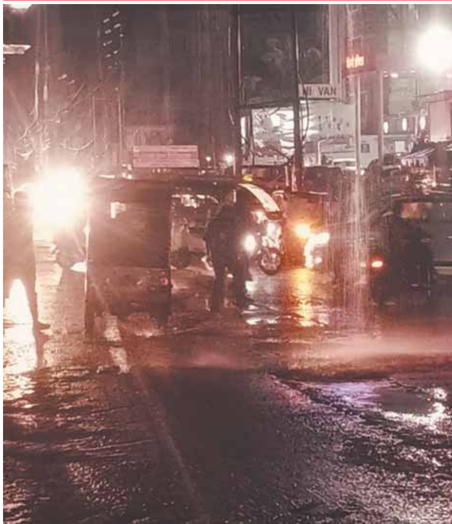
Pre-monsoon showers brought major relief from the hot and humid conditions in Lucknow late Friday evening. The state capital recorded the maximum temperature at 40.3 degree Celsius, which was 4.2 degrees above normal, while the minimum temperature settled at 29.2 degree Celsius. Generally cloudy sky with a few spells of rain and thundershowers is the forecast for Saturday