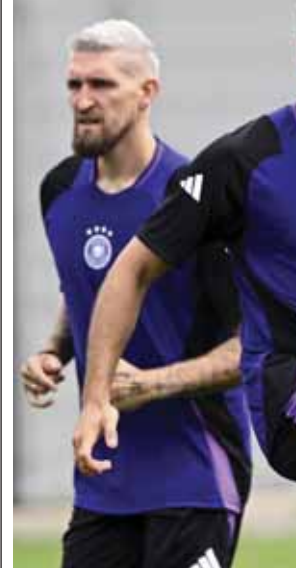
AP ■ DORTMUND (GERMANY)

Germany takes on Denmark in the Ground of 16 at Euro 2024 on Saturday. Germany will have to make changes in defense for the game as it tries to carry the host-nation buzz deeper into the knockout stages. Kickoff is at 9 p.M. Local (1900 GMT) in Dortmund. Here's what to know about the match: Match facts - This is the only game in the round of 16 that features two unbeaten teams. Germany finished top of Group A with wins over Scotland and Hungary and a draw with Switzerland. Denmark drew all of its games against Slovenia, England and Serbia. - Germany was eliminated by eventual runner-up England in the round of 16 at Euro 2020 and hasn't won a knockout