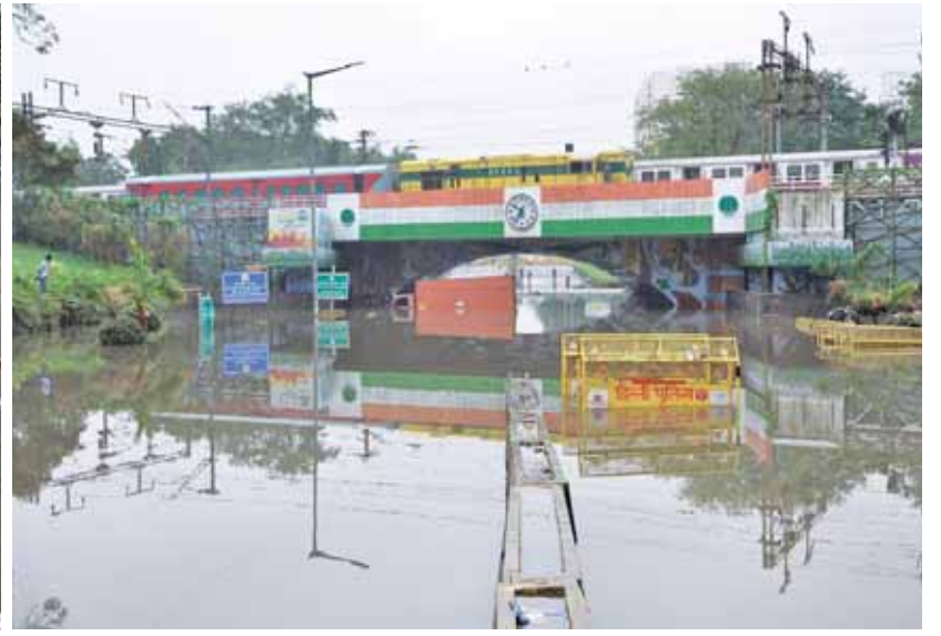
(Left to right): Parked vehicles are damaged by the collapse of a departure terminal canopy at New Delhi's Indira Gandhi International Airport following heavy pre-monsoon rains in New Delhi; Pragati Maidan tunnel underpass waterlogged and waterlogging at the Minto Bridge underpass on Friday