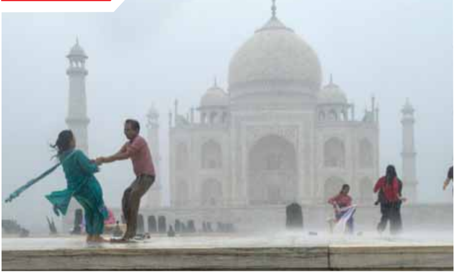
Tourists enjoy during rains, at the Taj Mahal, in Agra