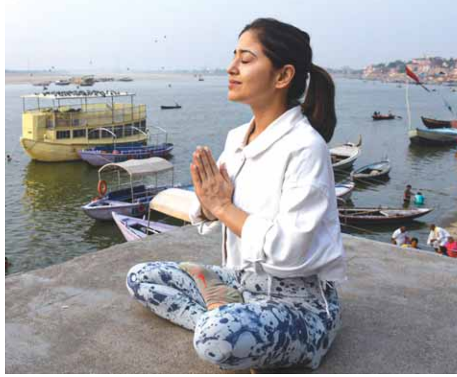
Actor Shweta Tripathi at the Ganga Ghat during the promotion of her upcoming series 'Mirzapur-Season 3' in Varanasi on Thursday.

LOVESICK COUPLE COMMITTED SUICIDE In another incident a love-sick couple committed suicide under the wheels of a train near Chhaunk village under Kalpi Kotwali police station area in Orai on Thursday morning. They were upset after their family members were not ready for their marriage. The youth had taken the girl to his village on Wednesday only where after