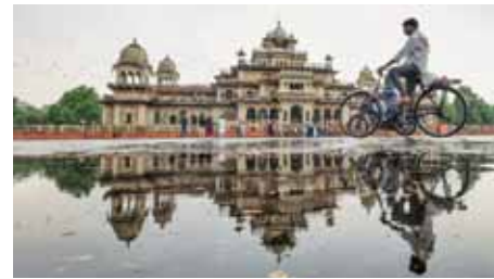
Albert Hall Museum is reflected in the puddle after rain in Jaipur.

Rainfall is likely to intensify over the plains of Northwest India with heavy to very heavy rain likely to lash various regions including the national capital, Punjab and parts of Rajasthan from between June 28 and June 30 June, according to the India Meteorological Department (IMD). This forecast comes as a welcome development promising relief from a rather long spell of intense heat that posed health risks to the people of all ages. The IMD announcement on Thursday said that heatwave conditions across the country have subsided. Regionwise, the MET has forecast, fairly widespread to widespread light to moderate rainfall accompanied with thunderstorm and lightning very likely over Konkan and Goa, Madhya Maharashtra, Karnataka, Kerala &