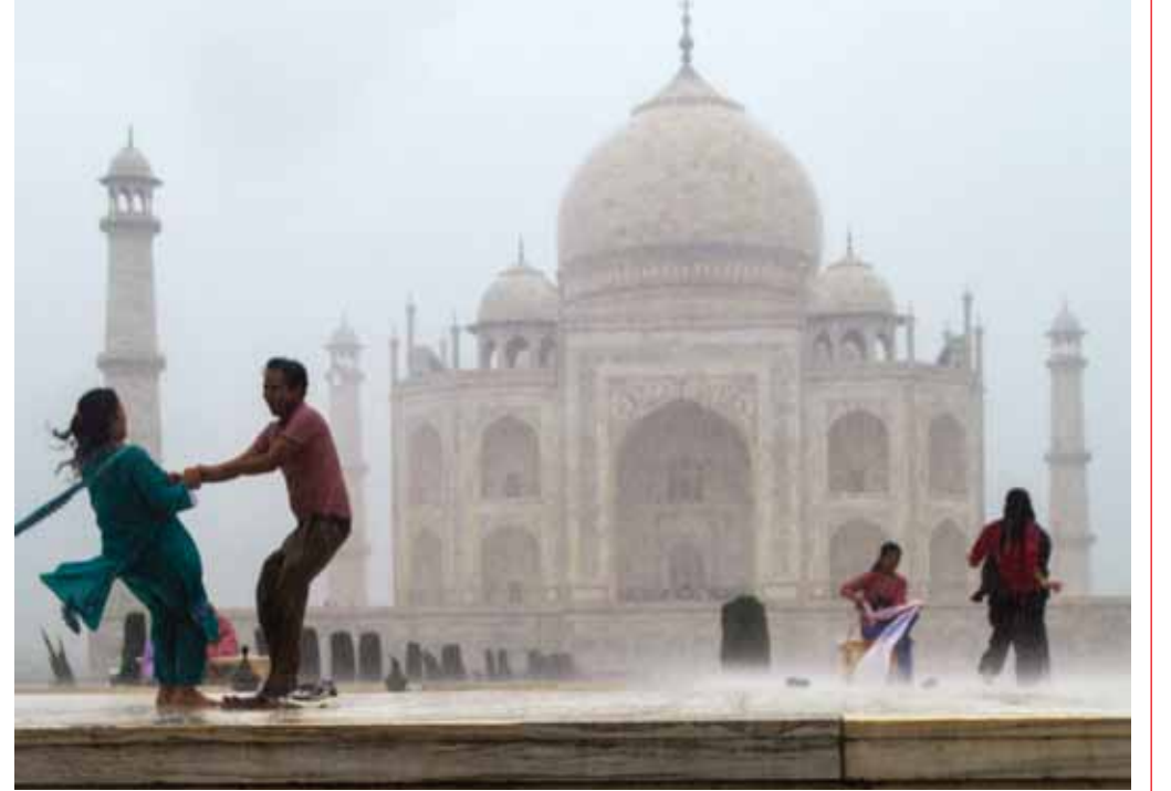
Tourists enjoy rain at the Taj Mahal in Agra