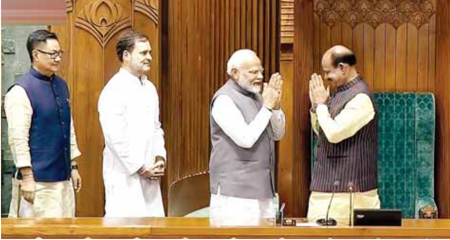
Prime Minister Narendra Modi greets Om Birla after the latter was elected as the Speaker of the House during the first Session of the 18th Lok Sabha, in New Delhi, on Wednesday. Leader of the Opposition Rahul Gandhi and Union Minister for Parliamentary Affairs Kiren Rijiju are also seen