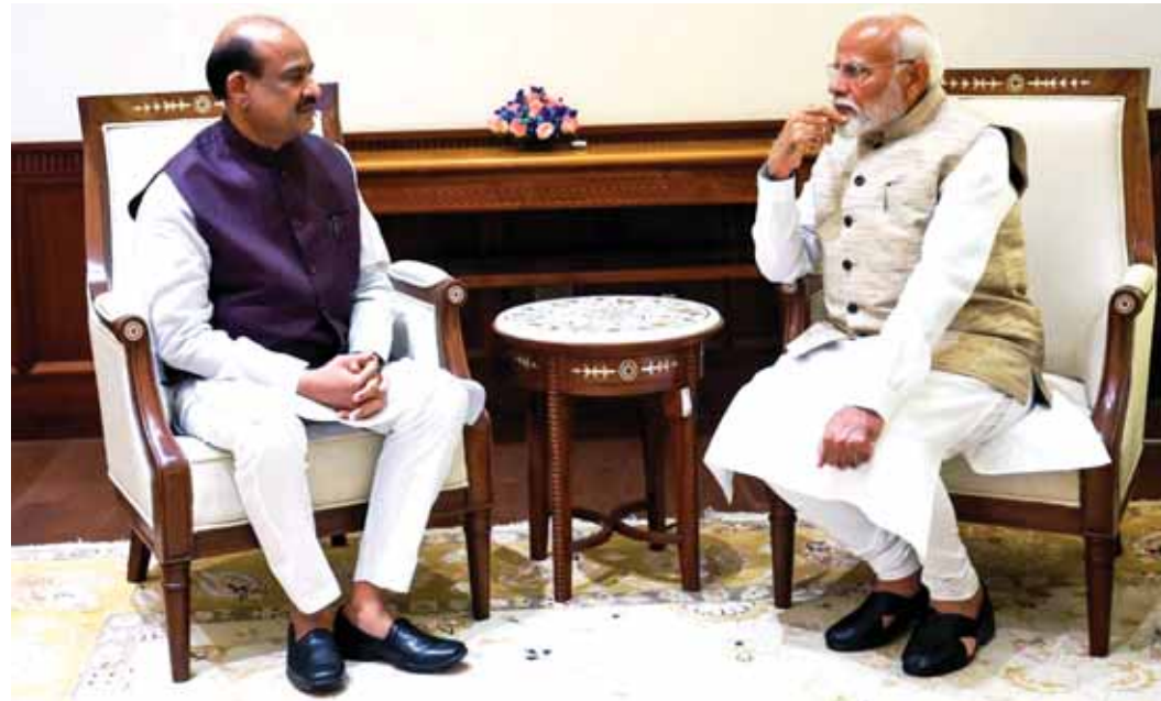
Prime Minister Narendra Modi with Speaker Om Birla during a meeting at the Parliament House in New Delhi

resolution condemning the imposition of Emergency and termed the decision by then prime minister Indira Gandhi an attack on the Constitution, triggering a wave of protests by the opposition in the House. Birla's reference to the Emergency, shortly after his election as Lok Sabha speaker, also saw a face-off between the government and the opposition in the first session of the lower house. "This House strongly condemns the decision to impose Emergency in 1975. We appreciate the determination of all those people who opposed the Emergency, fought and fulfilled the responsibility of protecting India's democracy," Birla said amid vociferous protests by opposition parties. Opposition MPs, including from the Congress, were on their feet, raising slogans against the reference to the Emergency. "June 25, 1975 will always be known as a black chapter in the history of India. On this day, then prime minister Indira Gandhi imposed Emergency in the country and attacked the Constitution made by Babasaheb Ambedkar," the speaker said. Birla said India was known all over the world as the mother of democracy. "Democratic values and debate have always been supported in India. Democratic values have always been protected, they have always been encouraged.