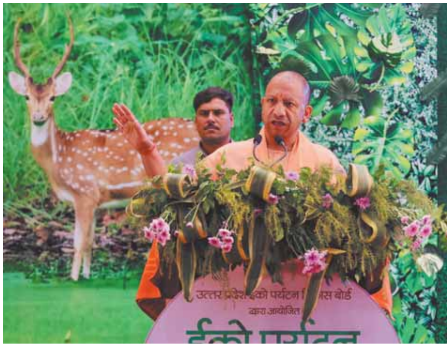
Chief Minister speaking at the 'Eco-Tourism-Samwad 2024', organised by the Tourism department at Indira Gandhi Pratishthan in Lucknow on Wednesday

Lucknow, Chitrakoot, Saharanpur, Buddhist sites like Kushinagar, Shravasti, Sarnath, and places associated with the Jain and Sufi circuits. "There are immense possibilities for spiritual tourism in the state, underscoring that UP is a land of human and animal creation, evident from Sonbhadra's Fossil Park, which has fossils over 150 crore years old," he said. Referring to the numerous ponds and wetlands in the state, he said that UP has a forest area of 15,000 square kilometres, with ancient forests still present. "When I visit the Terai region, I realise that the forests are protected here, while they have vanished in Nepal across the border," he added. Yogi stated that the Eco-Tourism Development Board was formed primarily to attract tourists to the various destinations with potential. He attributed the intense heatwave conditions to human greed and the exploitation of nature. Discussing the state government's efforts in restoring the Kukrail river, a tributary of the Gomti, he noted that encroachments had turned it