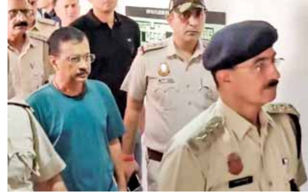
Delhi Chief Minister and AAP leader Arvind Kejriwal being produced before the Rouse Avenue Court in connection with a money laundering case related to the Delhi liquor policy, in New Delhi, on Wednesday