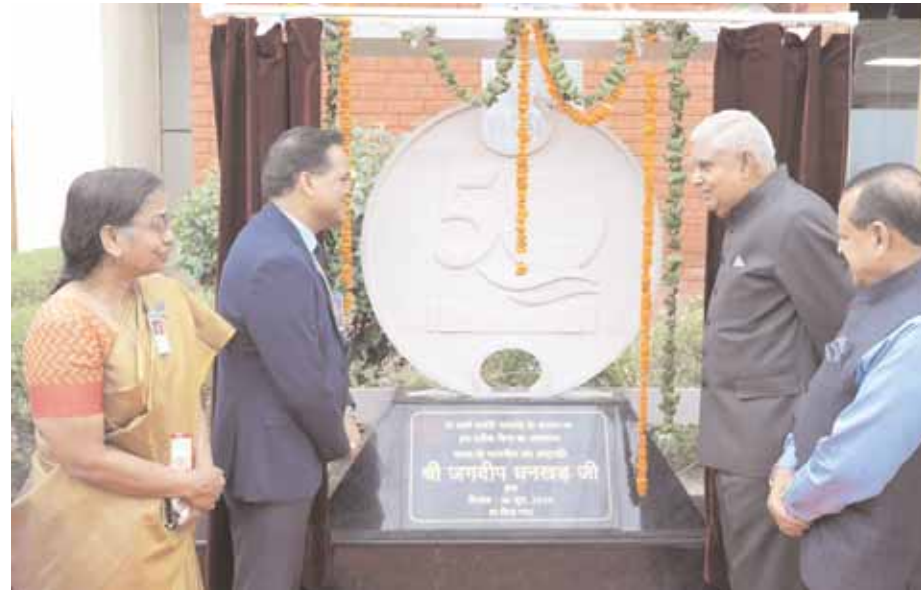
Vice-President Jagdeep Dhankhar unveiled the Golden Jubilee Logo of Central Electronics Limited and inaugurated the Multipurpose Hall 'Swarn Mandapam,' in Ghaziabad.

Remembering the Emergency imposed in the country in 1975, Vice President Jagdeep Dhankhar said on Wednesday that in any circumstances such a day will not be witnessed in the country now. Addressing the golden jubilee celebrations of Central Electronics Limited (CEL) in Ghaziabad district, Dhankhar said, "The country has never seen dense black clouds, which this day saw (in 1975). The biggest democracy of the world had gone in the dark in 1975. In any circumstances, India will not see such a day.