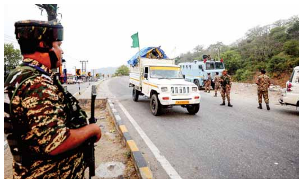
Security personnel guard as vehicles leave the Amarnath yatra base camp Bhagwati Nagar during a 'dry run' conducted by the authorities ahead of annual Amarnath Yatra, in Jammu, on Wednesday