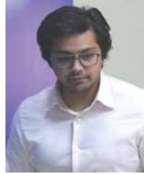
will remain Mayawati's only successor along with being the party's national coordinator," read a statement issued by the BSP after a meeting of nation-

office-bearers to review the 2024 Lok Sabha verdict here on June 23. Akash Anand, the 28-year-old future face of the BSP, faces a new challenger in Nagina MP Chandrashekhar Azad who is trying to make deeper inroads among the younger generation of Dalit voters and has been able to achieve success as evident from his election to Lok Sabha from Nagina in Bijnor district. In the recent Lok Sabha election, Chandrashekhar Azad won from Nagina, a reserved constituency in western Uttar Pradesh having a sizable Dalit electorate, by over 1,50,000