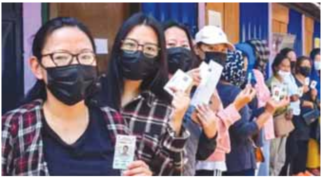
Voters exercise their franchise in the Nagaland civic polls

PTI ■ KOHIMA Around 80 per cent of the over 2.23 lakh electorate on Sunday exercised their franchise in the Nagaland civic polls, held after a gap of 20 years, a senior official said. Voting for 25 urban local bodies (ULBs) in 10 districts began at 7:30 am amid tight security and continued till 4 pm, he said. The turnout figure is likely to increase as voters were still in queue at