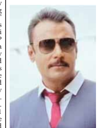
PTI ■ BENGALURU

Kannada film actor detained in murder case