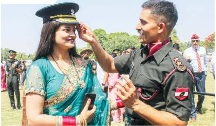
A newly inducted officer with his wife after the Passing Out Parade at the IMA, in Dehradun