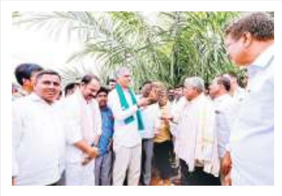
Former minister T Harish Rao interacting with farmers at Akkanepalle village in Siddipet district on Sunday

Harish Rao expressed frustration over the government's inaction, noting that despite the onset of the rainy season, there has been no significant response to the needs of farmers. He highlighted the farmers' growing concerns about seed shortages and the authenticity of the crop bonus schemes. According to Harish Rao, the Congress government is