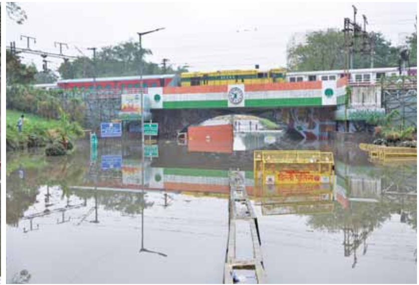
(Left to right): Parked vehicles are damaged by the collapse of a departure terminal canopy at New Delhi's Indira Gandhi International Airport following heavy pre-monsoon rains in New Delhi; Pragati Maidan tunnel underpass waterlogged and waterlogging at the Minto Bridge underpass on Friday