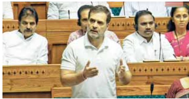
Leader of Opposition Rahul Gandhi speaks in the Lok Sabha during ongoing Parliament session in New Delhi on Friday

Both Dhankar and Speaker Om Birla and Parliamentary Affairs Minister Kiren Rijiju told Opposition members that they could discuss the matter during the course of the Motion of Thanks on the President's address but the