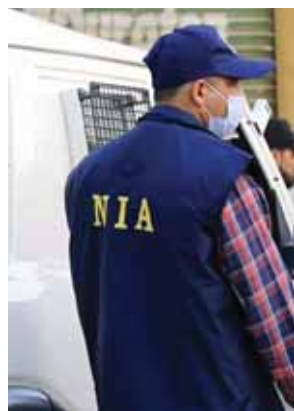
more charge sheets against

The National Investigation Agency (NIA) Friday conducted searches in Gujarat and Maharashtra on the premises of those suspected to have received money from Pakistan to spy on Indian defence establishments. The searches were conducted in a case registered by the NIA in June last year. The agency filed a charge sheet in July 2023 against two accused including an absconding Pakistani national. This was followed by two