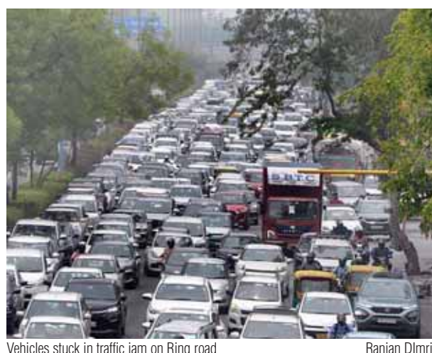
Vehicles stuck in traffic jam on Ring road Ranjan Dimri