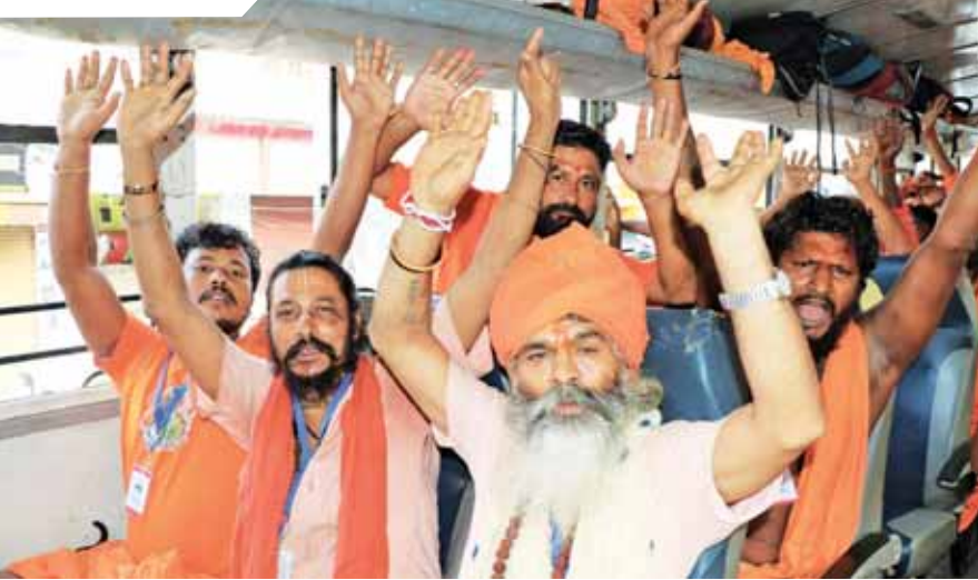
Sadhus shout slogans as the first batch of pilgrims leaves for the Amarnath Yatra, in Jammu