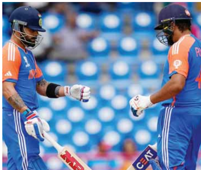
For Kohli, it will be the completion of a cycle with all three ICC white-ball trophies (2011 ODI World Cup, 2013 Champions Trophy) in

Zimbabwe series would certainly usher in a new dawn keeping in mind the 2026 T20 World Cup in India. To prepare for any global trophy, the core needs to be finalised two years in advance and in 2026, a 39-year-old Rohit or a nearly 38-year-old Kohli or even Jadeja are unlikely to fit in. At this point, with the focus firmly on the final, no one wants to use the sensitive 'R' word as far as T20Is are concerned but it is believed that if India can beat South Africa in Barbados on Saturday, both skipper Rohit and Kohli would know that in this format, they have nothing more left to achieve. There may or may not be a formal announcement as they would continue to be a part of IPL, where they are still two of the biggest brands apart from Mahendra Singh Dhoni and the non-cricketer -- Shah Rukh Khan.