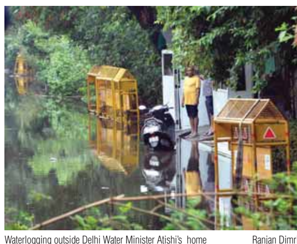
Waterlogging outside Delhi Water Minister Atishi's home Ranjan Dimri