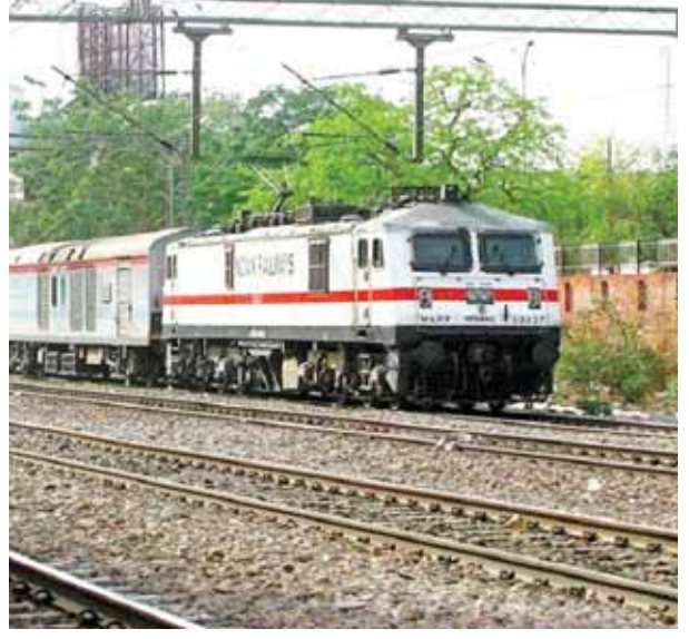
A train passing through a rural landscape in Chhattisgarh.

Chhattisgarh Chief Minister Vishnu Deo Sai on Friday said his government is committed to expediting the expansion of rail, road and telecom connectivity and other developmental work in the Maoist-hit areas of the state.