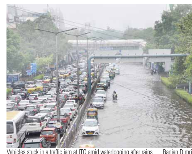
Vehicles stuck in a traffic jam at ITO amid waterlogging after rains Ranjan Dimri