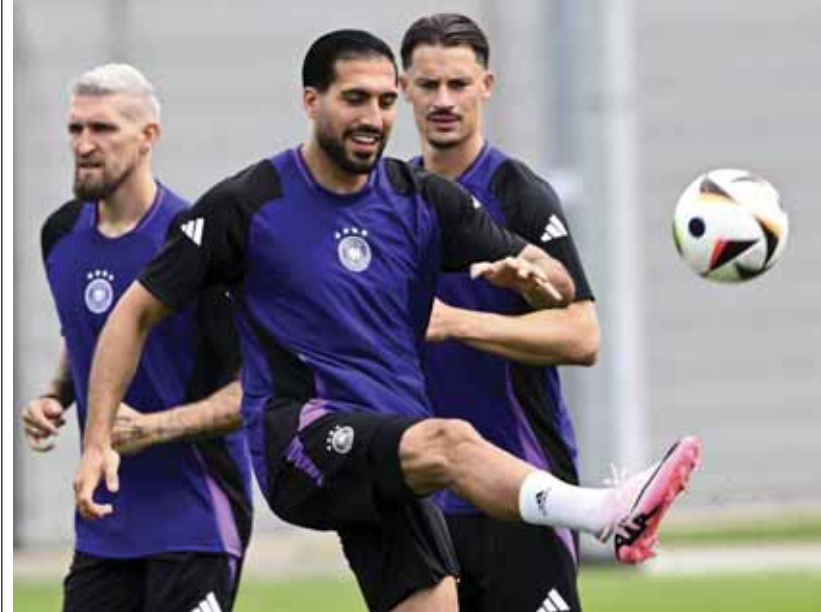
AP ■ DORTMUND (GERMANY)

Germany takes on Denmark in the Ground of 16 at Euro 2024 on Saturday. Germany will have to make changes in defense for the game as it tries to carry the host-nation buzz deeper into the knockout stages. Kickoff is at 9 p.m. Local (1900 GMT) in Dortmund. Here's what to know about the match: Match facts- This is the only game in the round of 16 that features two unbeaten teams. Germany finished top of Group A with wins over Scotland and Hungary and a draw with Switzerland. Denmark drew all of its games against Slovenia, England and Serbia. - Germany was eliminated by eventual runner-up England in the round of 16 at Euro 2020 and hasn't won a knockout