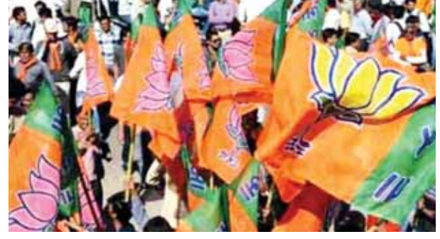
A group of people holding a banner during a protest in Karnataka.

Karnataka BJP on Thursday held a state-wide protest against the Congress government over alleged illegal money transfer scam involving a state-run corporation, and demanded Minister Siddaramaiah's resignation.