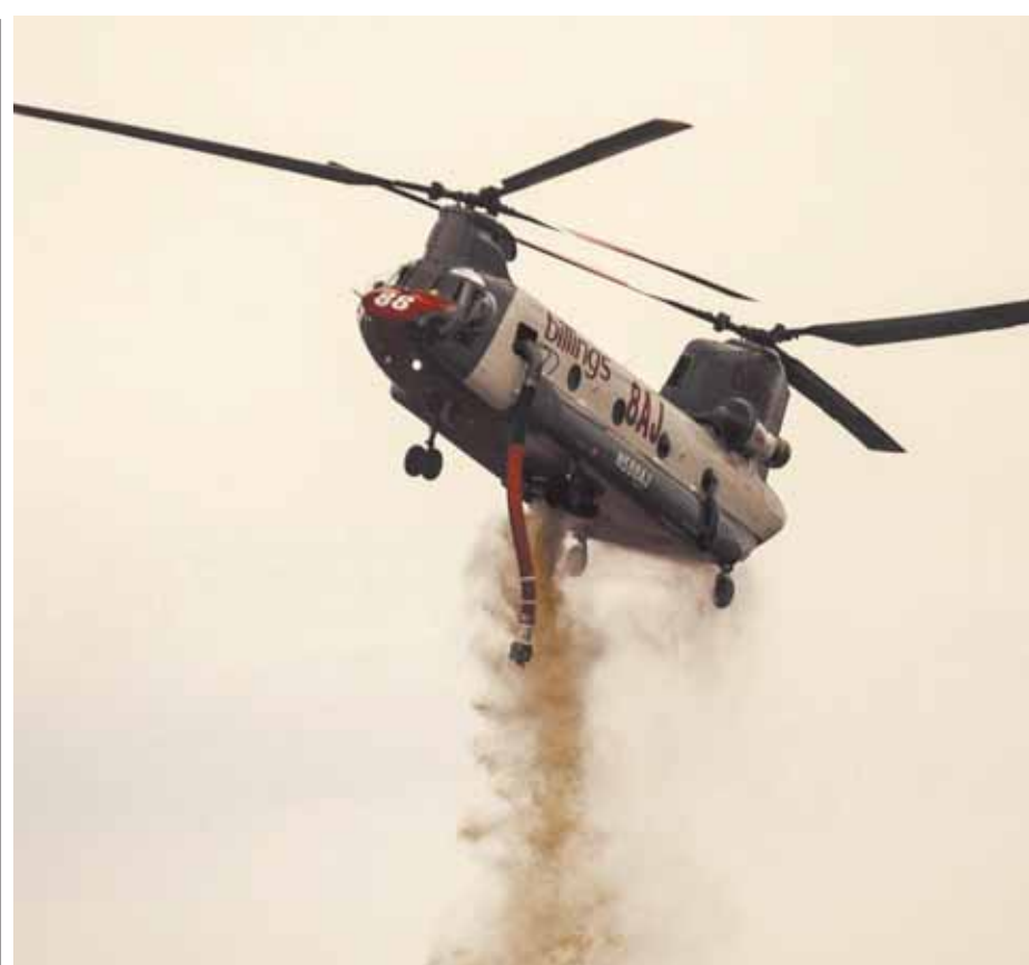
A helicopter drops water on the Apache Fire as it burns in Palermo, Calif., on Tuesday, Jun. 25, 2024. According to Cal Fire, more than a dozen new fires sparked by lightning

Brussels (AP): NATO appointed Mark Rutte as its next secretary-general on Wednesday, putting the outgoing Dutch prime minister in charge of the world's biggest security organisation at a critical time for European security as war rages in Ukraine. Rutte's appointment was sealed by NATO ambassadors during a meeting at the 32-nation alliance's headquarters in Brussels. US President Joe Biden and his counterparts will formally welcome him to their table at a summit in Washington on July 9-11. The outgoing Dutch premier will take over from the current secretary general, Norway's Jens Stoltenberg, on October 1. Stoltenberg spent more than a decade at the helm. His mandate was repeatedly extended, in part to provide continuity after Russia invaded Ukraine in 2022.