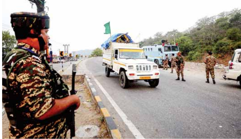
Security personnel guard as vehicles leave the Amarnath yatra base camp Bhagwati Nagar during a 'dry run' conducted by the authorities ahead of annual Amarnath Yatra, in Jammu, on Wednesday

arrangements have been made in Lakhanpur — the gateway to Jammu and Kashmir and along the yatra route to prevent the movement of any suspected persons, the security forces are taking no chances to allow the Pakistan-based terrorists to target the Amarnath yatra. Quick Reaction Teams have been stationed along the highway at vantage locations while separate security checkpoints have been established along the border roads connecting the Jammu-Pathankot highway. To check the movement of suspected persons high-powered CCTV cameras have been installed along the yatra route. Security has been beefed up across the base camp in Jammu, Pahalgam and Baltal in the Kashmir valley to ensure an incident-free yatra. Divisional Commissioner Jammu, Romesh Kumar, along with ADGP, Anand Jain Wednesday supervised the Dry Run of Shri Amarnathji Yatra 2024 amidst tight security and complete protocol from Yatri Niwas Bhagwati Nagar to Yatra camp Lamber at Banihal. Sharing information about the