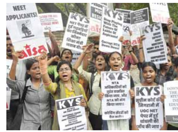
Members of various organisations, along with JNU students protest against the National Testing Agency (NTA), over the alleged irregularities in NEET-UG 2024 results at Jantar Mantar in New Delhi on Wednesday.

Over a dozen students were detained when the Jawaharlal Nehru University's students' union along with other outfits staged a protest at the Jantar Mantar here on Wednesday against the NEET-UG fiasco. The students demanded the scrapping of the NTA and the resignation of Education Minister Dharmendra Pradhan against the alleged irregularities in the medical qualifying examination. Scores of students belonging to different outfits, including the Left-backed All India Students Association (AISA) and Delhi University's Krantikari Yuva Sangathan participated in the protest. The students carried posters and placards, with slogans such as "Dharmendra Pradhan istifa do (Dharmendra Pradhan resign)" and "Scrap NTA" written over them. They also demanded re-examination for the NEET-UG examination and ending the